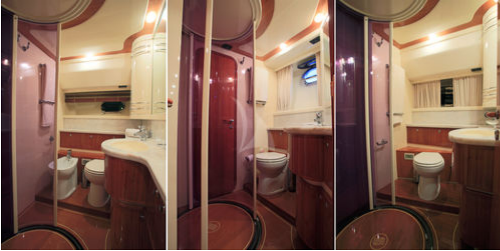
En Suite Facilities