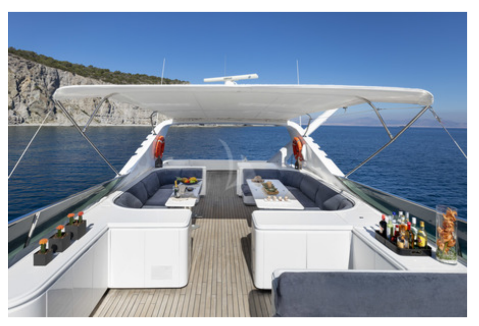
Upper deck Another view