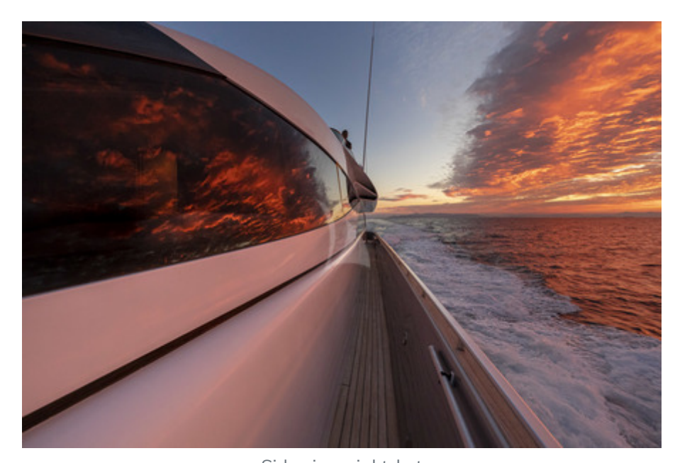
Side view nightshot