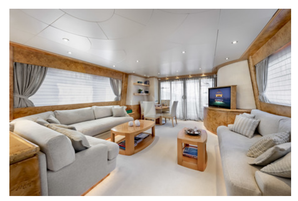
Salon another view