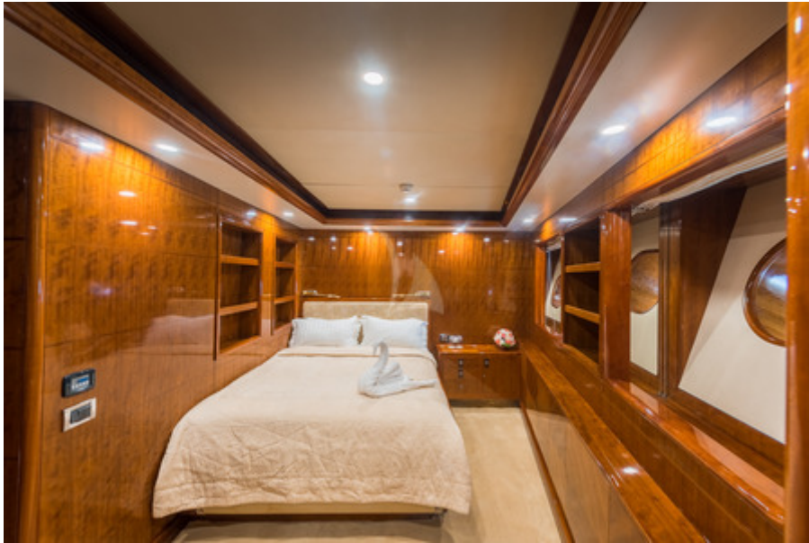
Double cabin 2