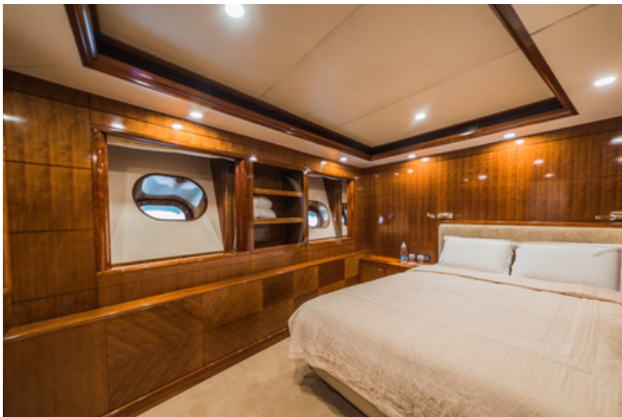
Double cabin 1