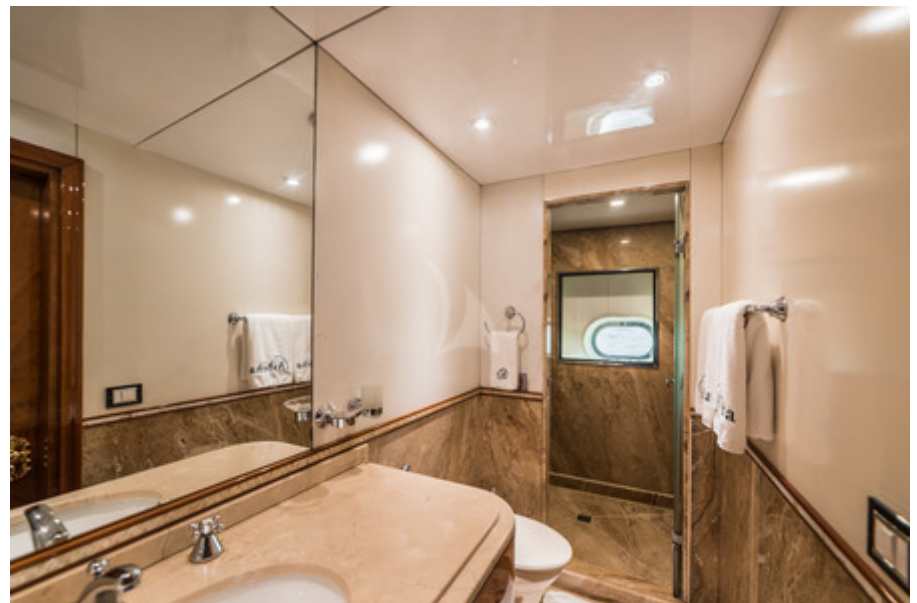
Double cabin bathroom