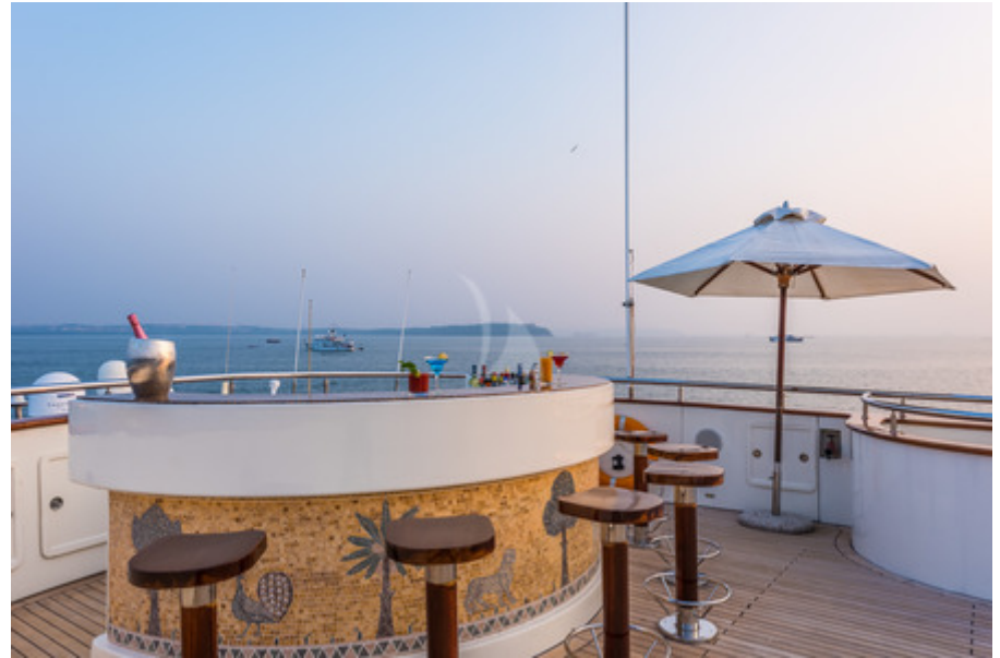
Sun deck bar