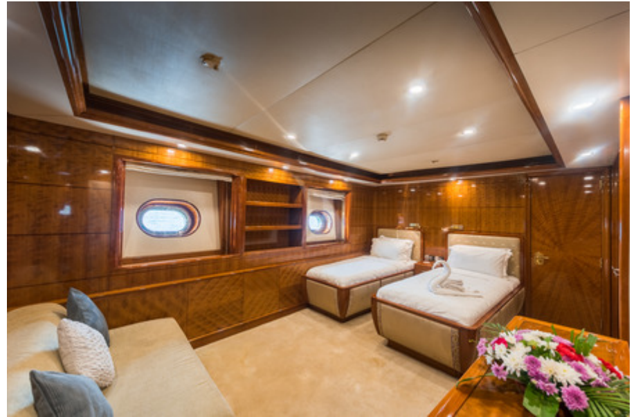
Twin cabin 1