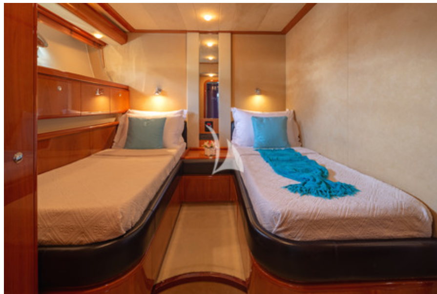
Twin Guest cabin 2