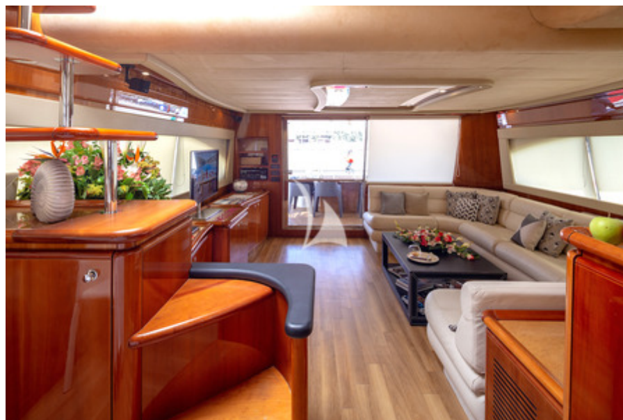
Saloon other view 2