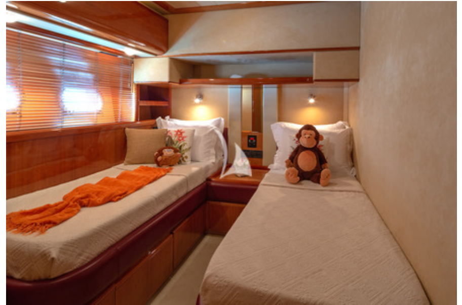
Twin Guest cabin 1