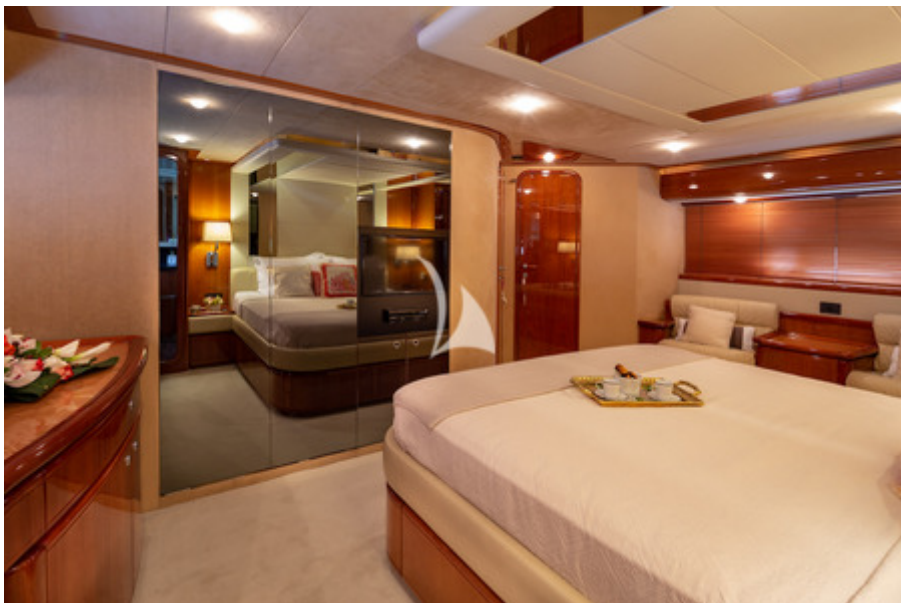
Master cabin other view