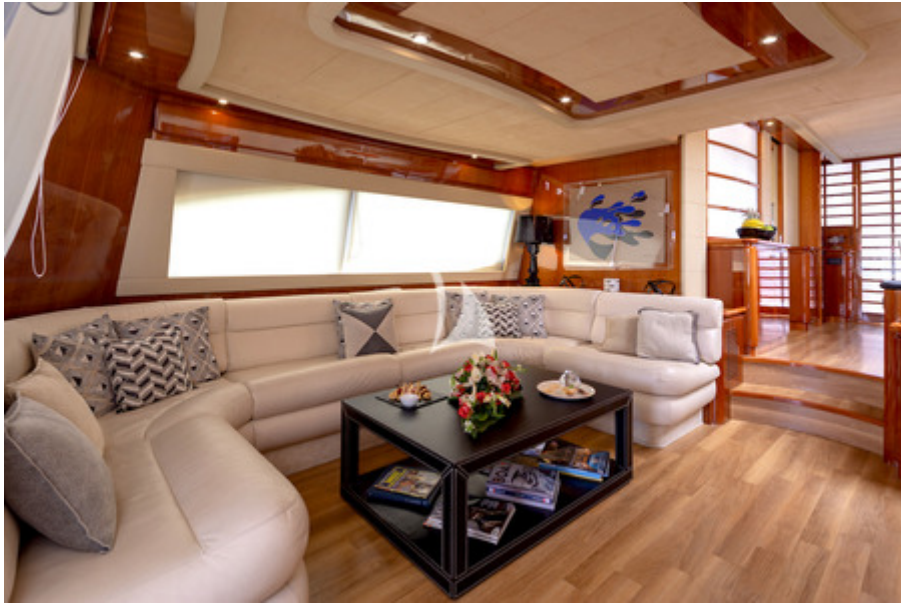
Saloon other view 3