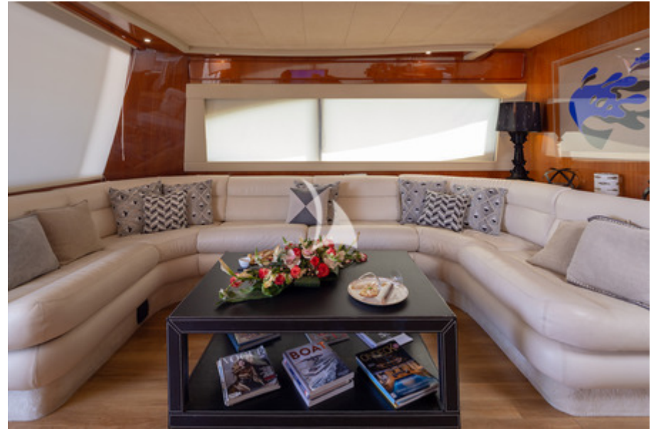
Saloon other view 4