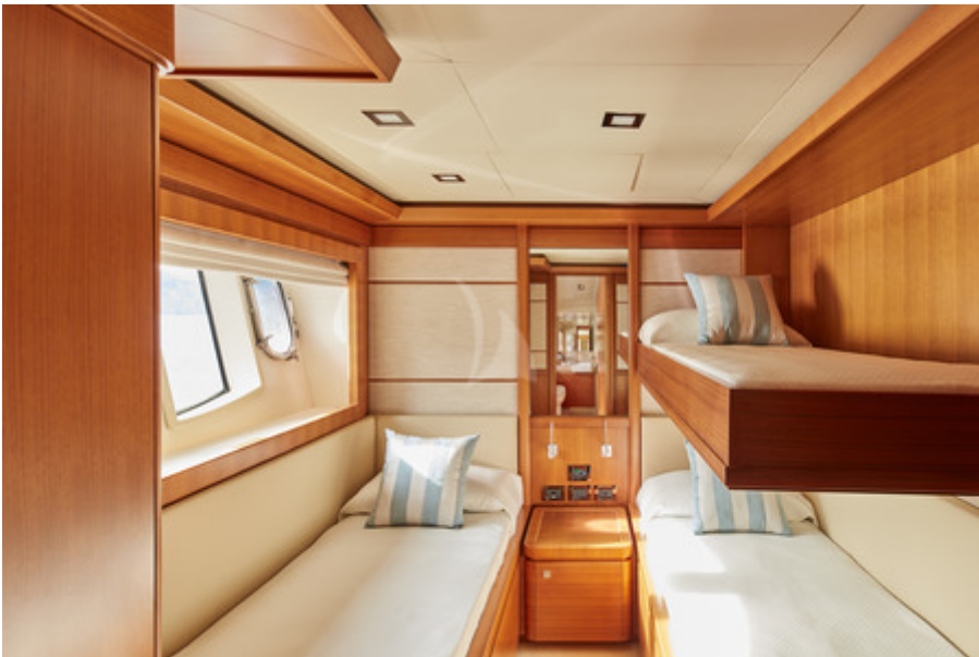
Twin Cabin with Pullman Bed