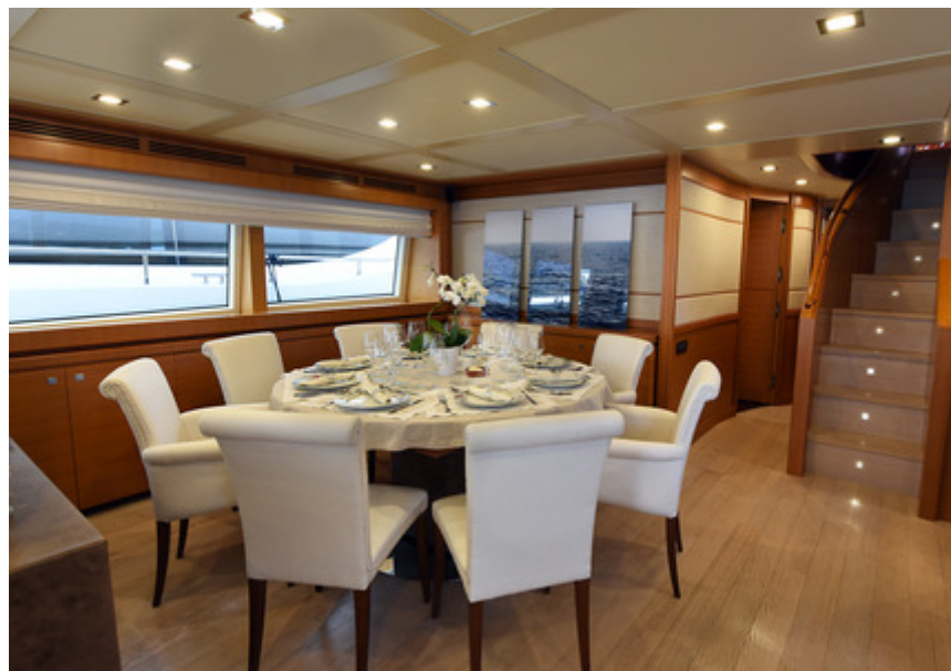
Dining Area for 8