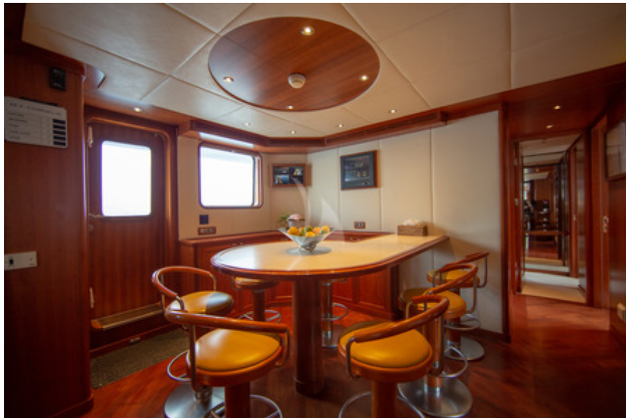
Main deck breakfast bar