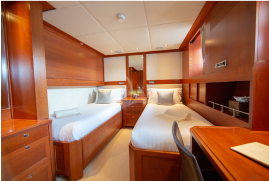
Starboard twin stateroom