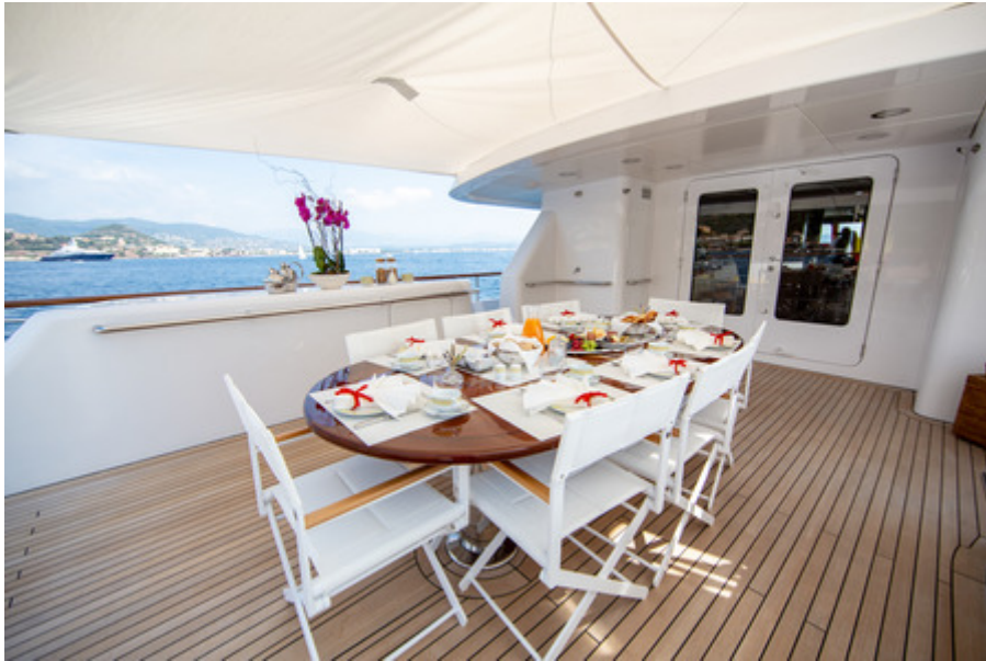
Aft deck dining