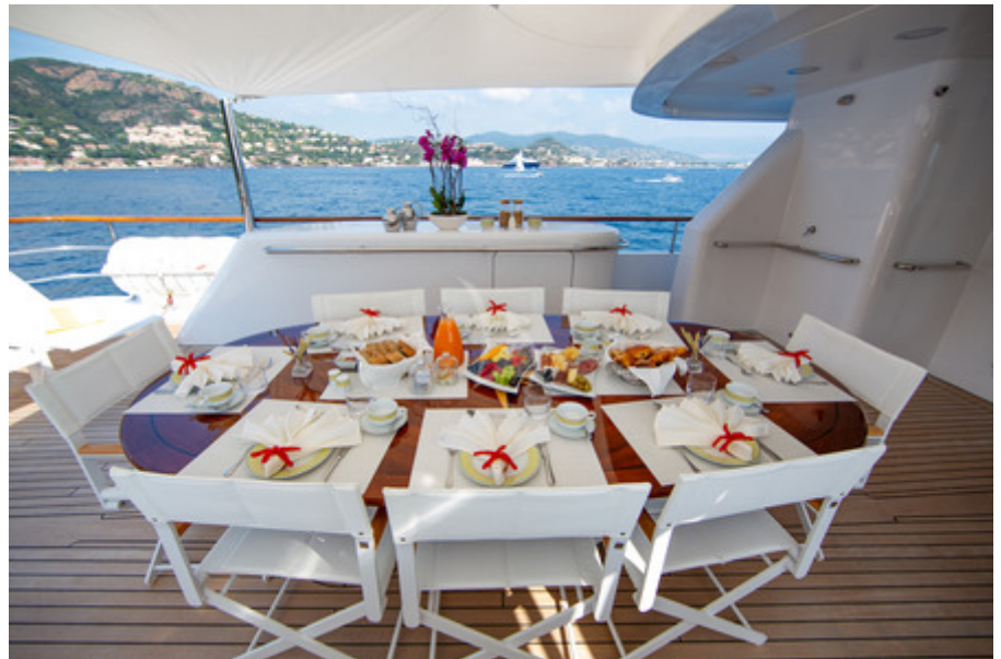
Aft deck dining