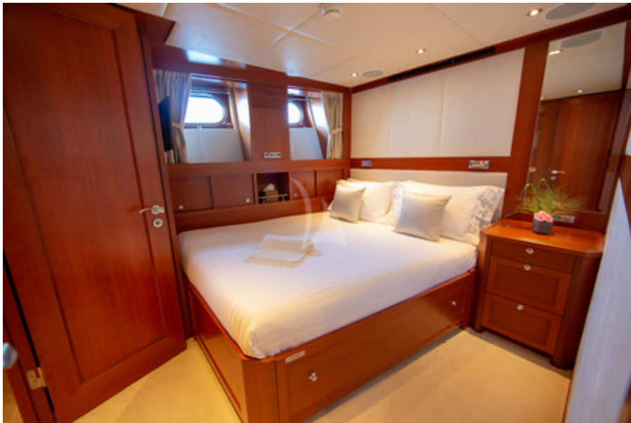
Forward double stateroom