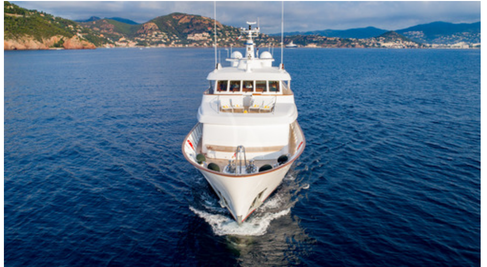
Profile forward view