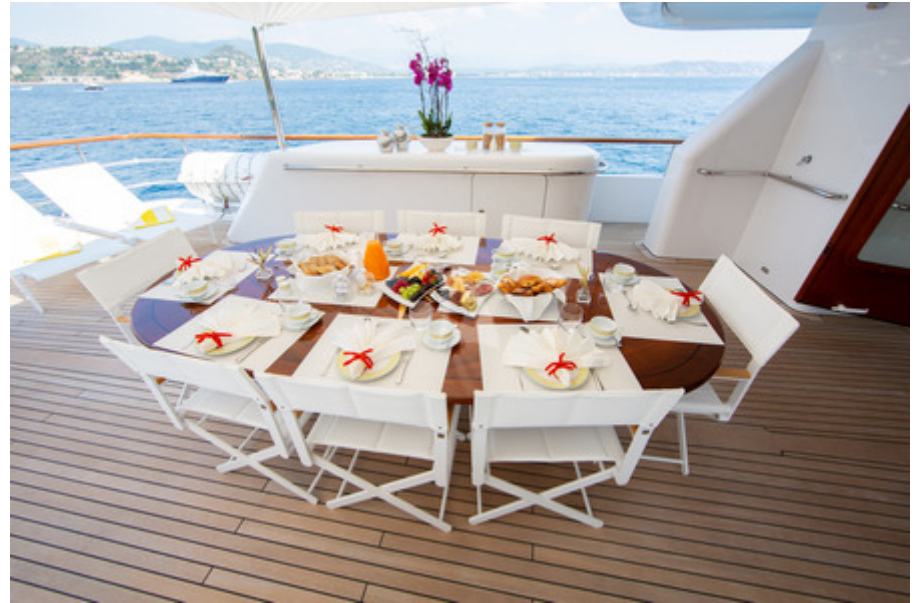
Aft deck dining