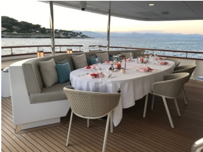
Main deck aft