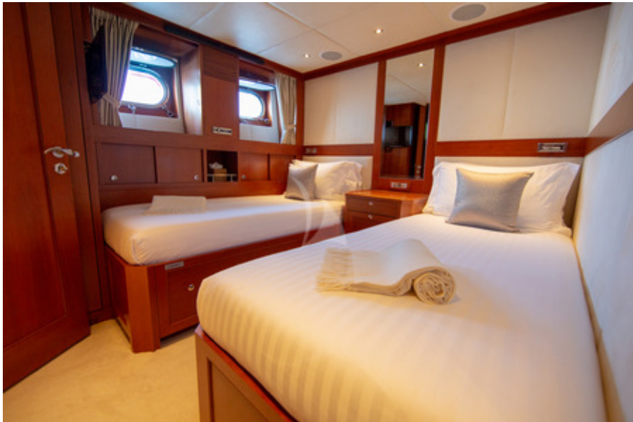
Aft port twin stateroom