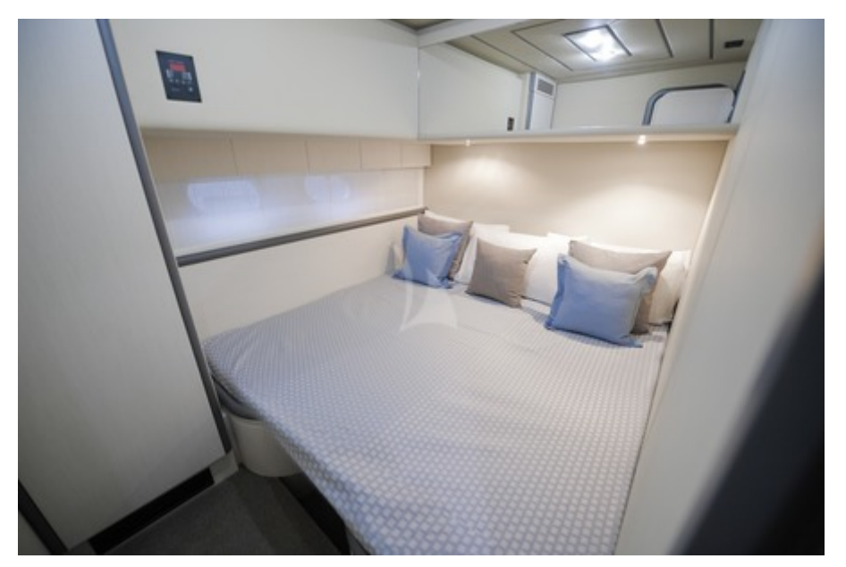
Twin Cabin convertible (version with double beds)