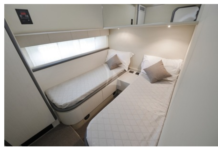
Twin Cabin (version with 2 single beds)