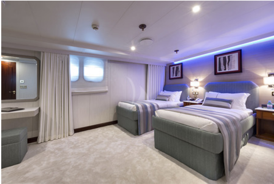
Chakra Guest Cabin