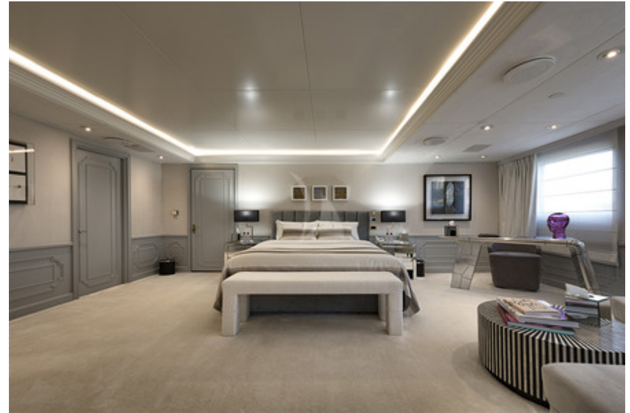
Chakra Master Suite