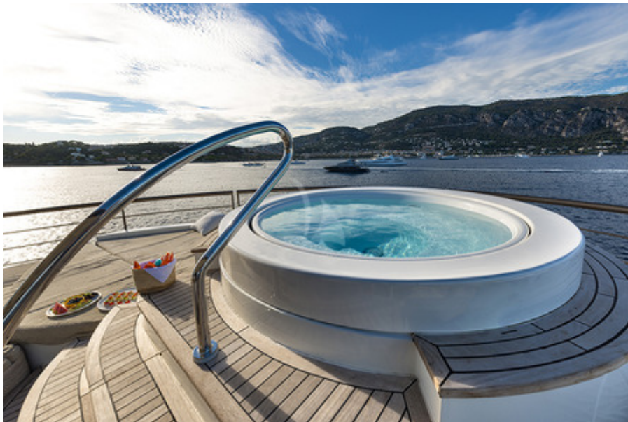
Chakra Aft Jacuzzi