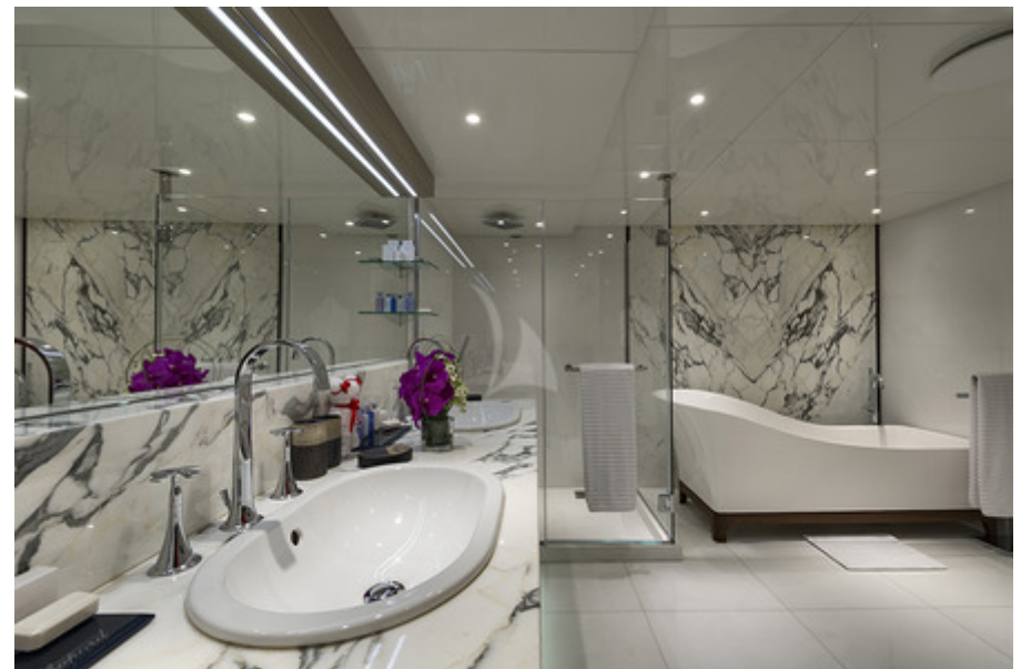
Chakra Owner's Bathroom