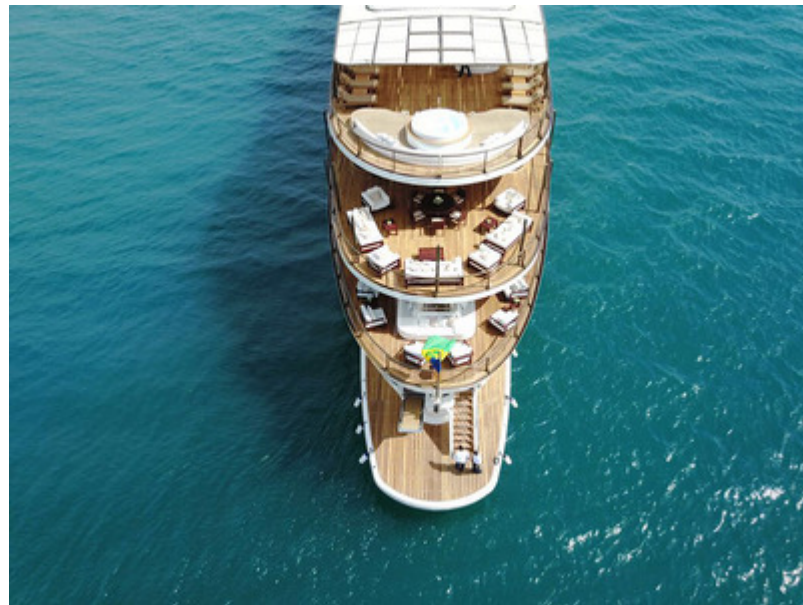
Chakra at anchor