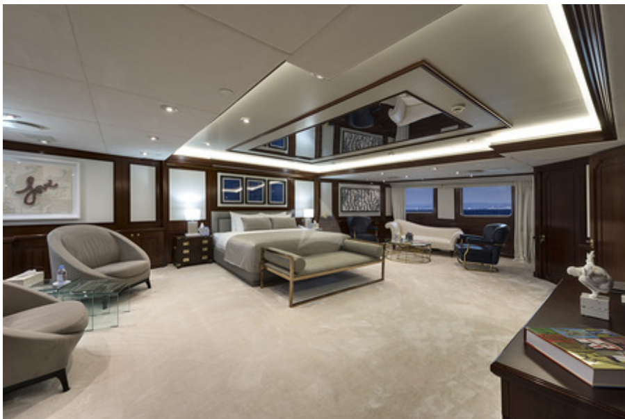
Chakra Owner's Cabin