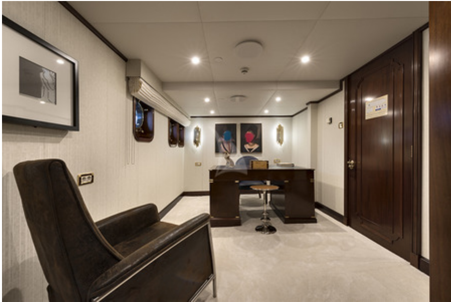
Chakra Owner's Office