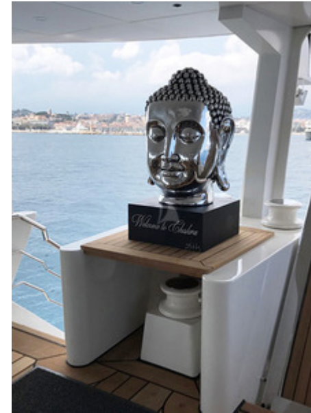
Chakra Decoration detail