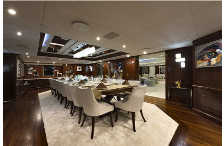
Chakra Dining Area