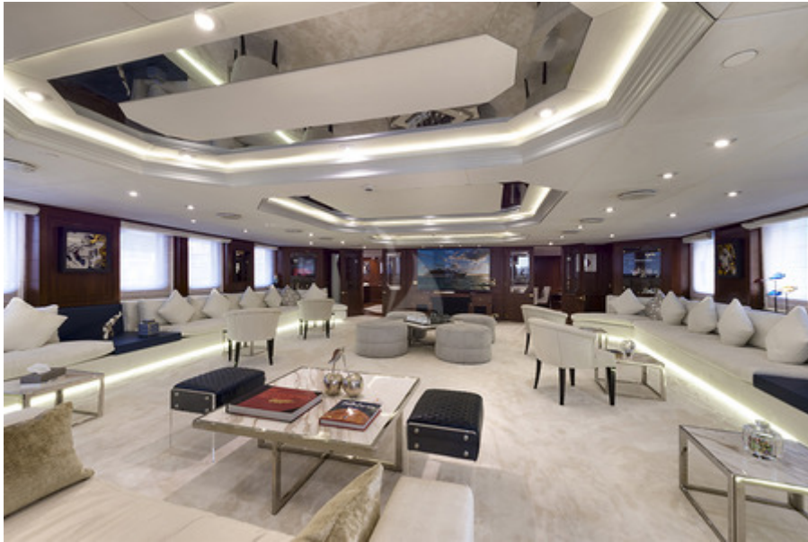
Chakra Main Salon Lounge Area