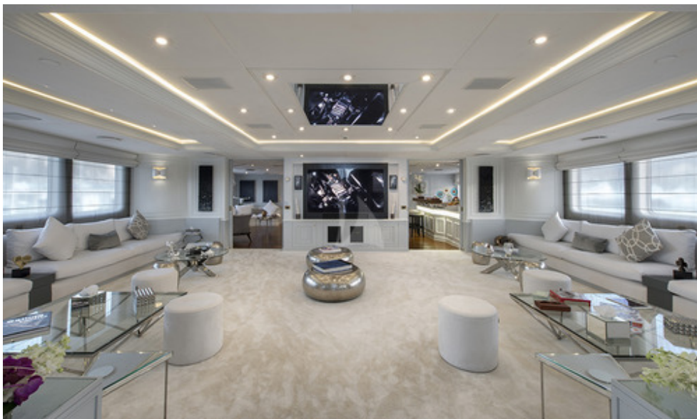
Chakra Club Area