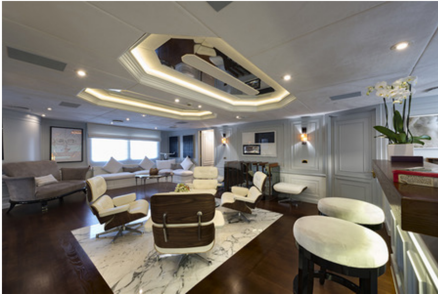
Chakra Club Area