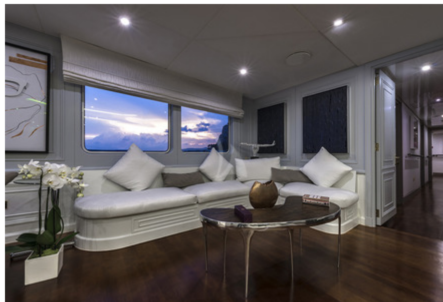
Chakra Lounge Bar