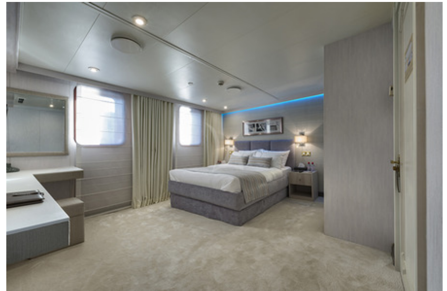
Chakra Guest Cabin