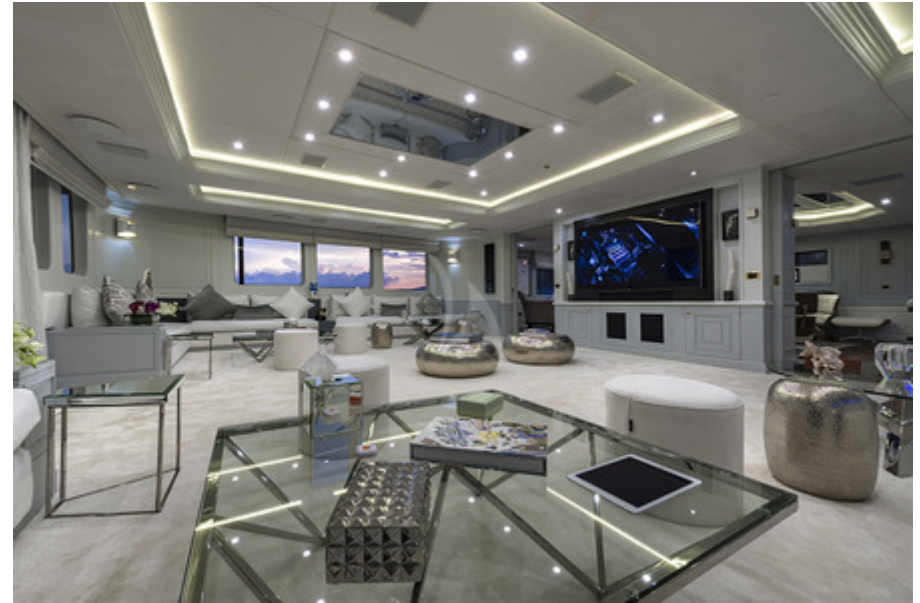
Chakra Club Area