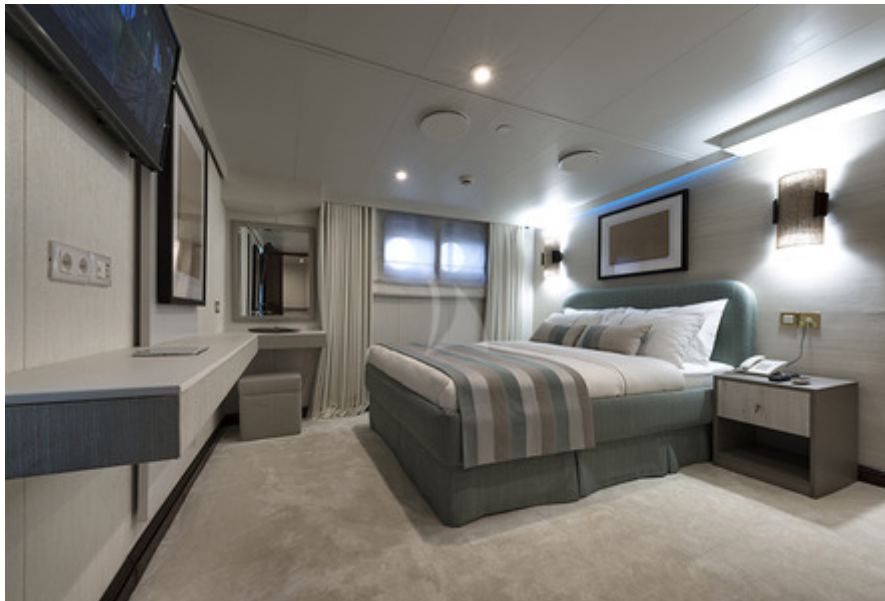
Chakra Guest Cabin