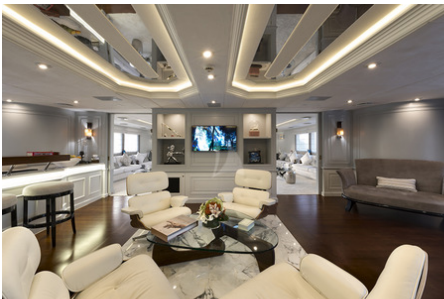
Chakra Club Area