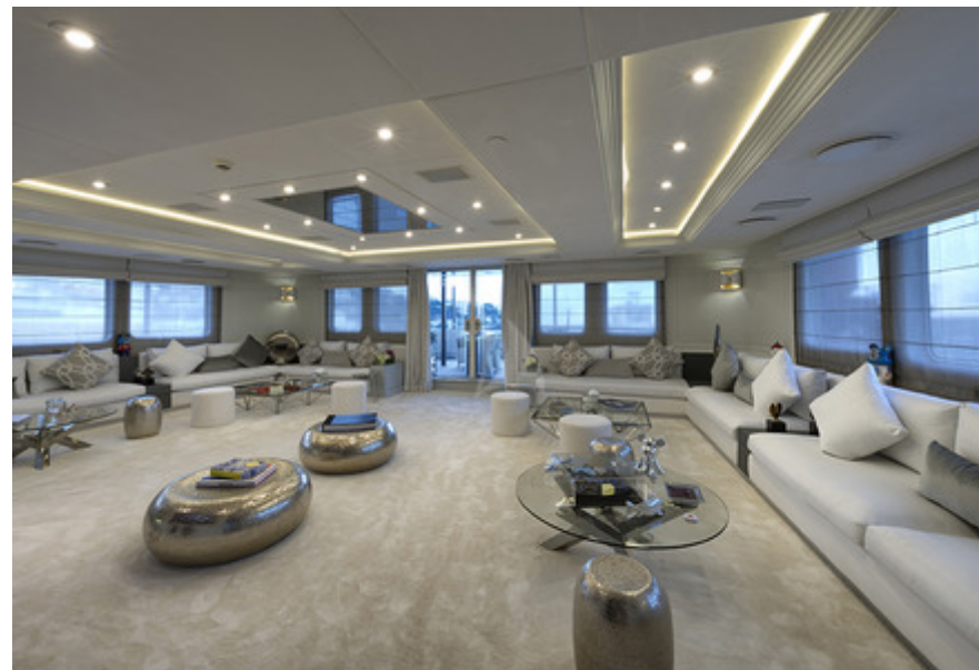
Chakra Club Area