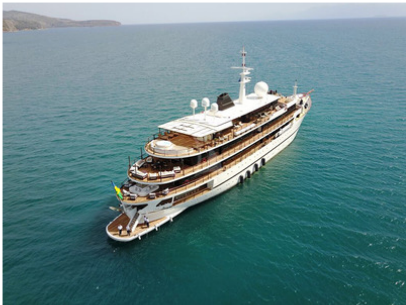
Chakra aerial view