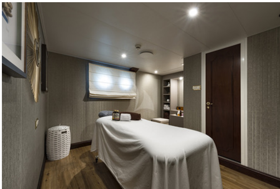
Chakra Massage Room