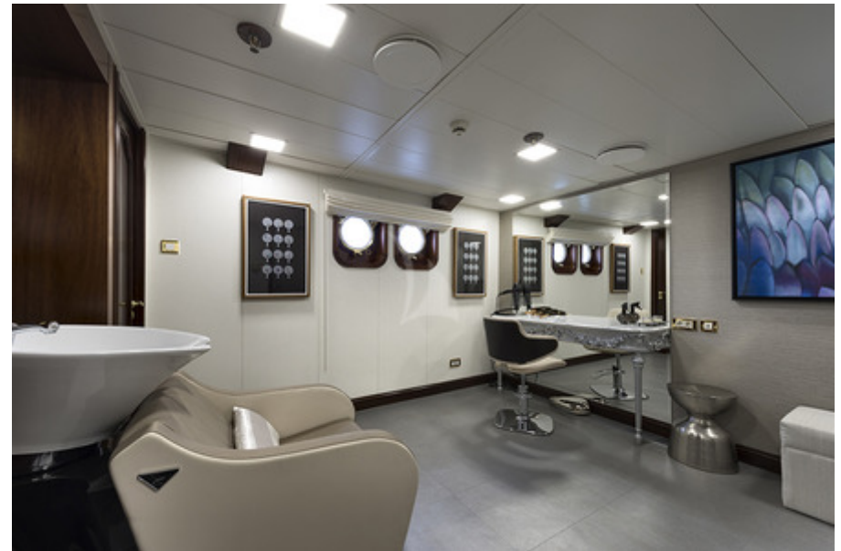
Chakra Beauty Parlor