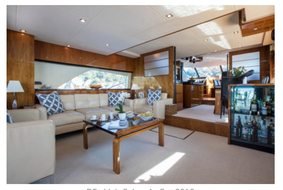
D5 - Main Saloon 1 - Sep 2016