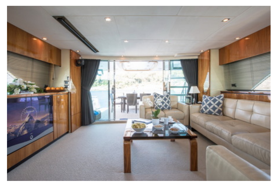
D5 - Main Saloon 2 - Sep 2016