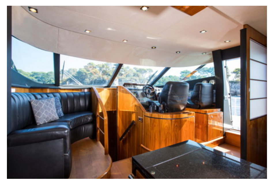
D5 - Bridge - Sep 2016