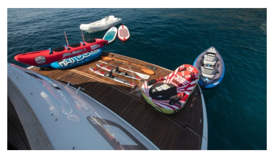
D5 - Water toys - 2016