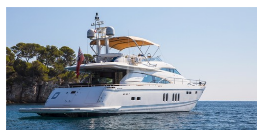
D5 - At anchor - 2016