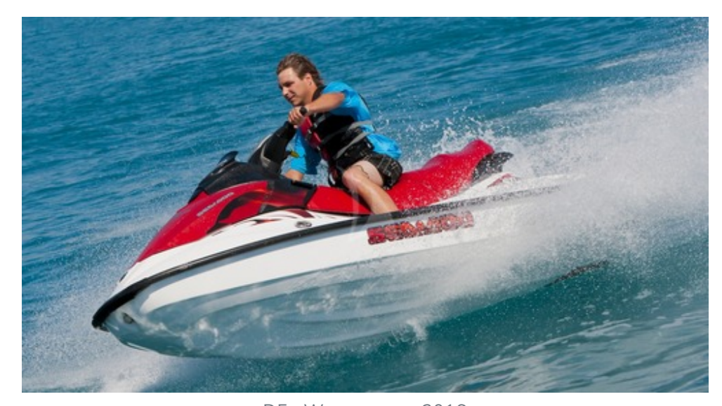
D5 - Waverunner - 2016