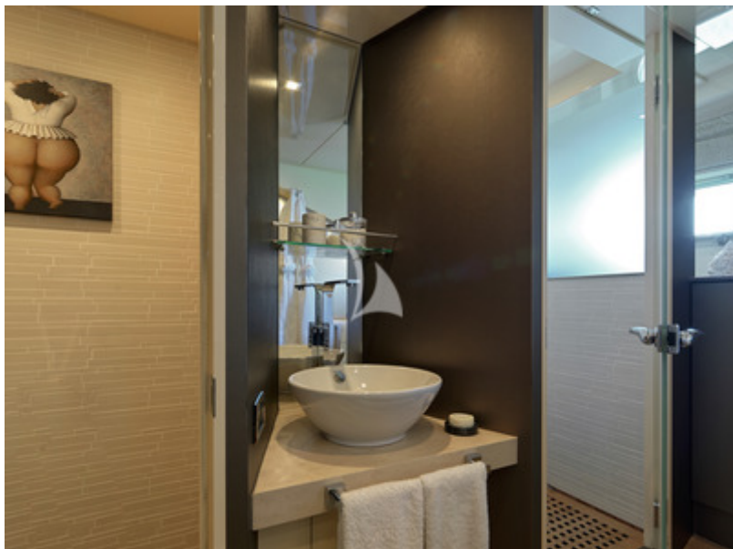
VIP cabin ensuite