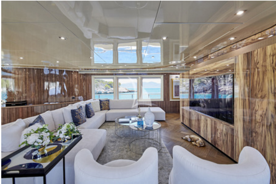
Main Saloon side view