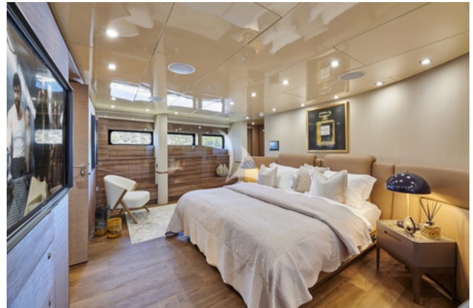
Master cabin on Main deck