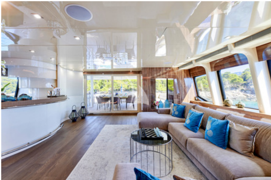
Upper Saloon other view