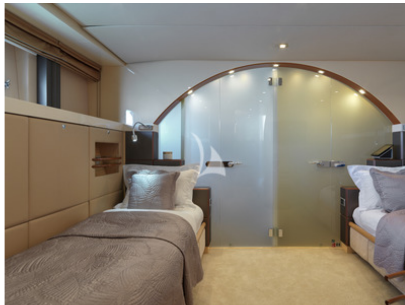
Twin guest cabin