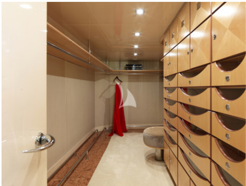
Master walk-in wardrobe