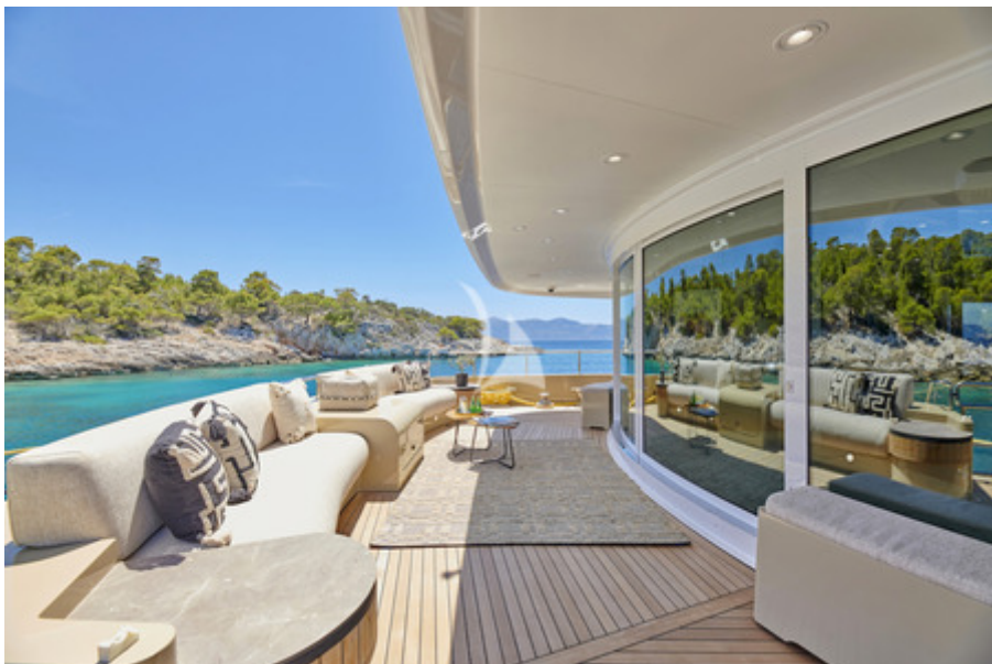
Aftdeck view 2