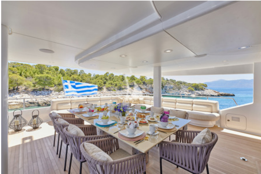
Upper deck dining 2