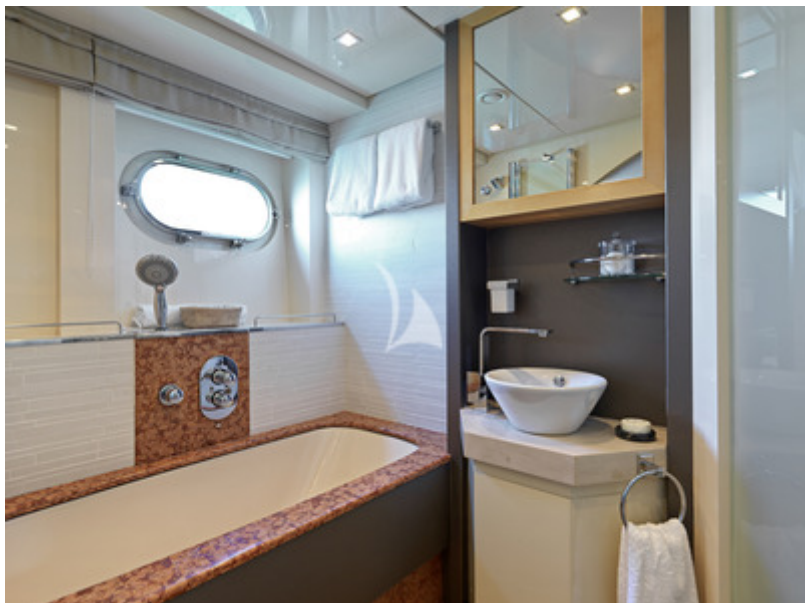
Twin guest cabin ensuite