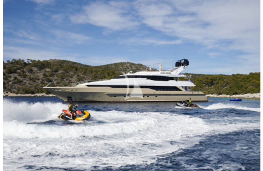
Endless water fun