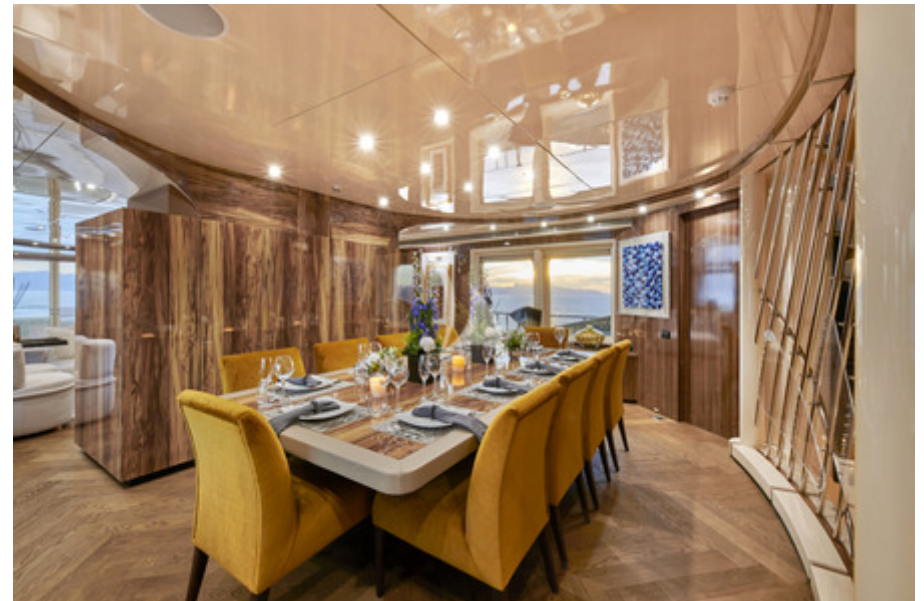
Dining area other view