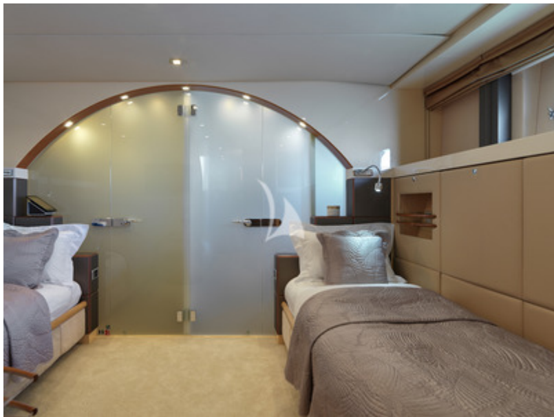
Twin guest cabin II