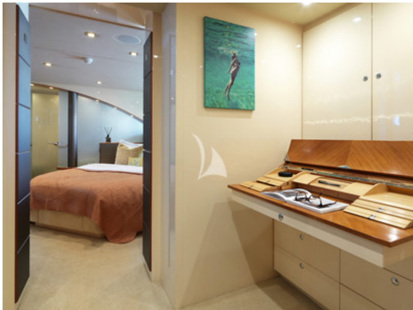
VIP cabin with office