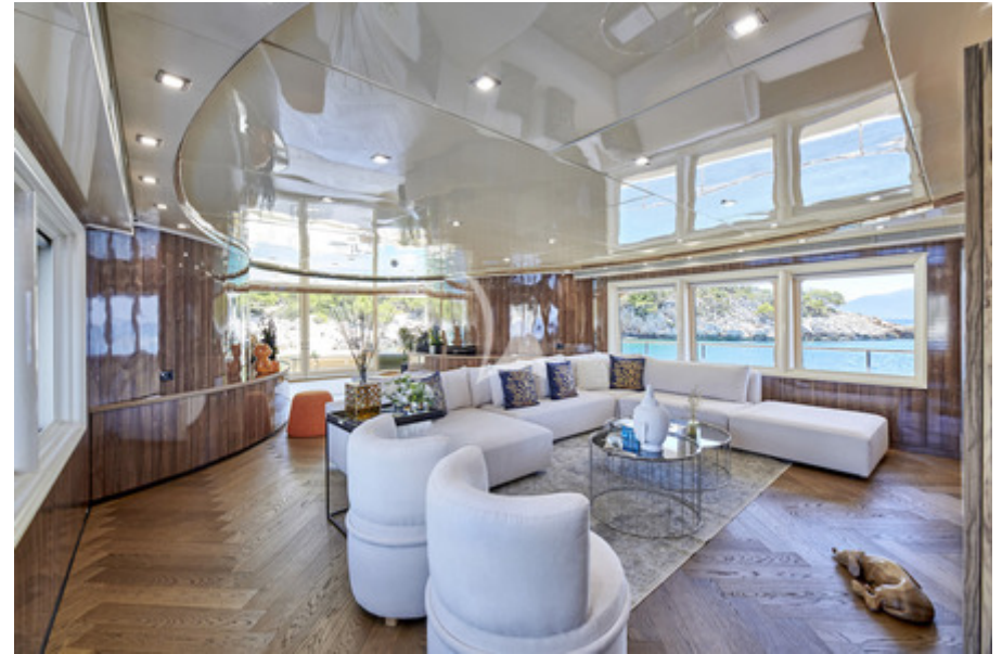
Main Saloon other view