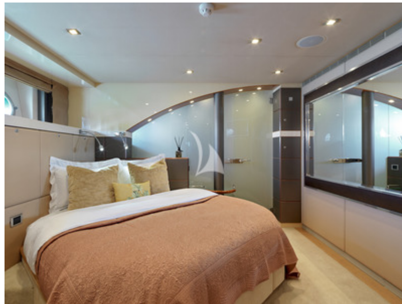
VIP cabin II