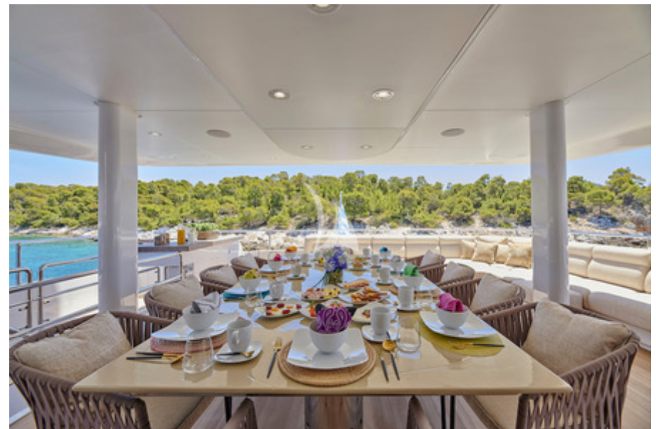
Upper deck dining