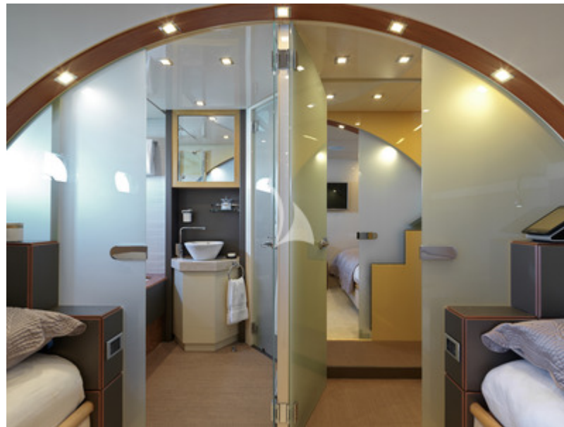
Twin guest cabin other view