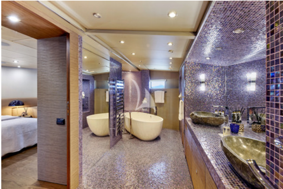
Master cabin with ensuite