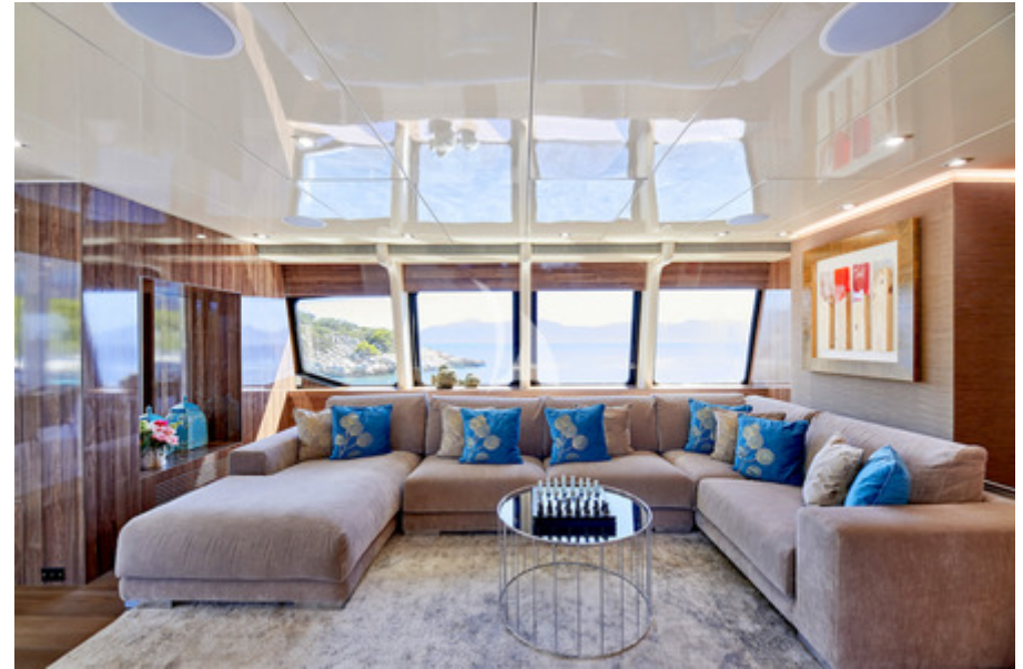
Upper Saloon side view