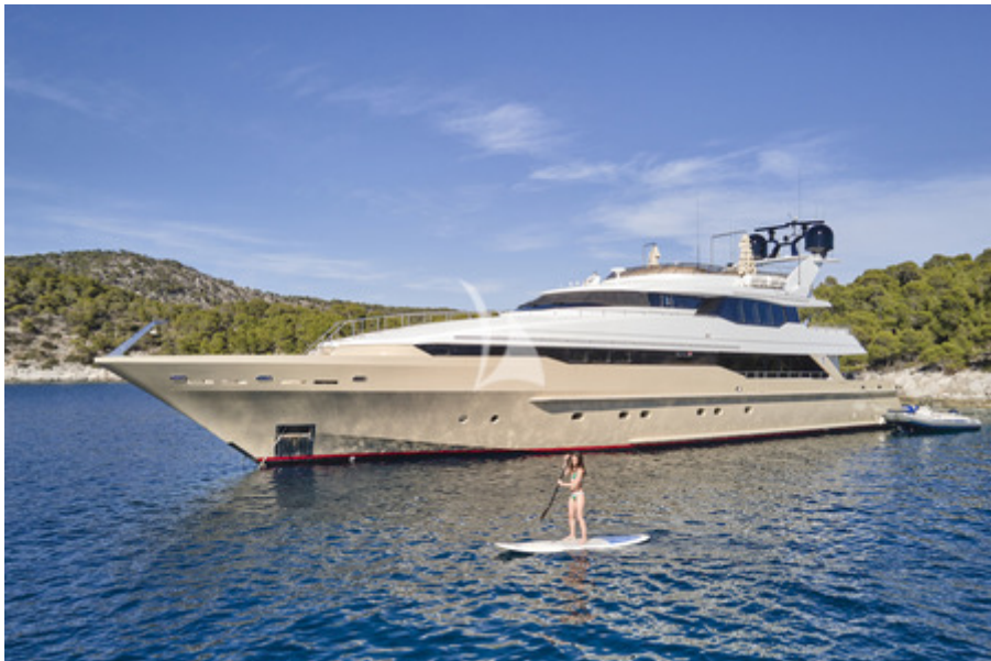
Enjoying crystal blue waters