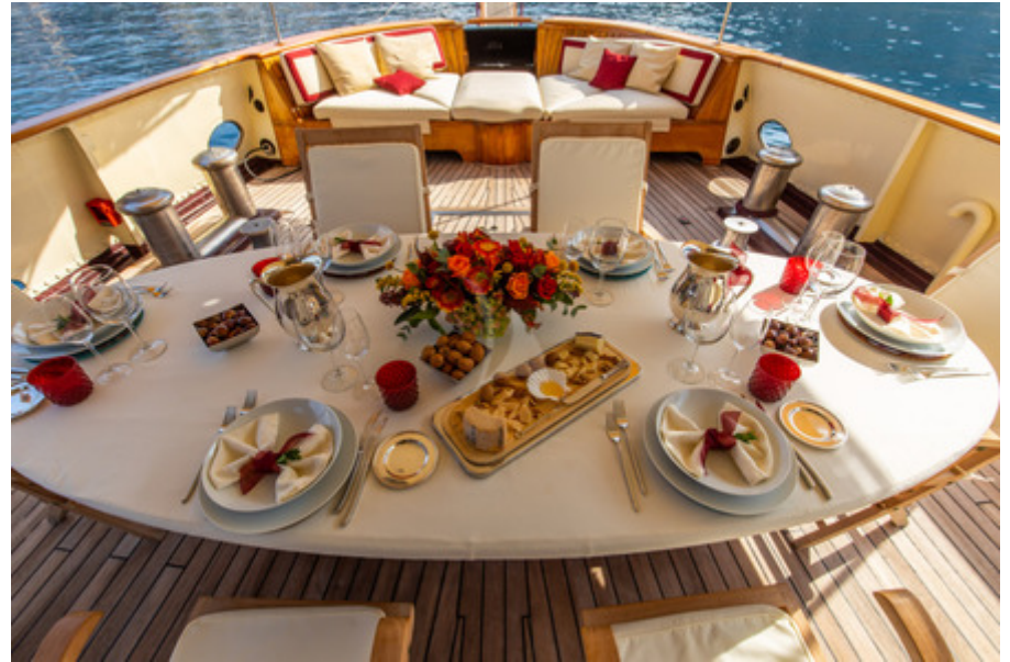
Al fresco dining table setting