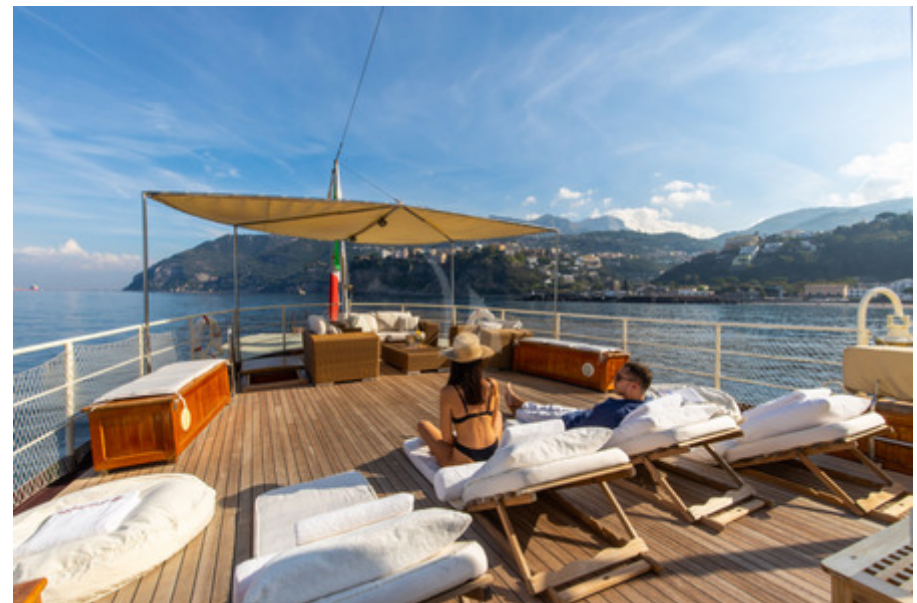
Solarium lounge area