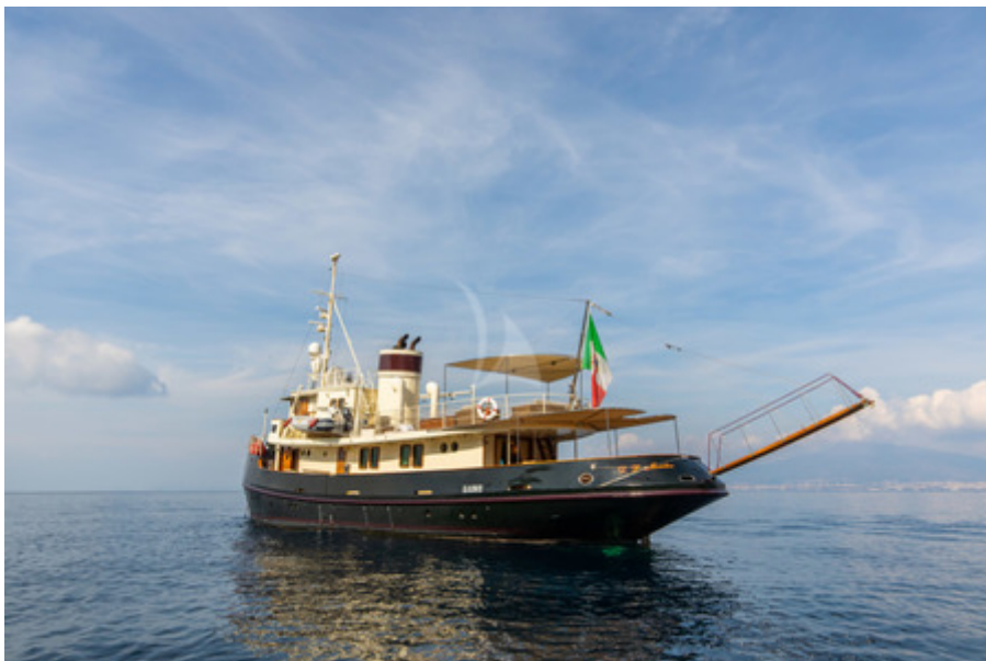
M/Y Dp Monitor