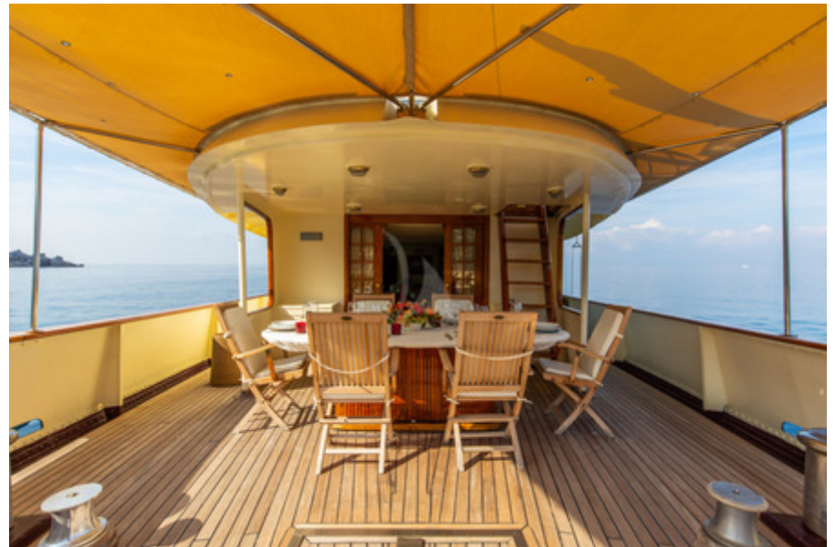
Aft deck Al fresco area