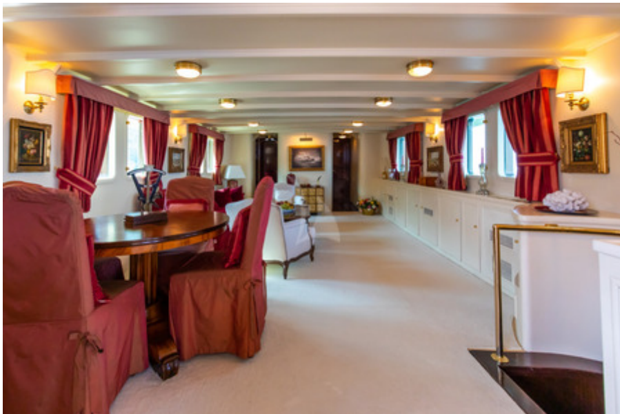
Interior salon area