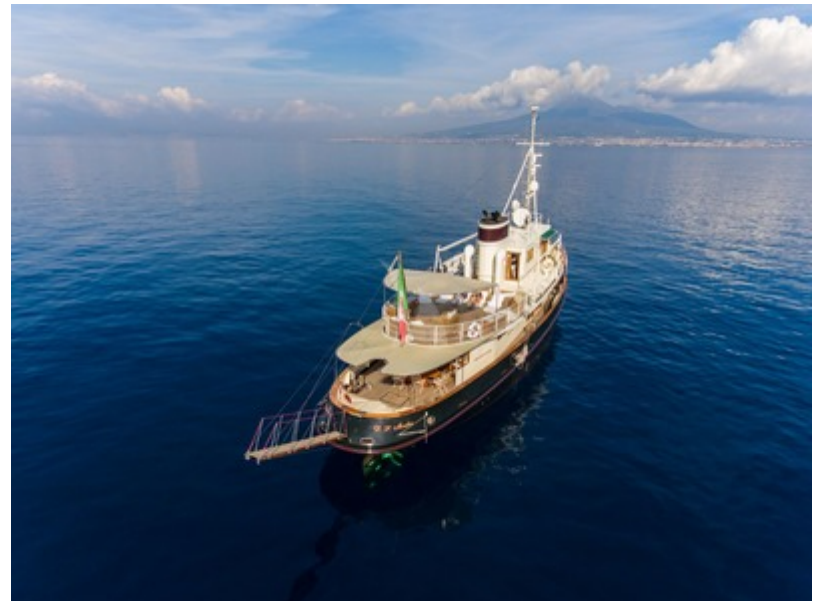
M/Y Dp Monitor