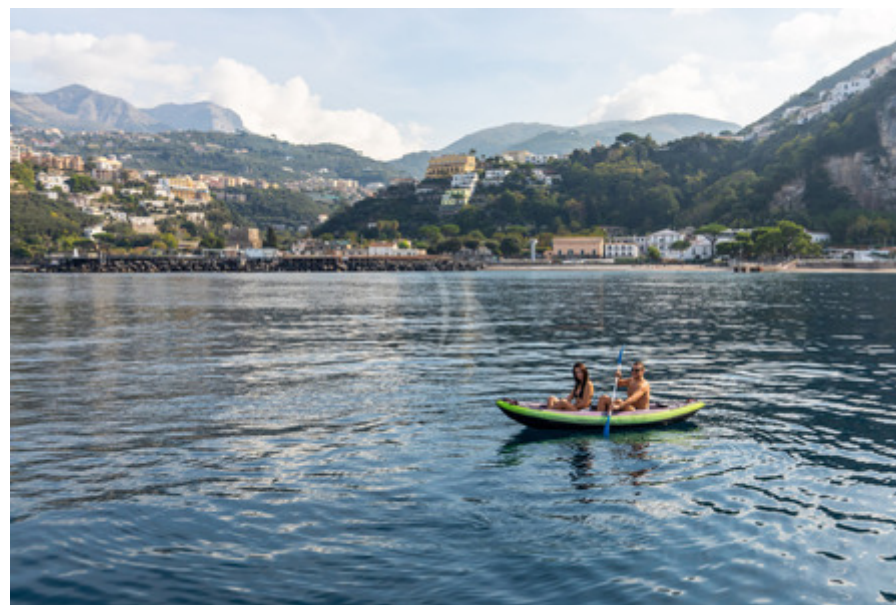
Kayak x 2