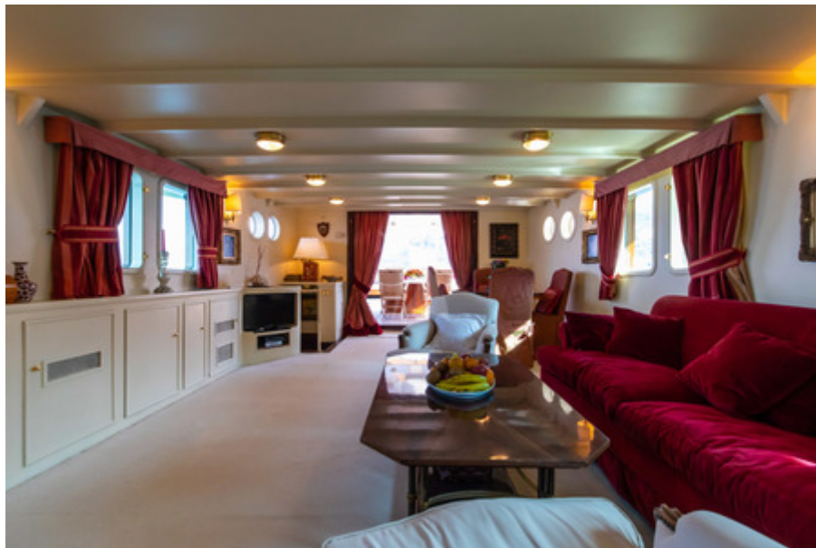
Full salon view