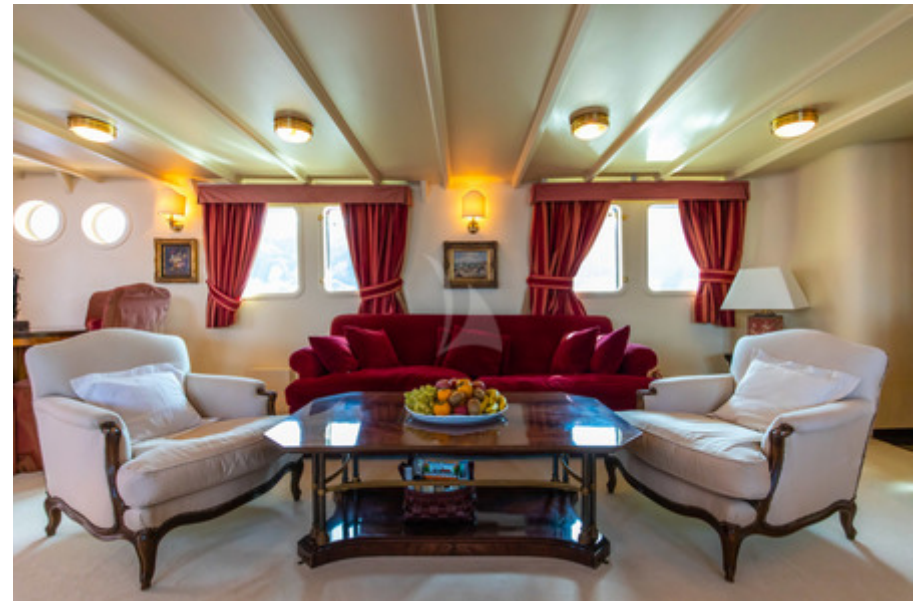
Salon's sofas and seatings