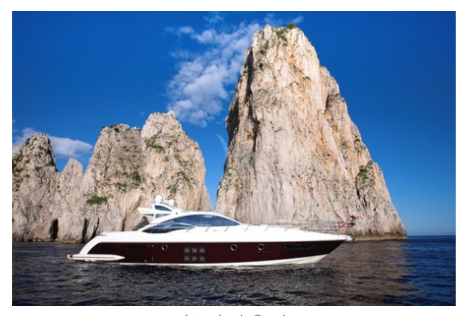
At anchor in Capri