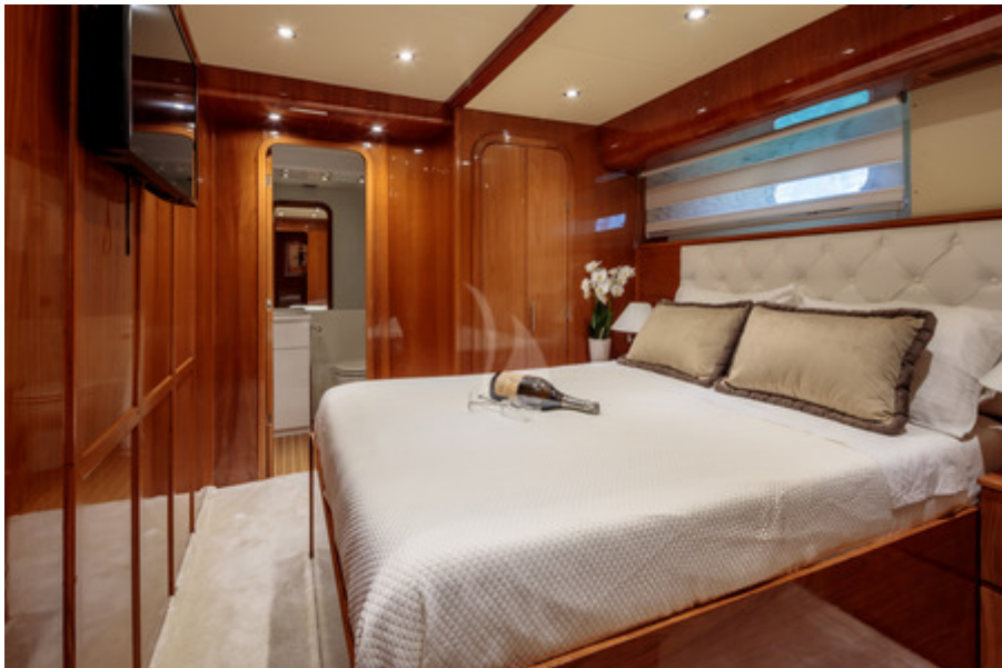
Double Cabin 1