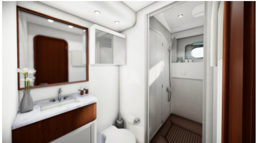
En Suite Facilities (Double Cabin 1)