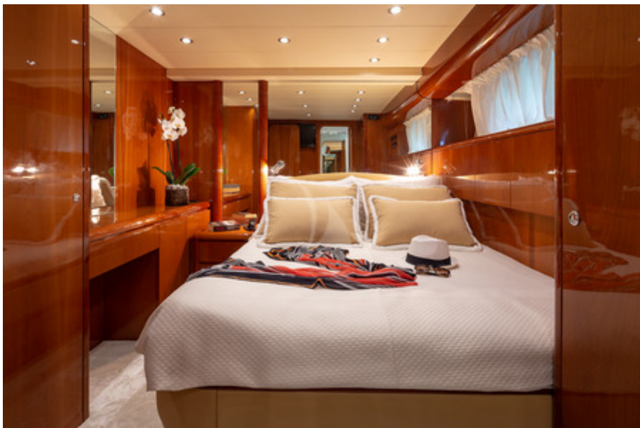
Double Cabin 3