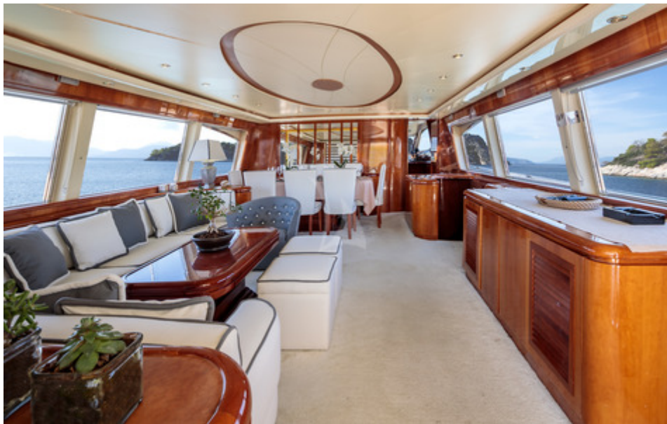
Salon & Dining Area