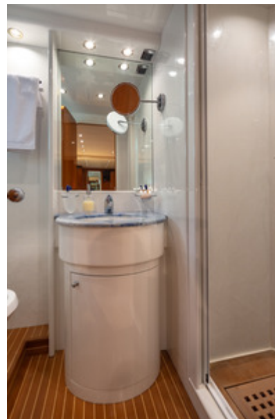
En Suite Facilities (Double Cabin 3)