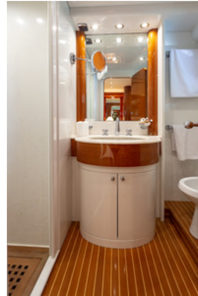
En Suite Facilities (Master Cabin)