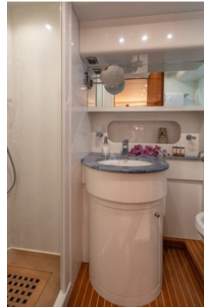
En Suite Facilities (Twin Cabin)