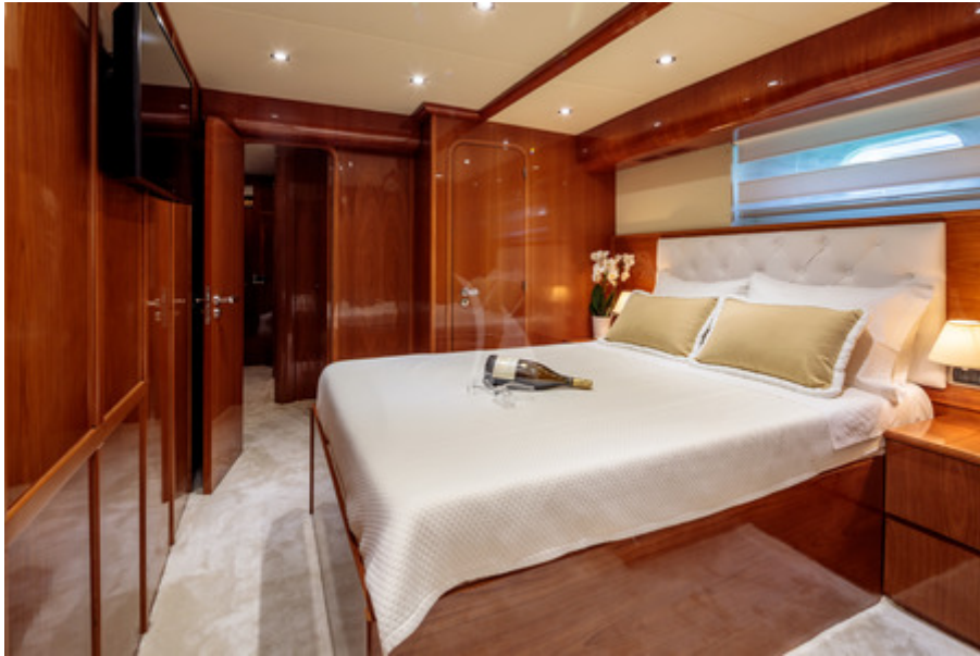
Double Cabin 2