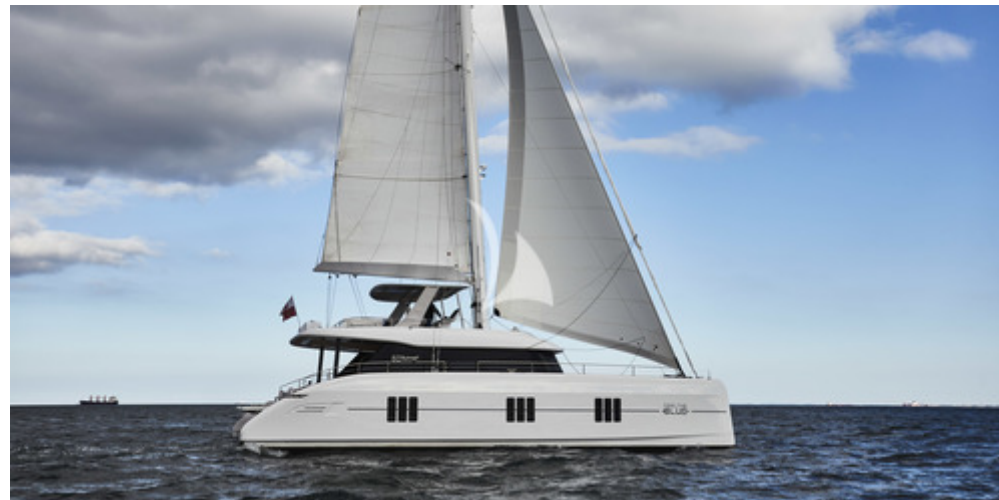
FEEL THE BLUE