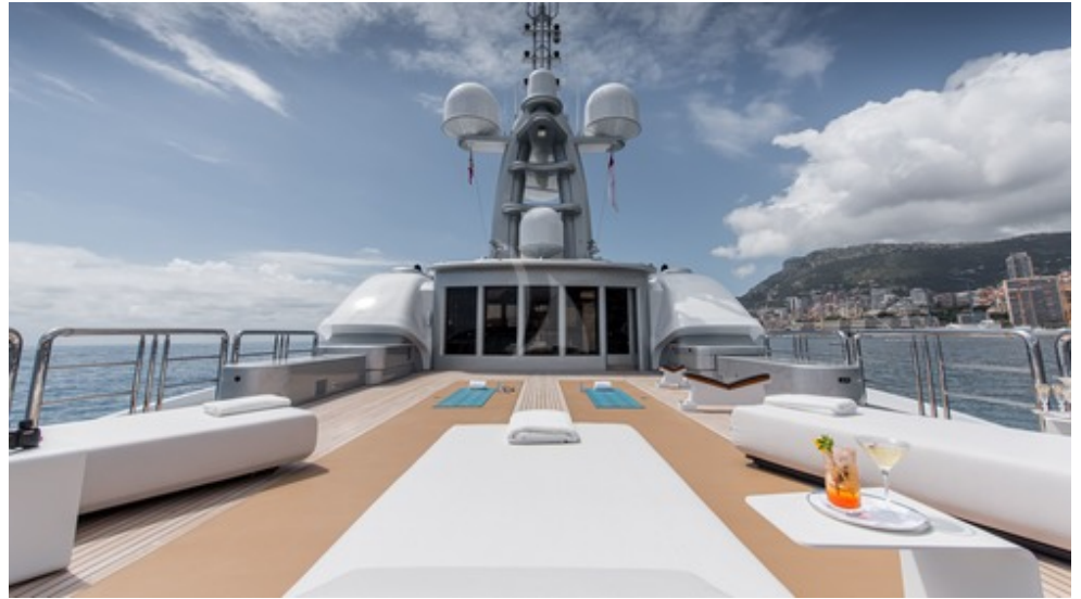
Sundeck Yoga / Exercise