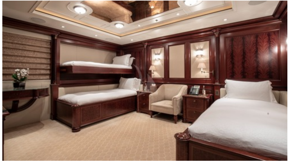
Guest Twin Cabin with Pullman