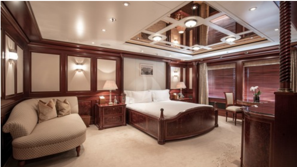
Guest Double Cabin