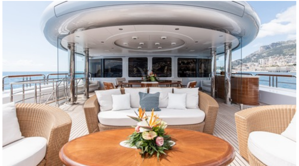
Bridge Dek Aft