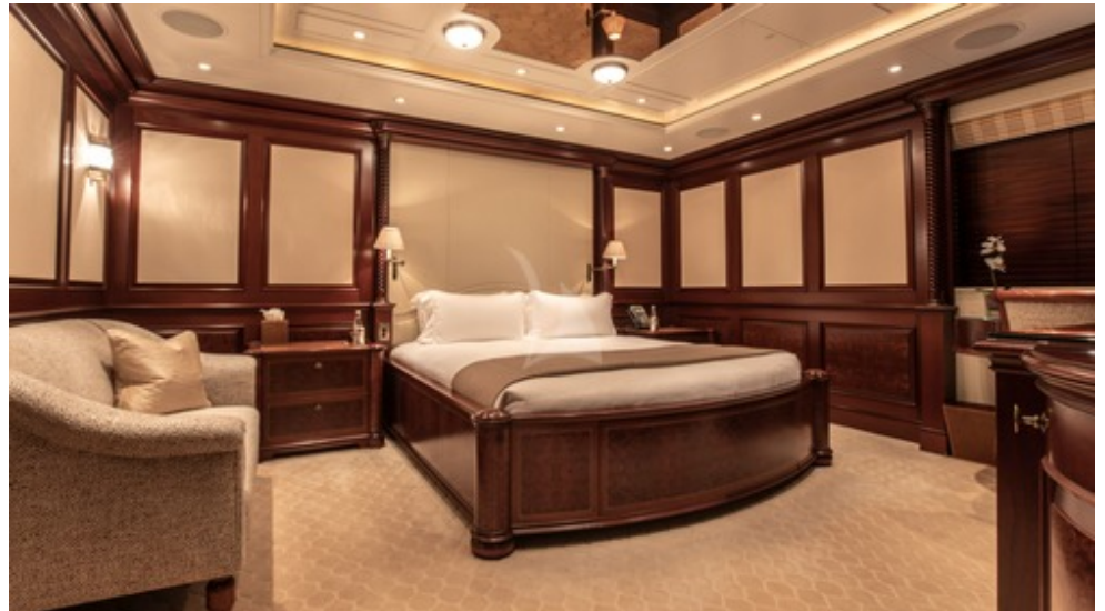
Guest Double Cabin