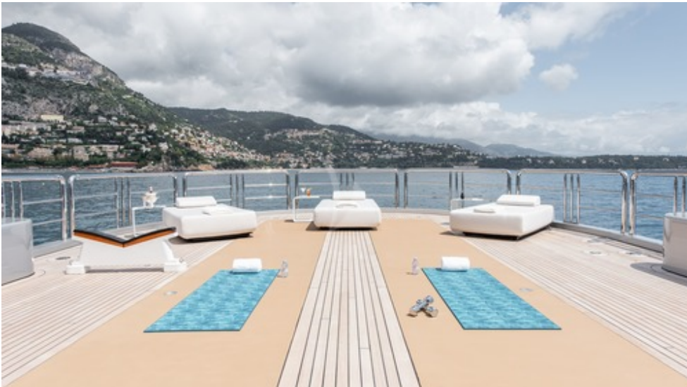
Sundeck Yoga / Exercise