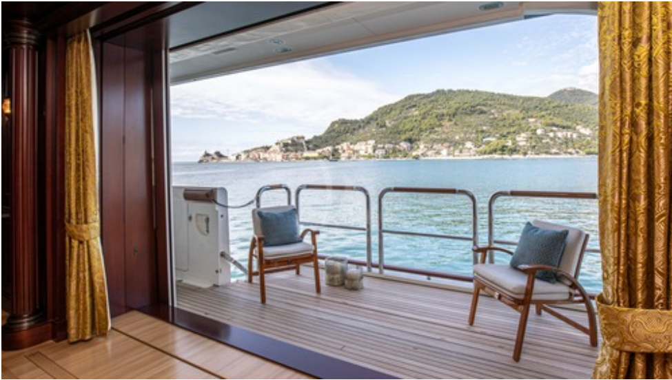
Main Deck Terrace