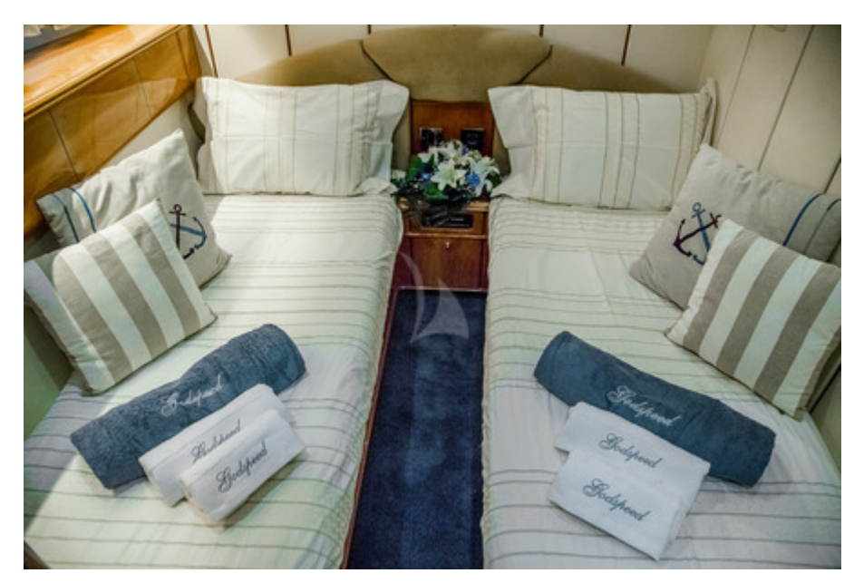
Twin Cabin Twin Cabin