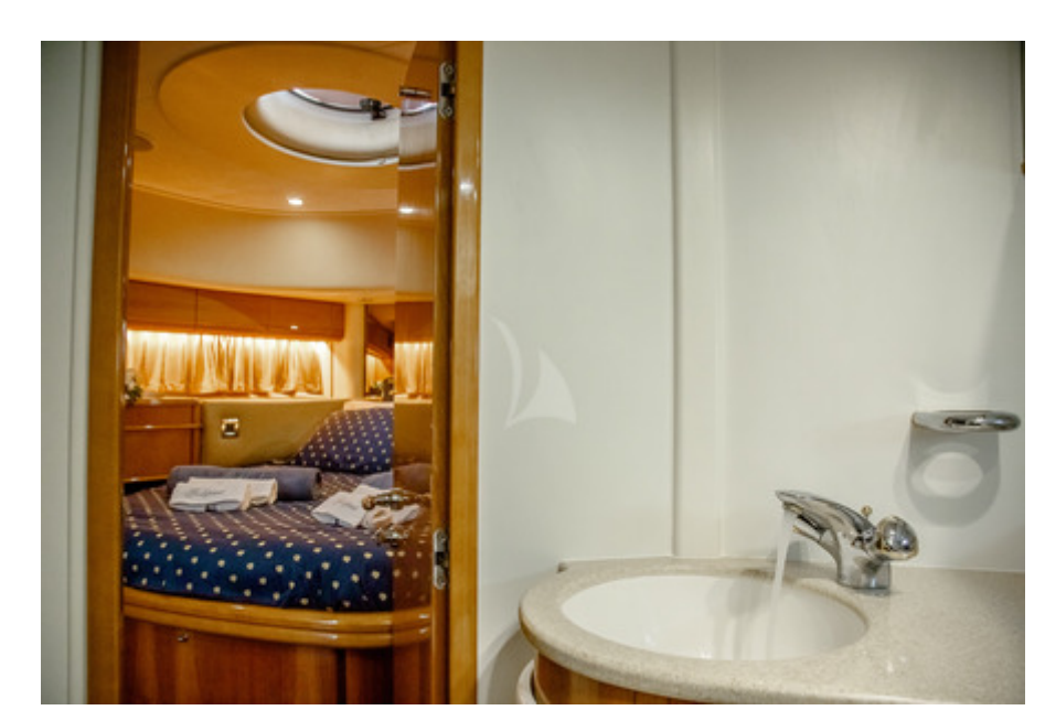
VIP Cabin en suite faciities