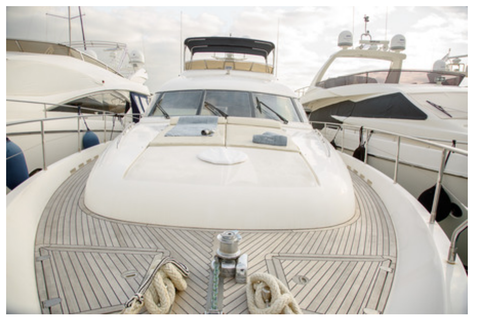
Bow sun deck