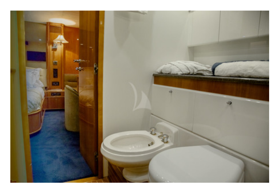
Master Cabin en suite facilities