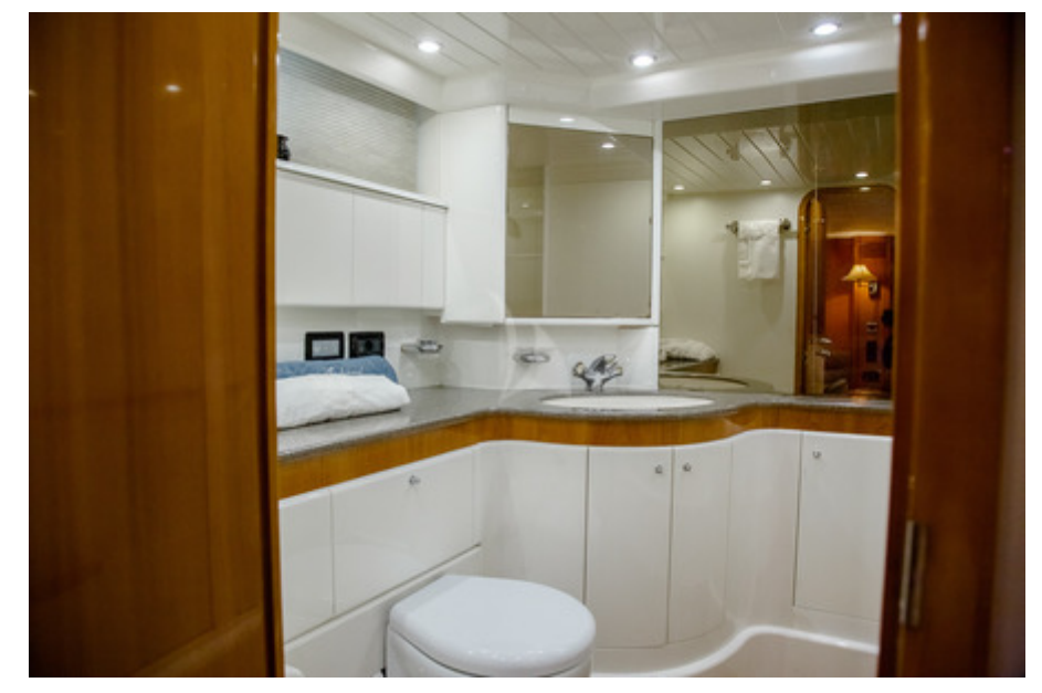
Master Cabin en suite facilities