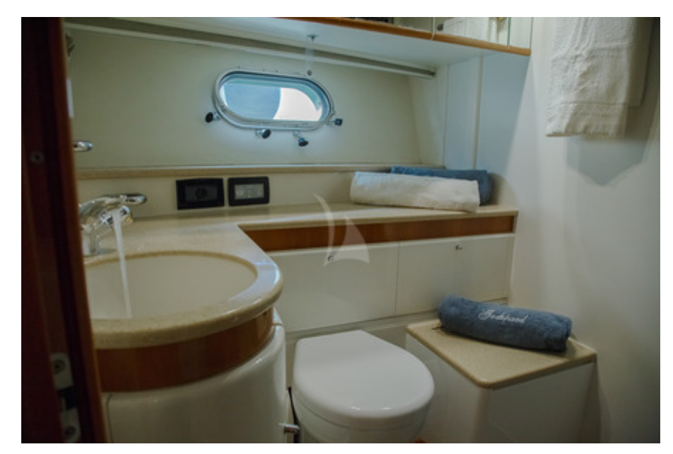
VIP Cabin en suite facilities