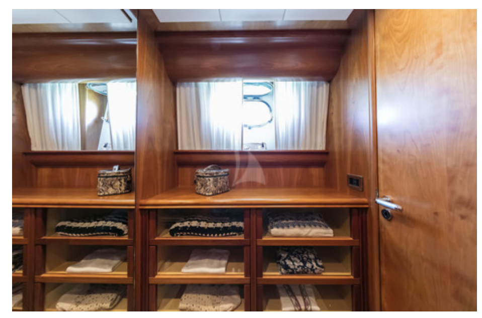
Master cabin walk-in wardrobe