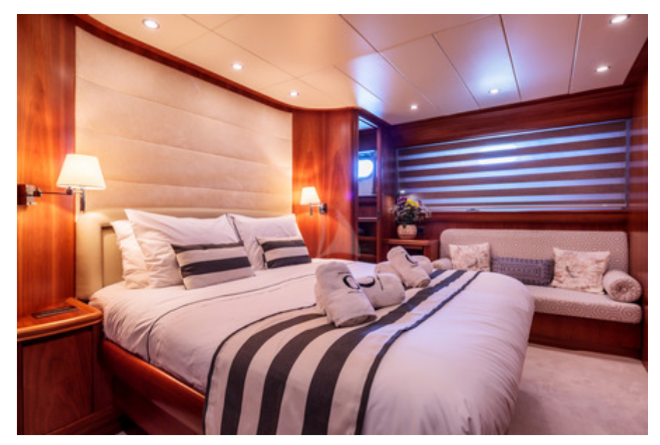
Master cabin other view