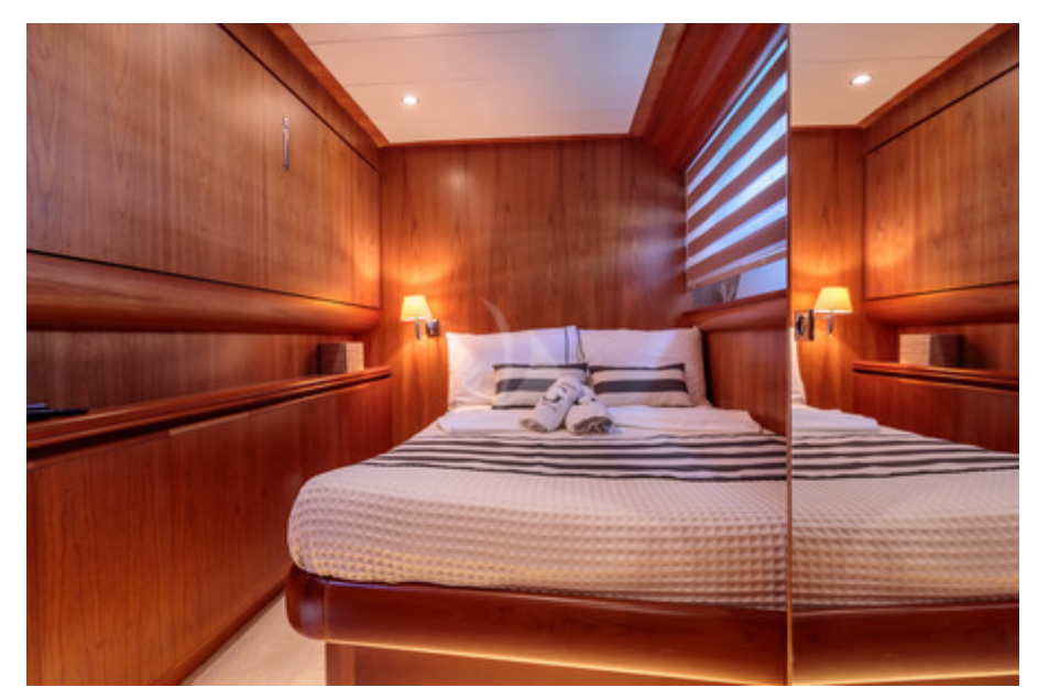
Semi-double cabin & pullman berth