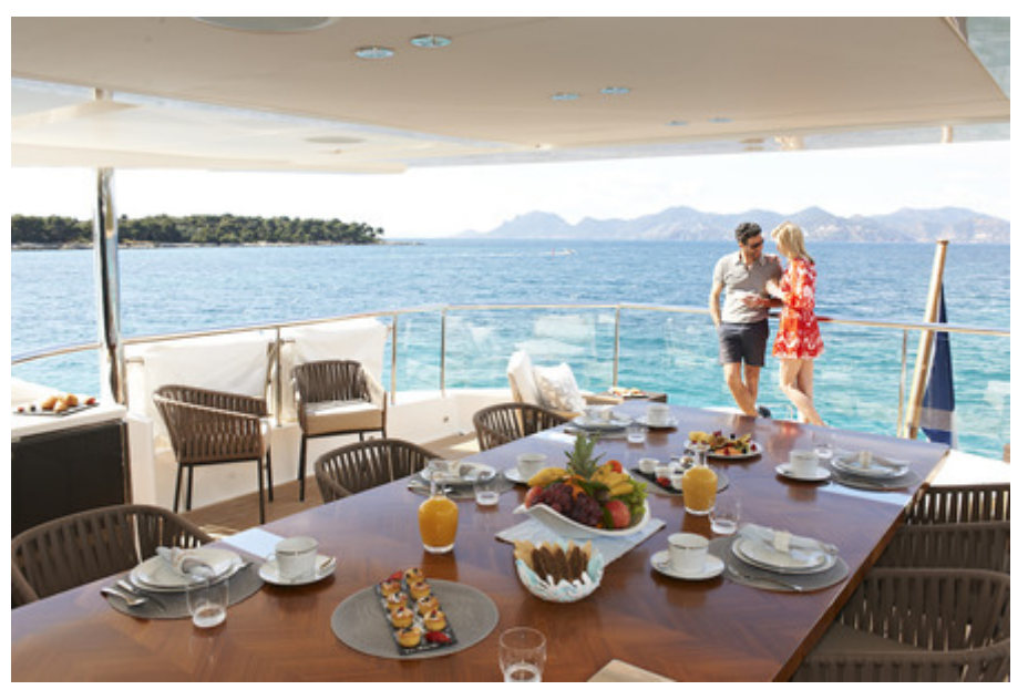
Upper Deck Dining