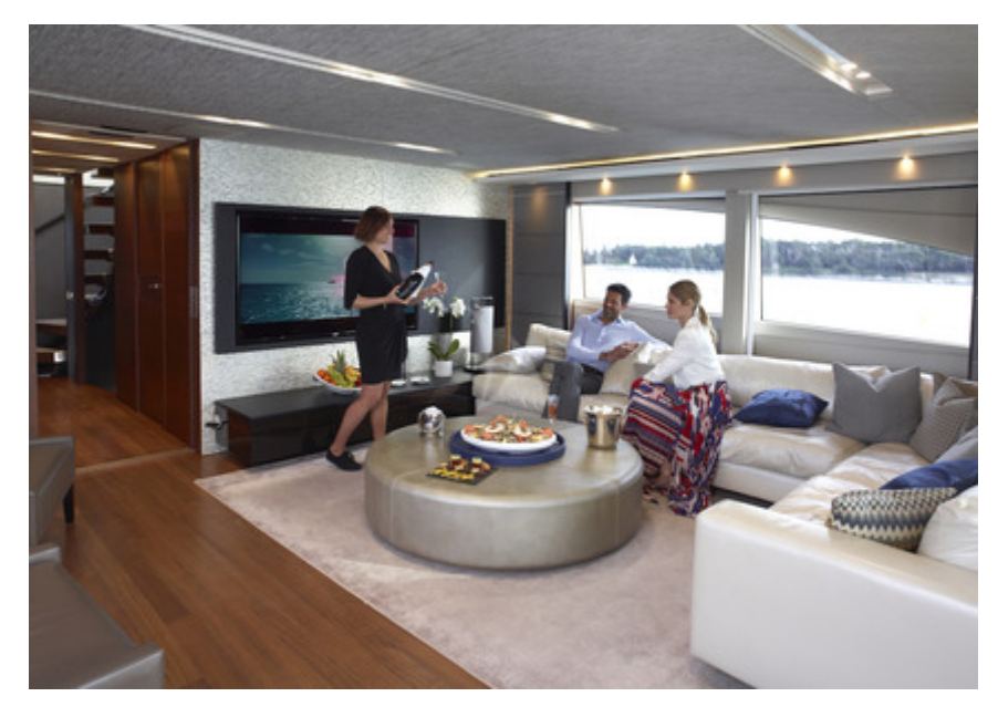
Upper Deck Salon