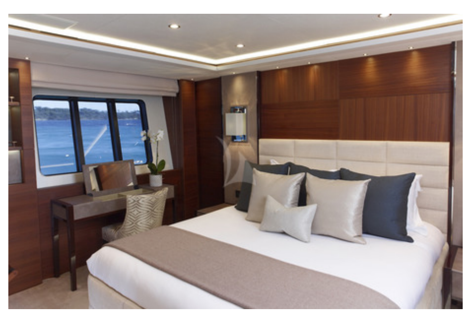
Double Guest Cabin