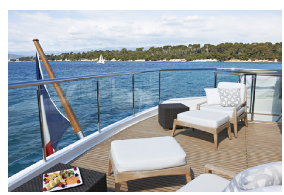
Upper Deck Seating