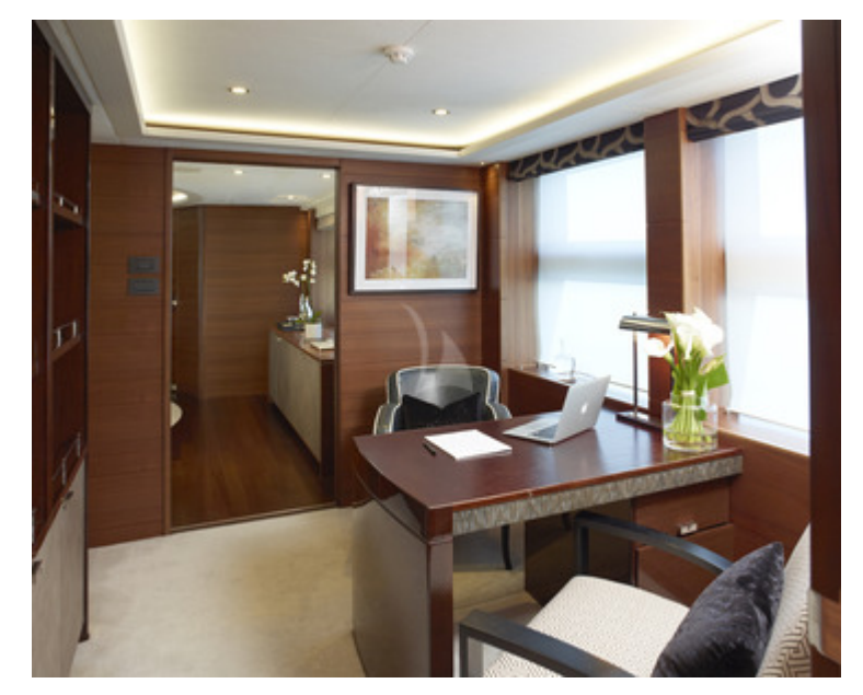
Master Cabin Office