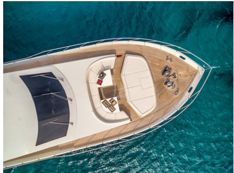
Born aerial view