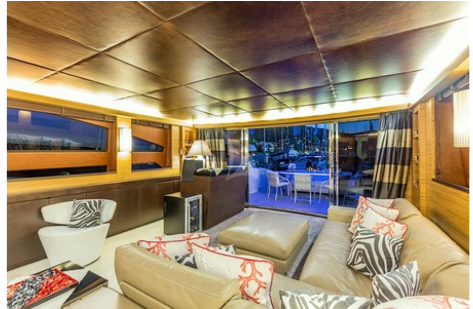
Salon and sofa