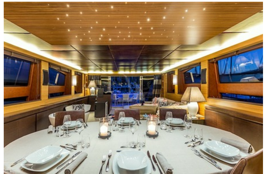
Indoor dining area