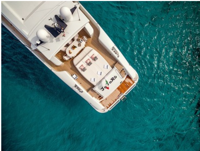
Stern aerial view