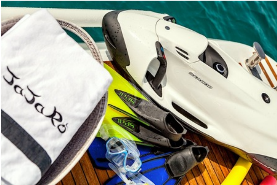
Some water toys