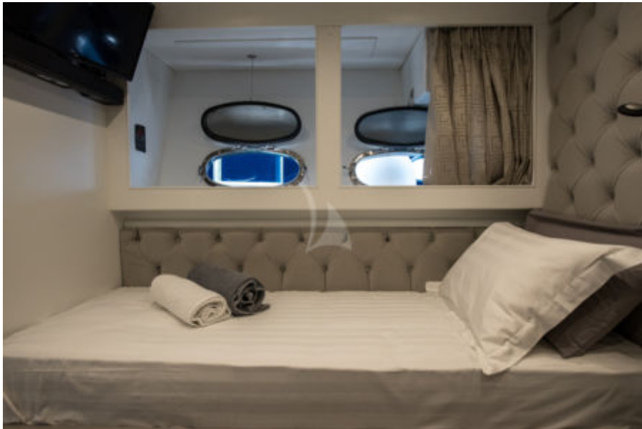
Twin Cabin 1