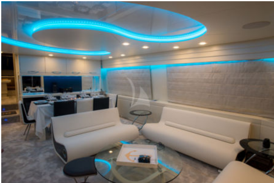
Salon & Dining Area