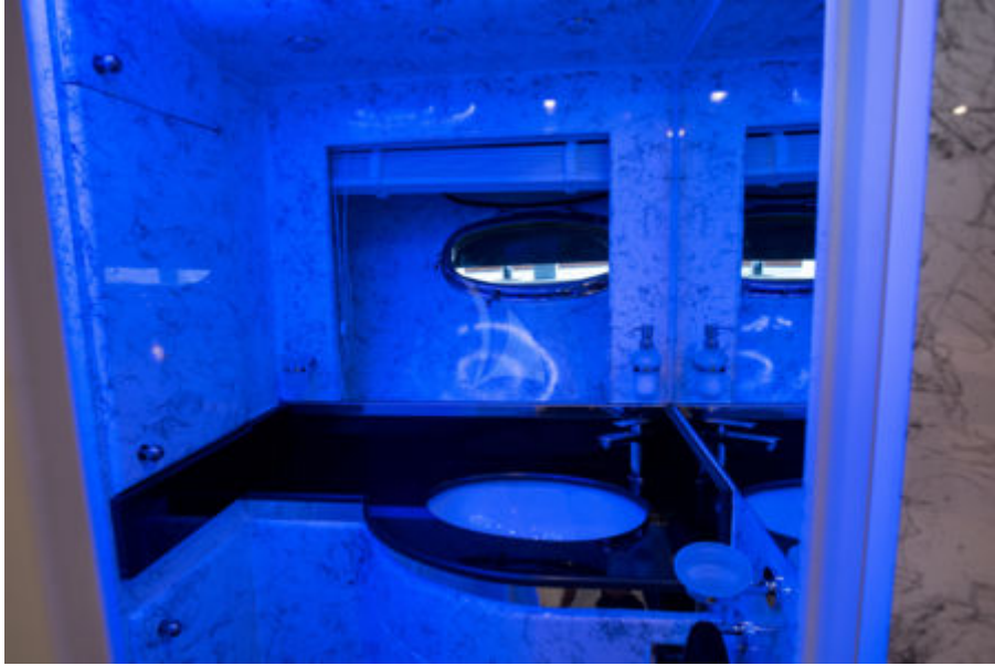
En Suite Facilities (VIP Cabin)