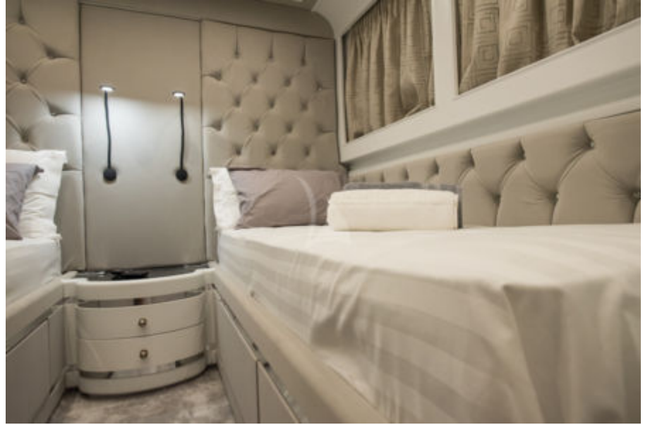
Twin Cabin 2