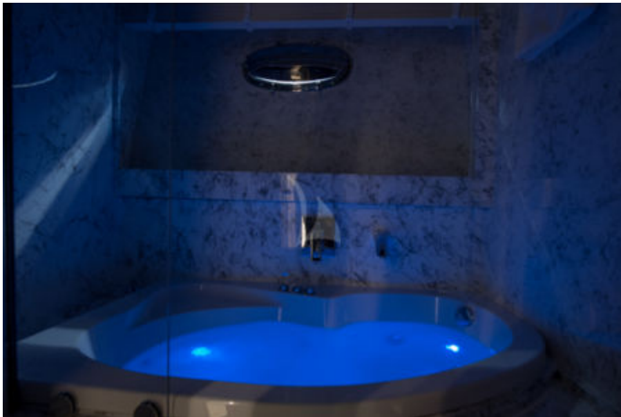
En Suite Facilities (Master Cabin)