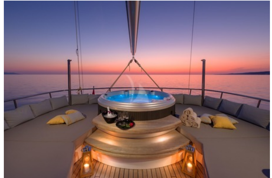
MS Lady Gita - sun deck, Jacuzzi