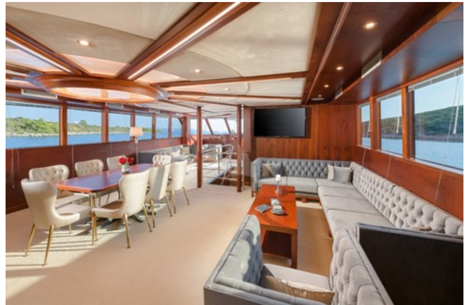
MS Lady Gita - salon