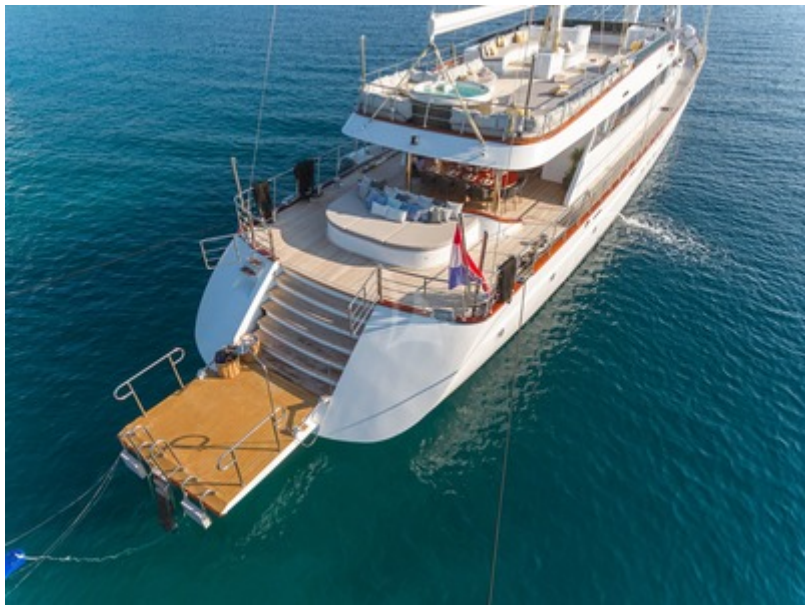
MS Lady Gita, sun deck, main deck, aft area