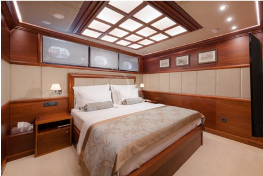
MS Lady Gita - double bed cabin No 2 and 3