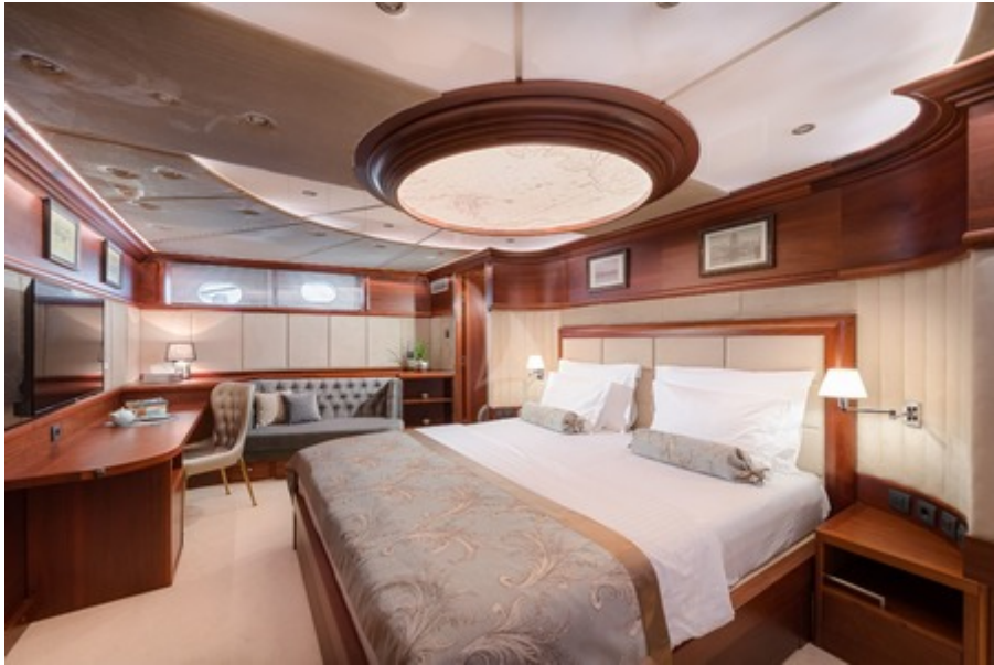
MS Lady Gita - Bow Master cabin