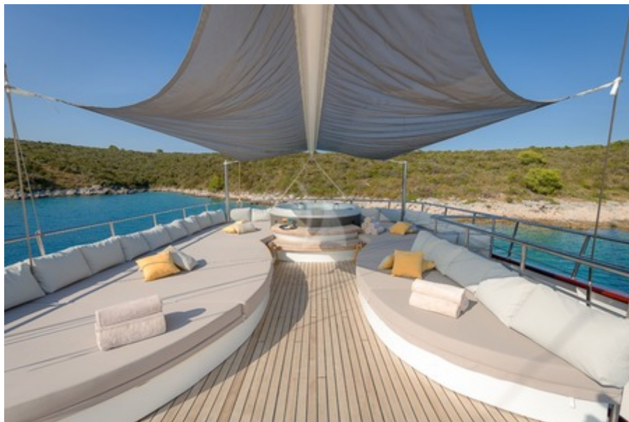
MS Lady Gita - sun deck