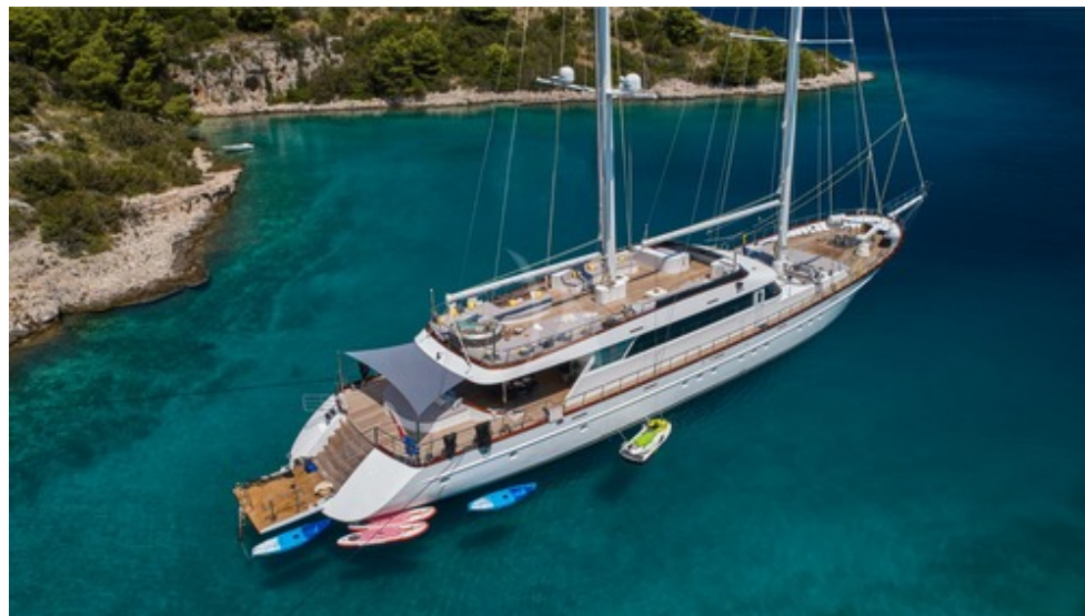
MS Lady Gita