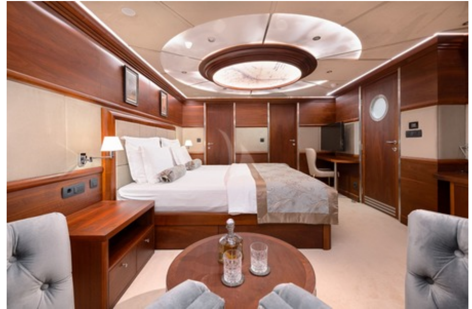
MS Lady Gita - Aft Master cabin