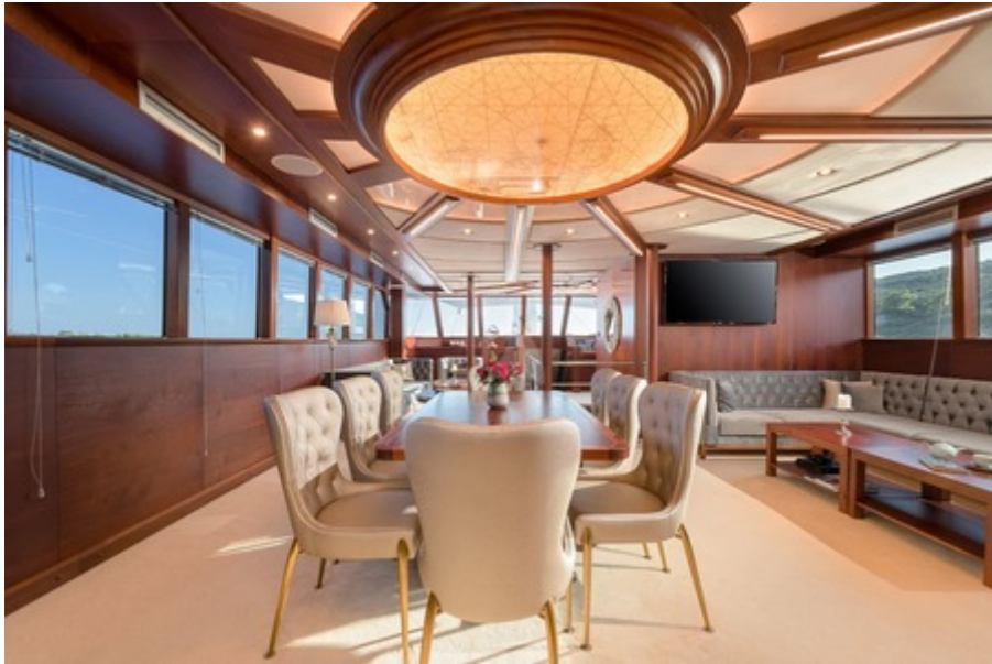
MS Lady Gita - salon