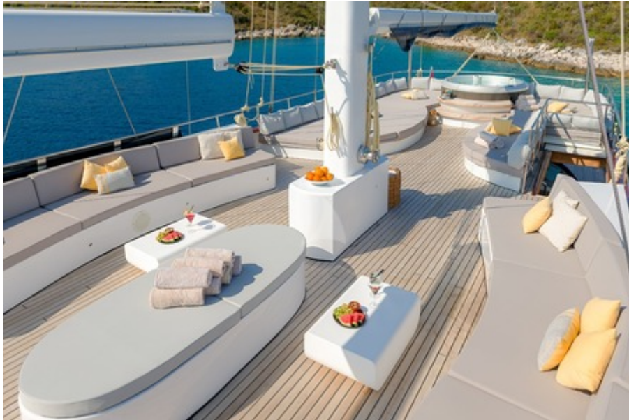
MS Lady Gita, sun deck