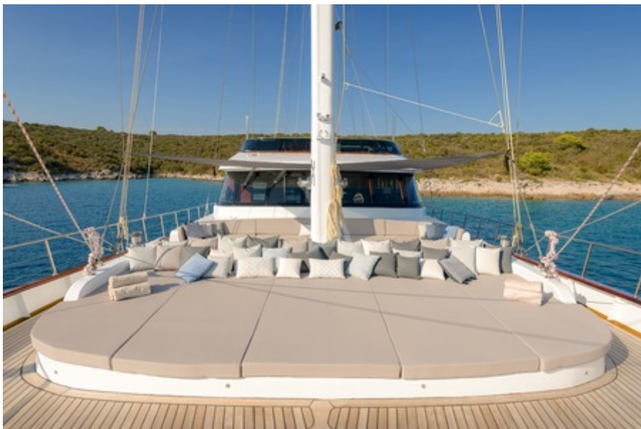
MS Lady Gita - main deck, bow lounge