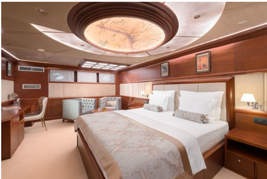
MS Lady Gita - Aft Master cabin