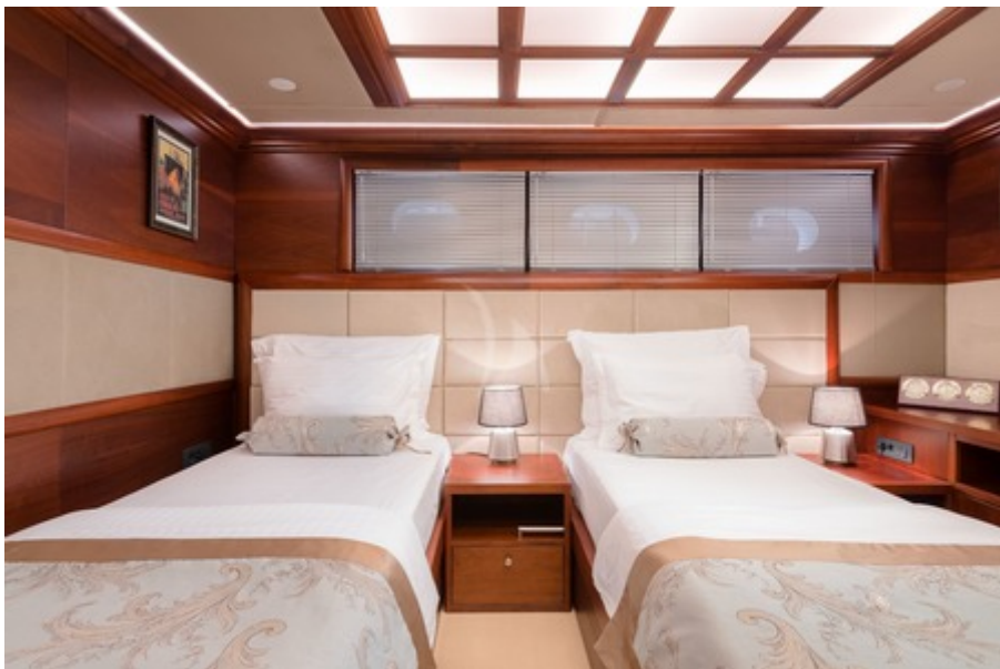
MS Lady Gita - convertible bed cabin No 4 and 5