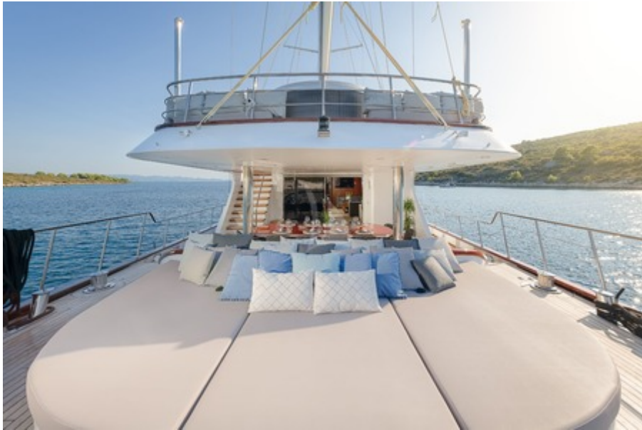
MS Lady Gita - aft lounge