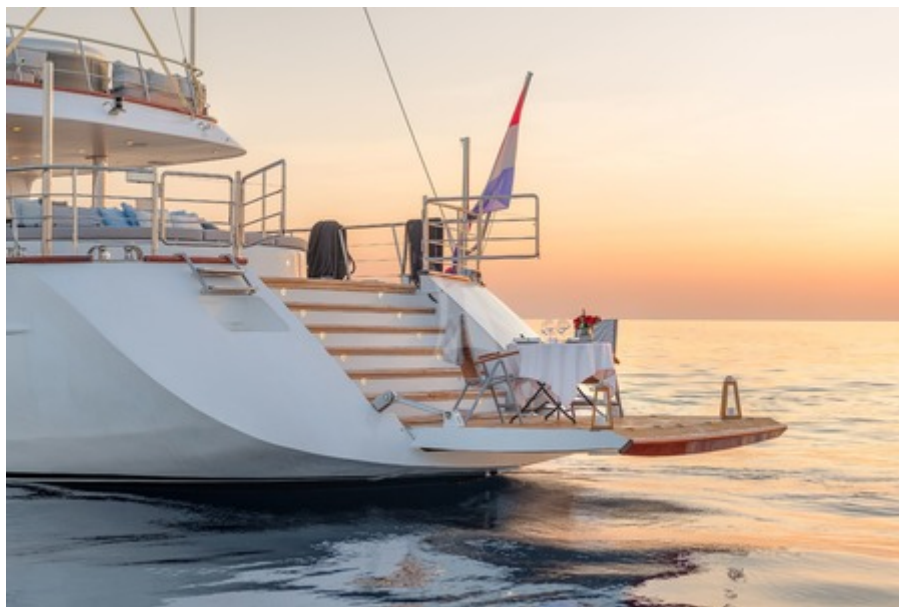
MS Lady Gita - platform