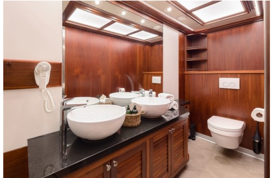
MS Lady Gita - cabin No 2,3,4,5 bathroom