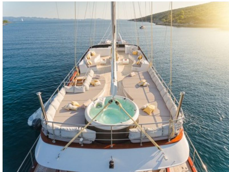
MS Lady Gita, sun deck