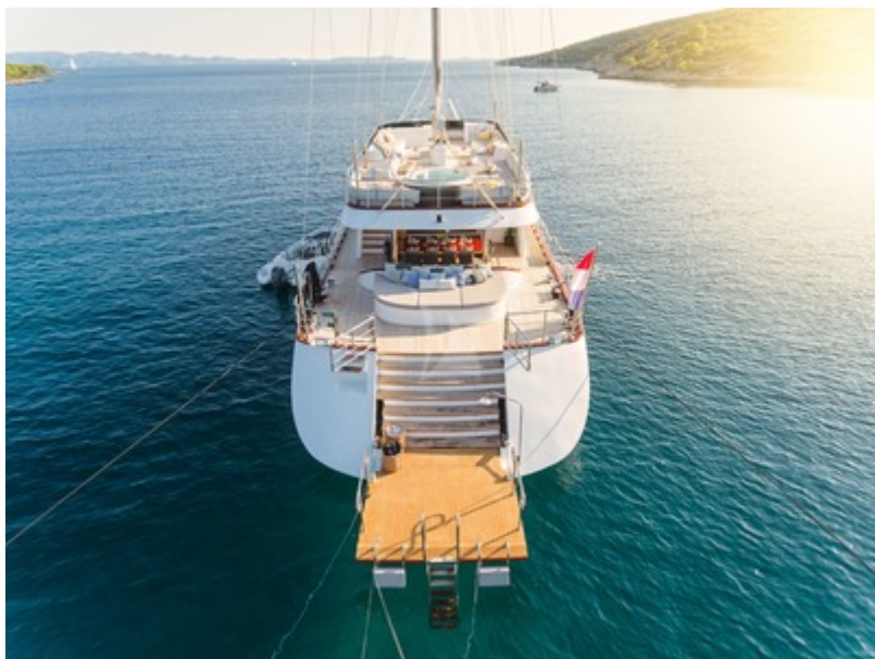
MS Lady Gita, sun deck, main deck, aft area