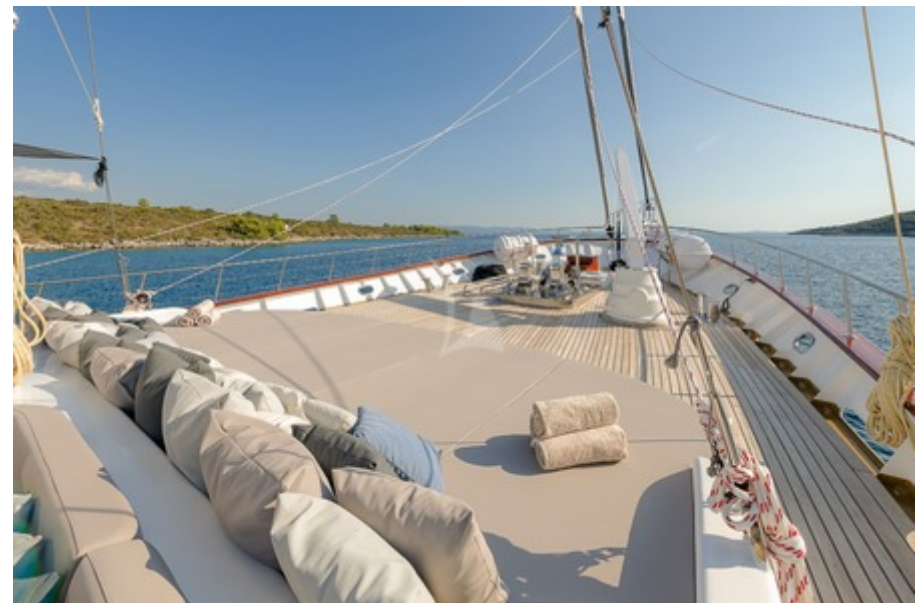
MS Lady Gita - main deck, bow area