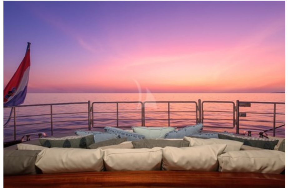
MS Lady Gita - aft lounge