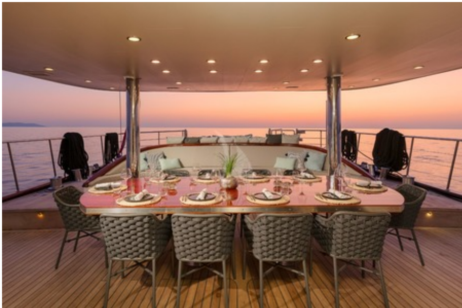
MS Lady Gita - aft dining