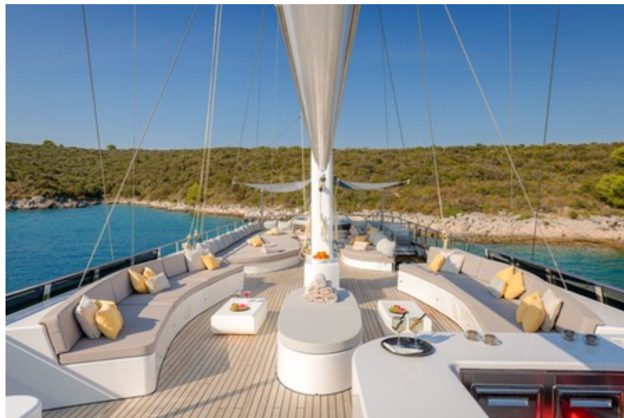
MS Lady Gita, sun deck