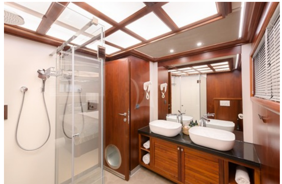
MS Lady Gita - Aft Master cabin bathroom