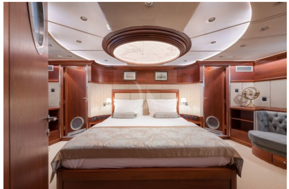
MS Lady Gita - Bow Master cabin