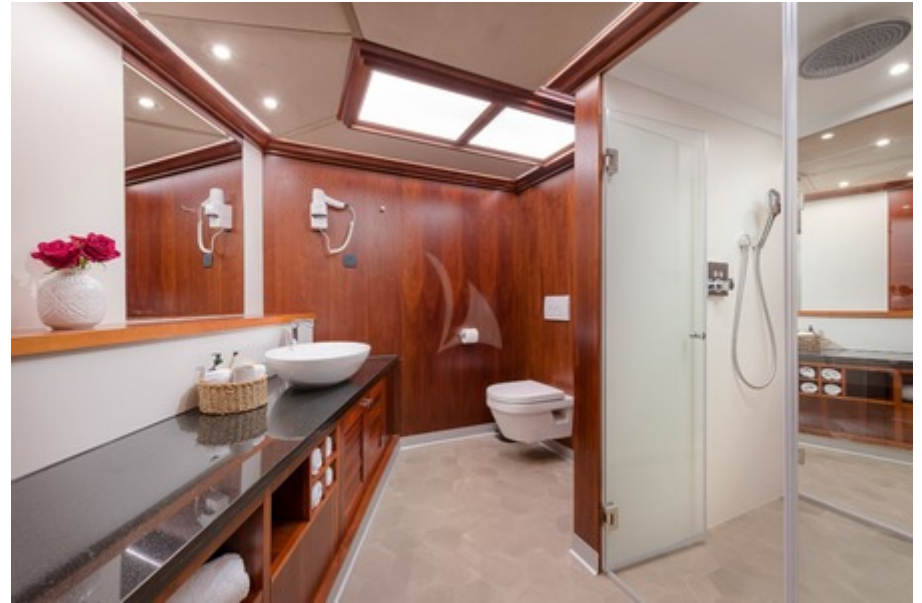
MS Lady Gita - LG Bow Master cabin bathroom