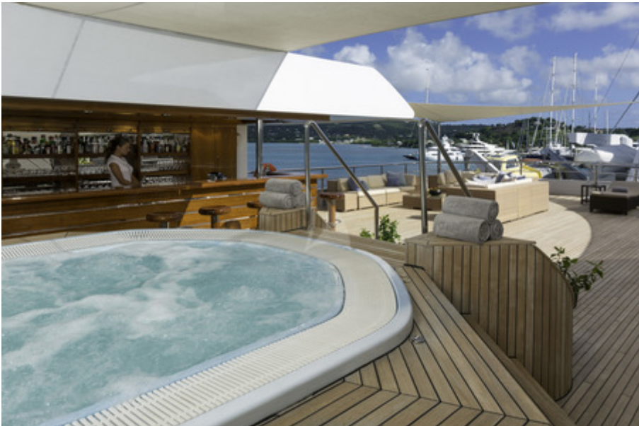
Sundeck Jacuzzi and bar