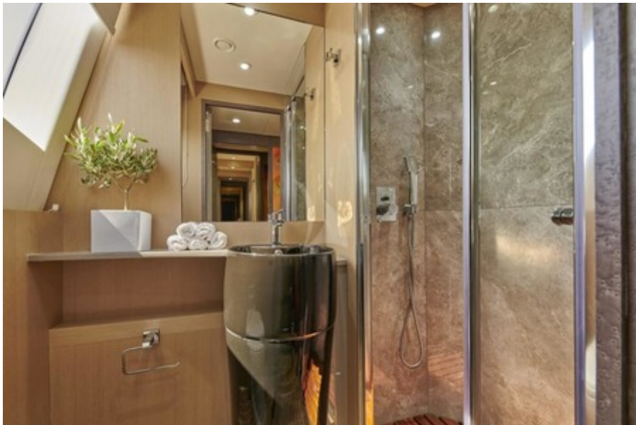
En Suite Facilities