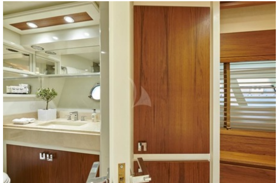
En Suite Facilities