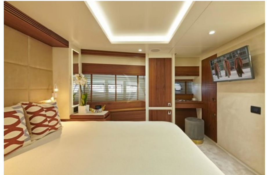
VIP Cabin 1