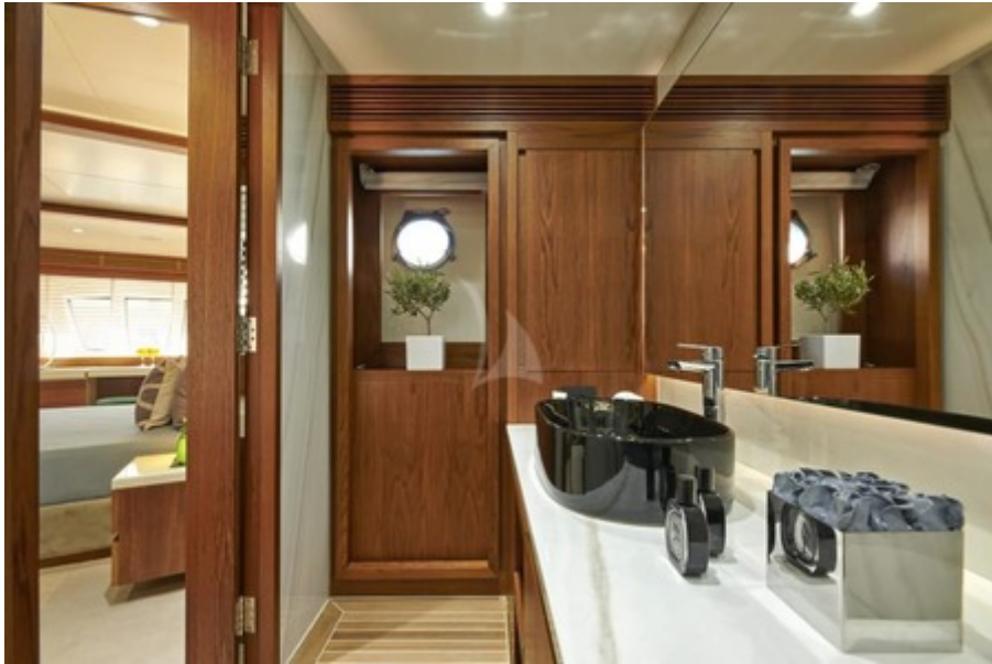
En Suite Facilities