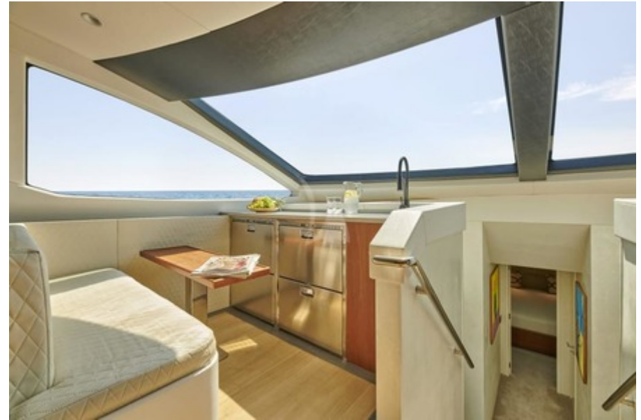
Wheelhouse Sitting Area