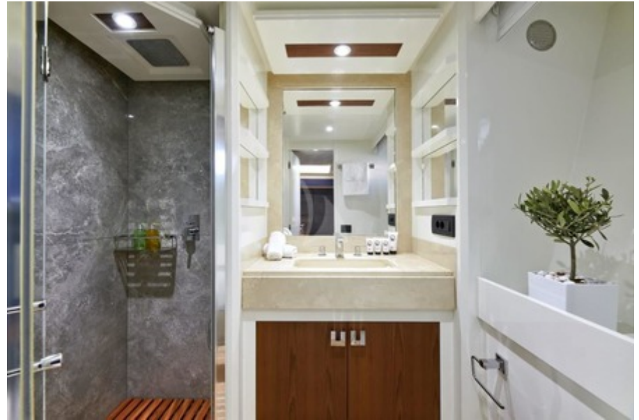
En Suite Facilities