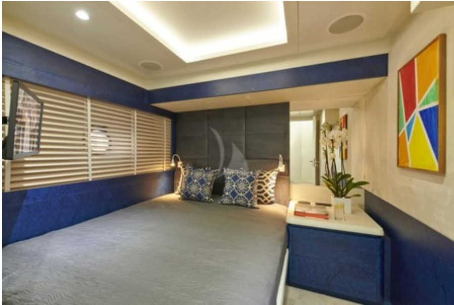
VIP Cabin 2