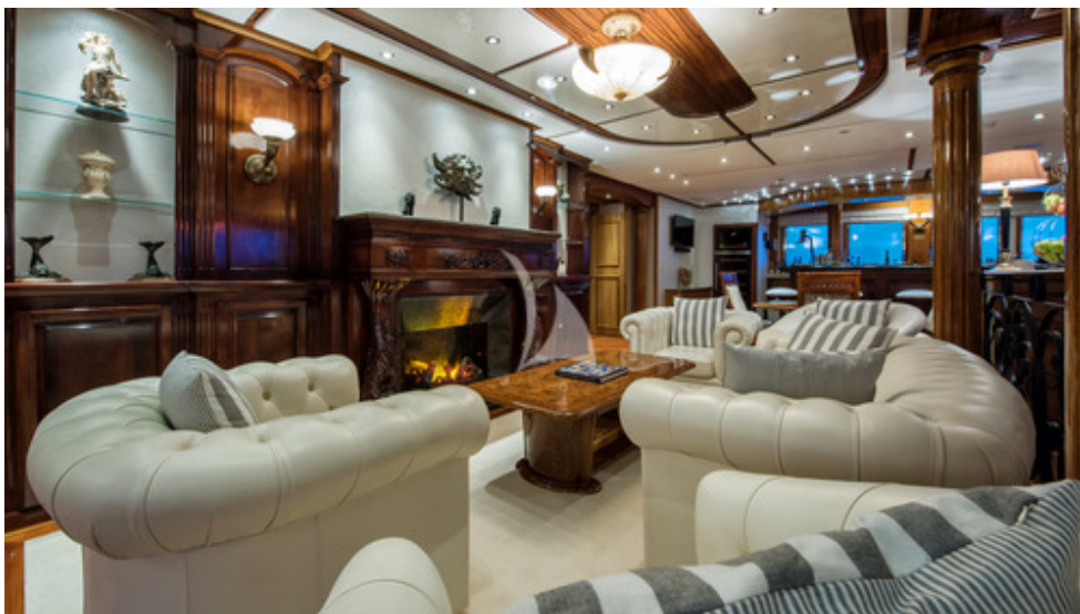
Main deck salon and dining - lounge