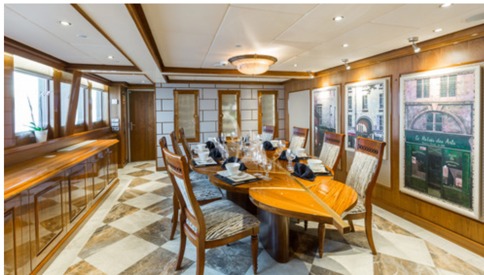
Main deck small dining / buffet room