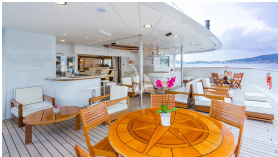
Upper aft deck bar and BBQ