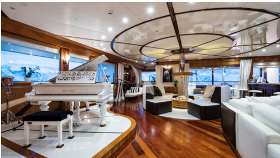
Upper deck salon with piano