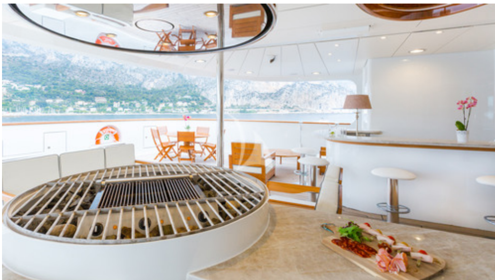
Upper deck aft BBQ and bar