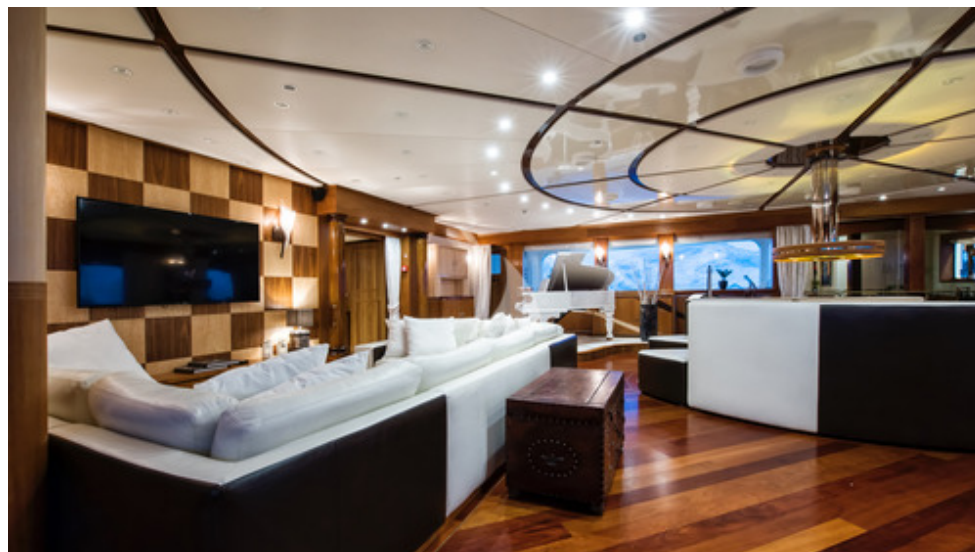
Upper deck bar and salon