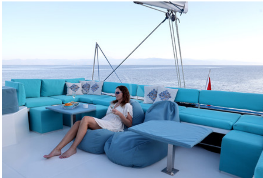
Fly bridge area