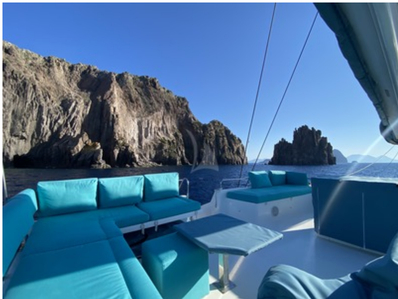
Fly bridge area