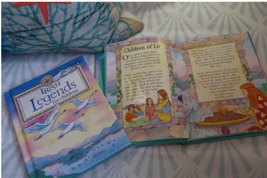
Lir fairy tale