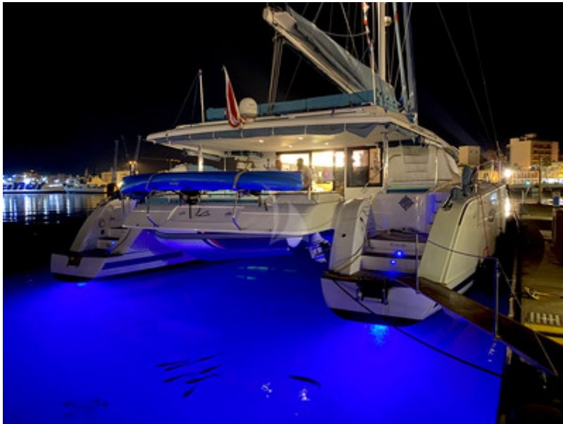
Lir with underwater lights