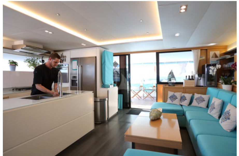
Main saloon and galley area