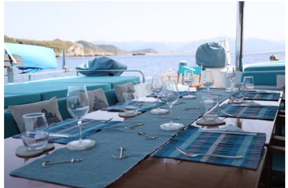
Lunch table setting