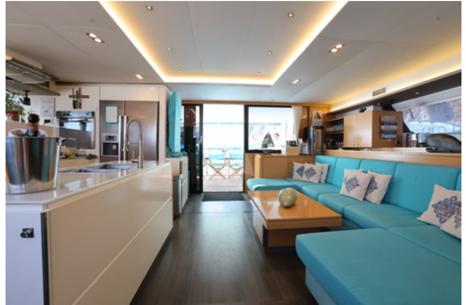
Main saloon and galley area