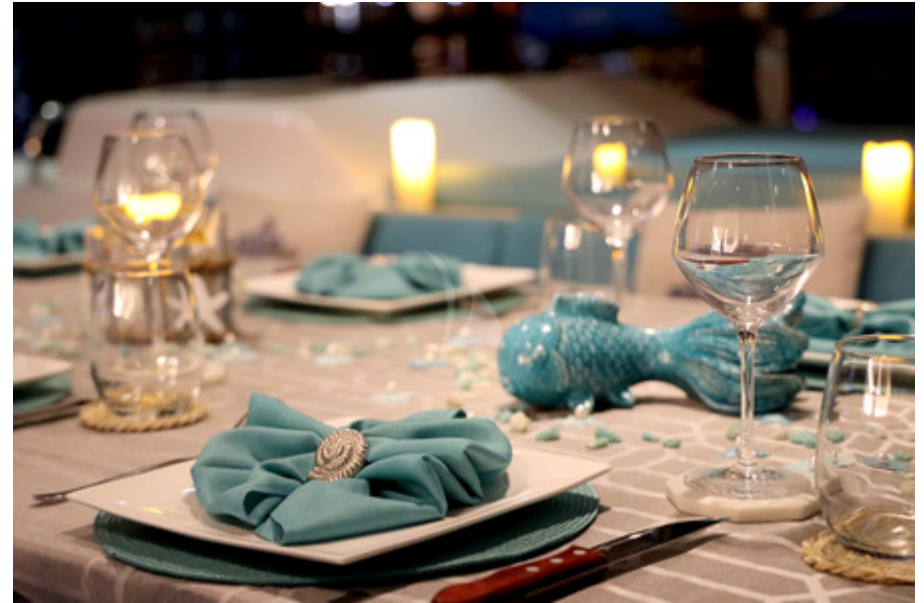
Evening table setting