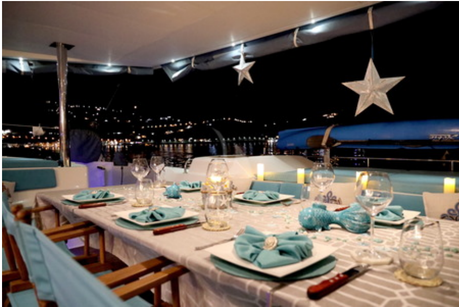
Evening table setting