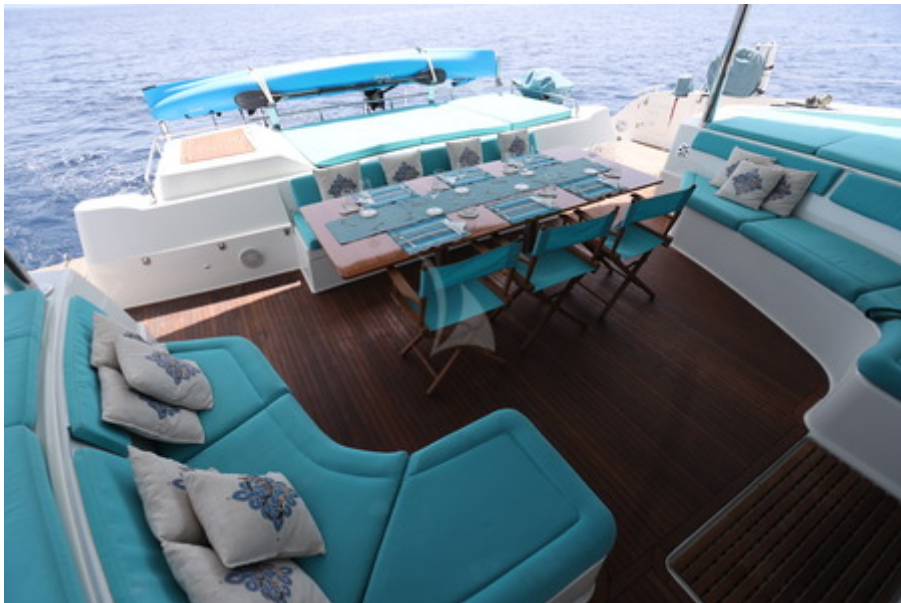
Aft dining area