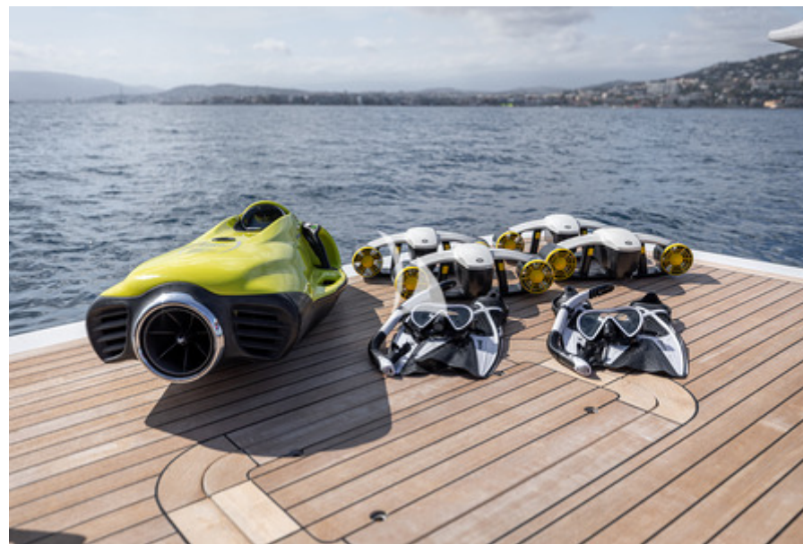
MY LUISA - SEABOB & SUBLUE