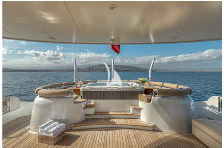
MY LUISA - AFT MAIN DECK JACUZZI