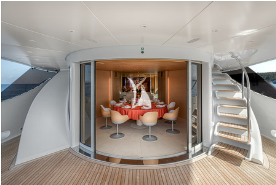
MY LUISA - AFT MAIN DECK