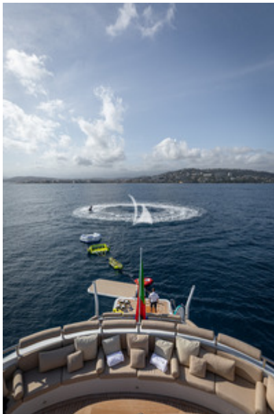
MY LUISA - STERN AT ANCHOR