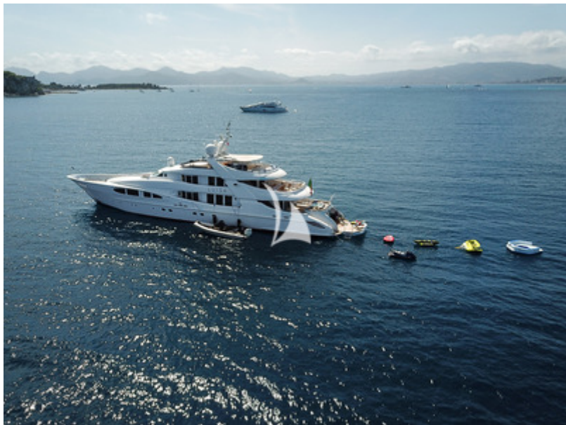
MY LUISA - AT ANCHOR WITH TOYS