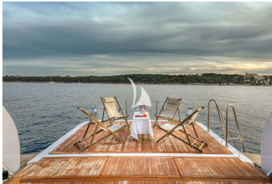
MY LUISA - SUNSET BEACH CLUB