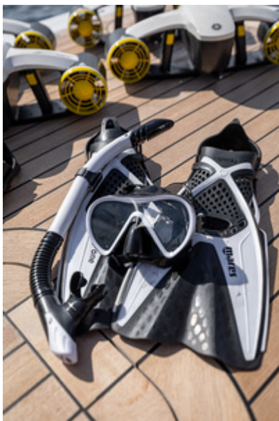
MY LUISA - SNORKELLING GEAR