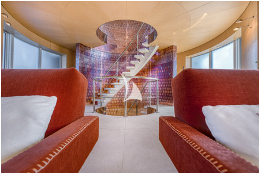
MY LUISA - DETAILS