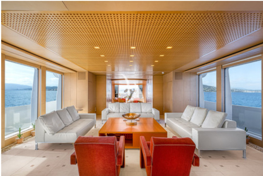
MY LUISA - MAIN DECK SALOON