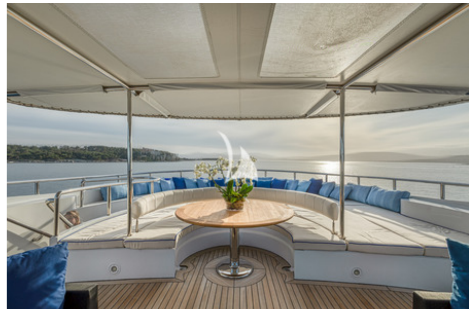
MY LUISA - SUN DECK SUNBATHING AREA