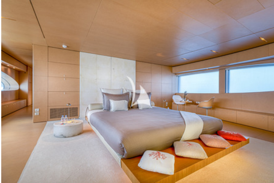
MY LUISA - MASTER CABIN