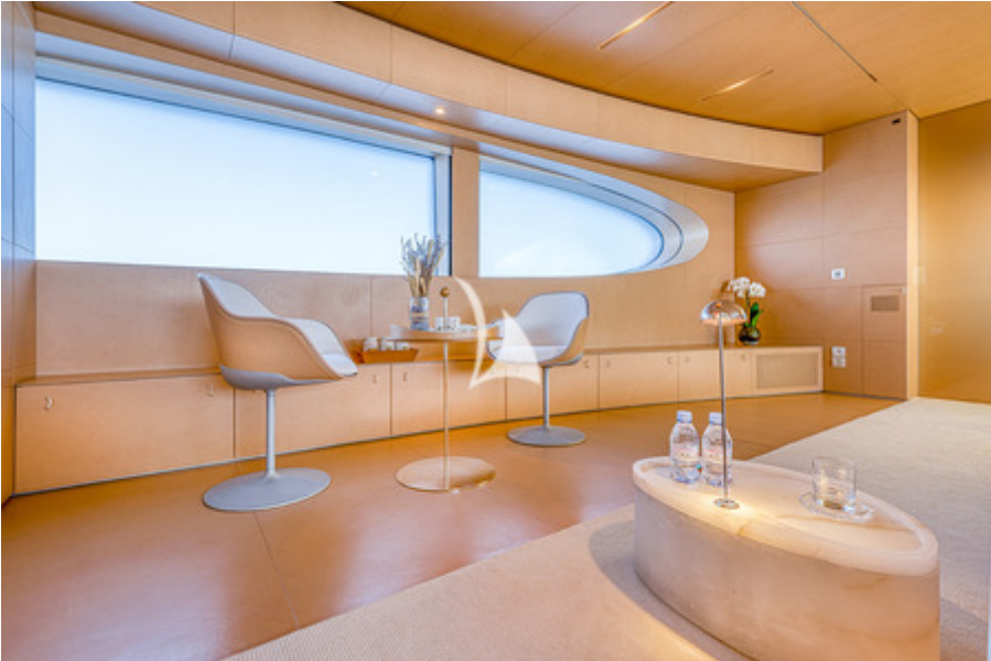
MY LUISA - MASTER CABIN