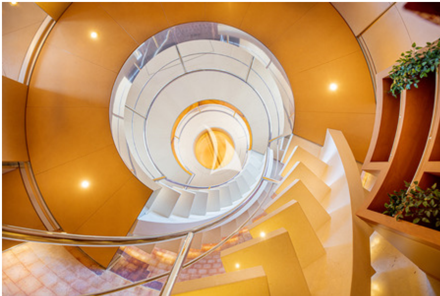
MY LUISA - STAIR CASE