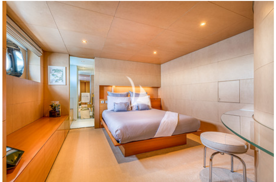
MY LUISA - VIP GUEST CABIN