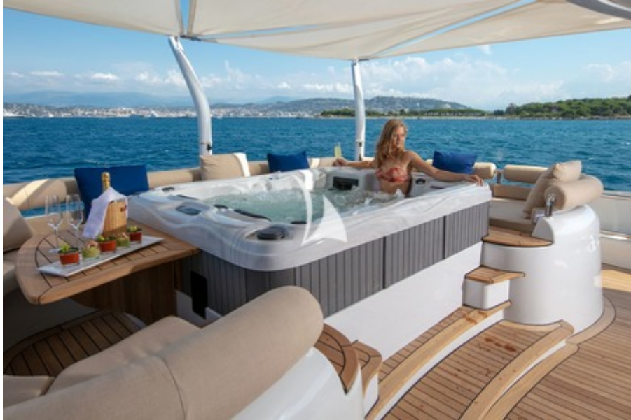
MY LUISA - AFT MAIN DECK JACUZZI