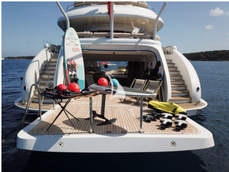
MY LUISA - BEACH CLUB