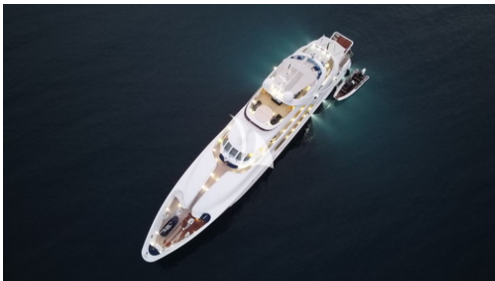
MY LUISA - AT ANCHOR