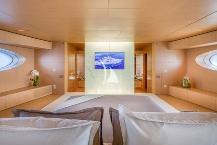
MY LUISA - MASTER CABIN