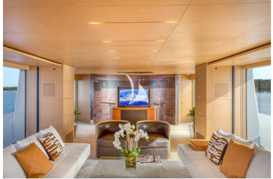
MY LUISA - BRIDGE DECK SALOON