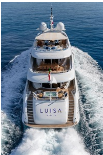
MY LUISA - CRUISING