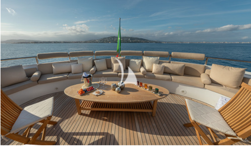
MY LUISA - AFT BRIDGE DECK