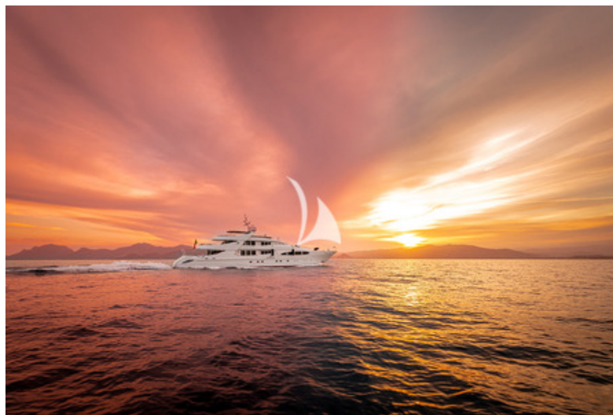
MY LUISA - CRUISING