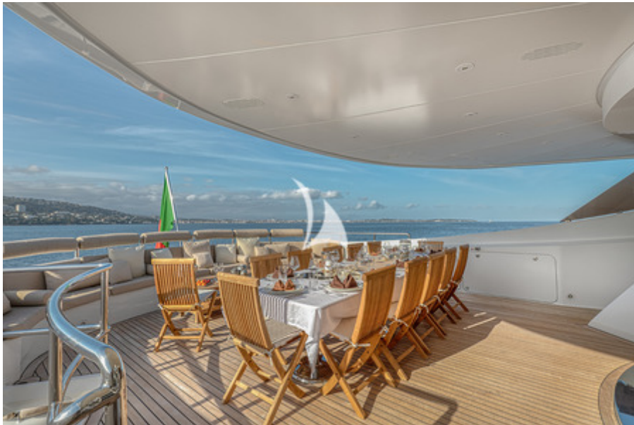
MY LUISA - BRIDGE DECK