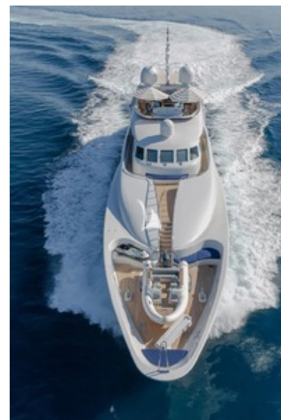
MY LUISA - CRUISING