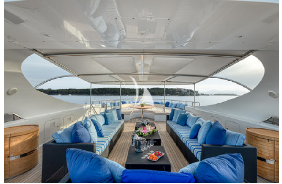
MY LUISA - SUN DECK LOUNGE