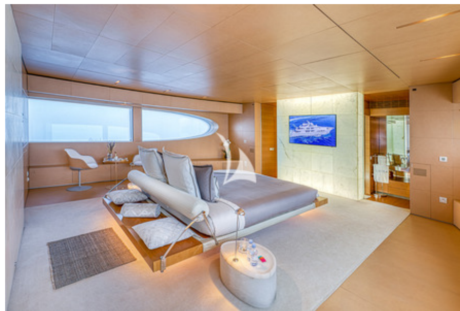
MY LUISA - MASTER CABIN