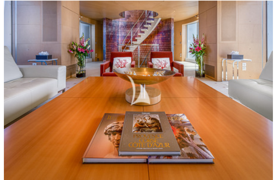
MY LUISA - DETAILS (1)