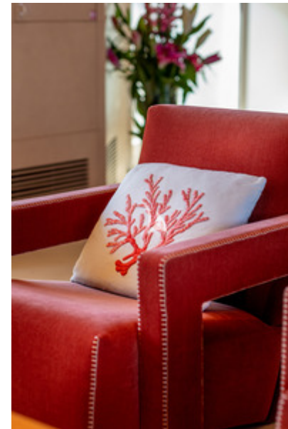
MY LUISA - DETAILS