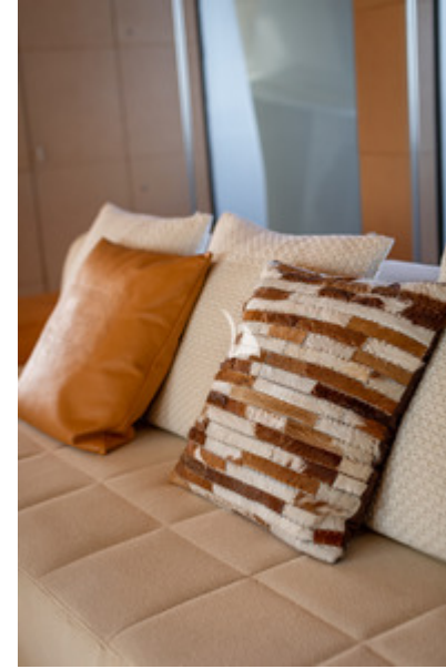
MY LUISA - DETAILS