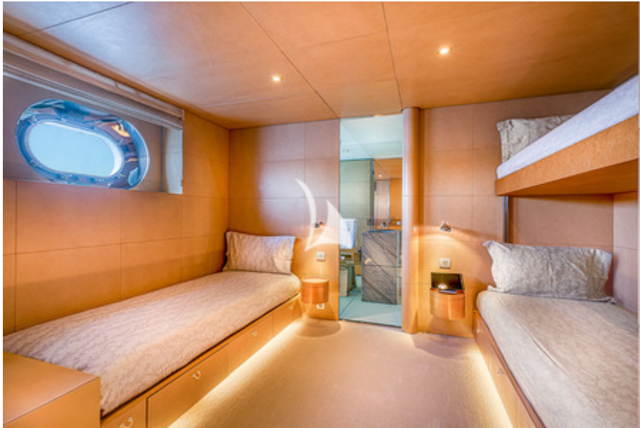
MY LUISA - TWIN CABIN WITH PULLMAN BED