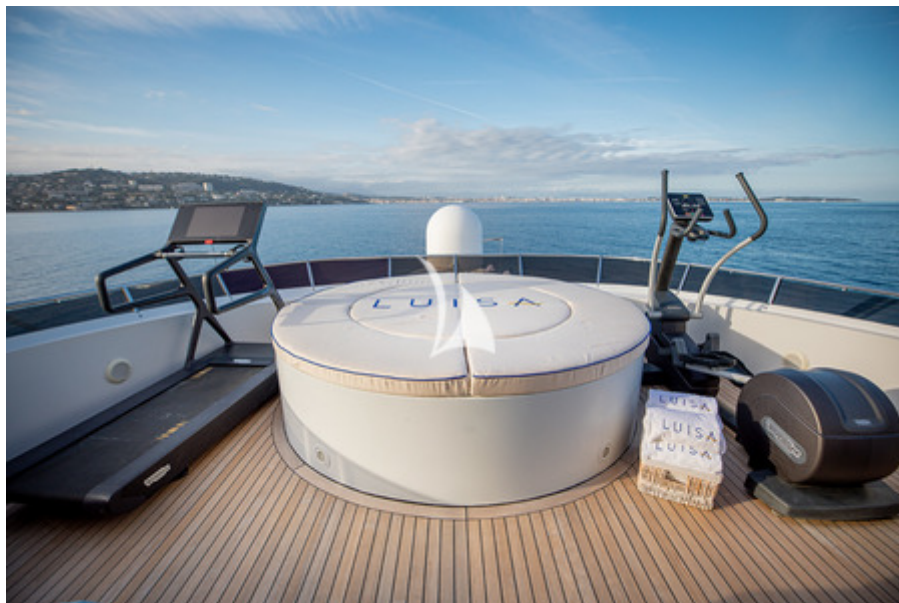
MY LUISA - SUNDECK GYM EQUIPMENT