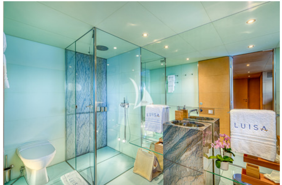
MY LUISA - GUEST BATHROOM