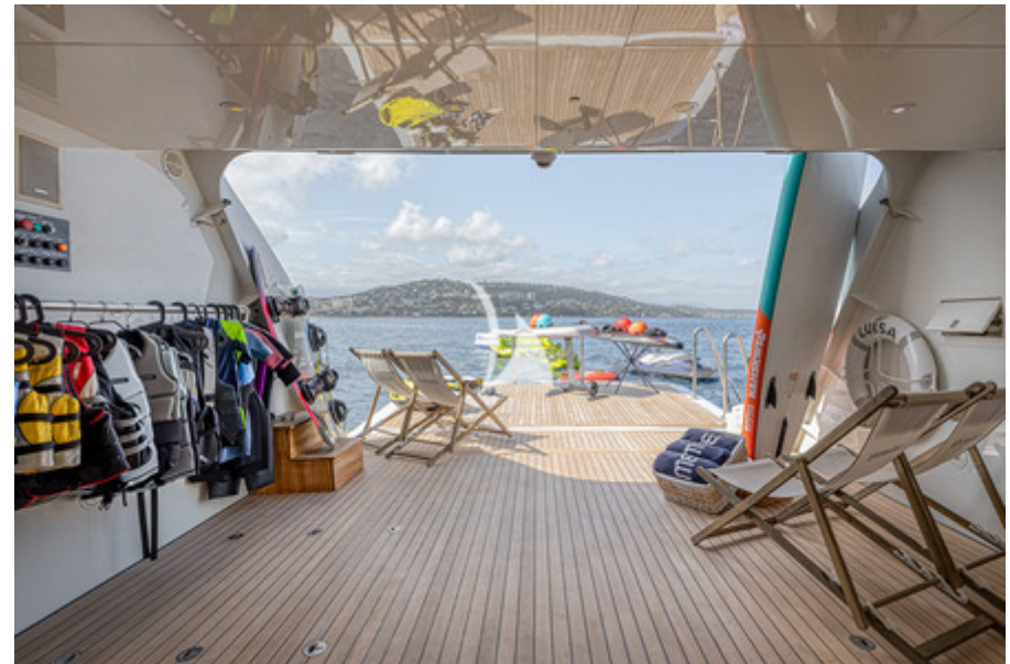
MY LUISA - GARAGE