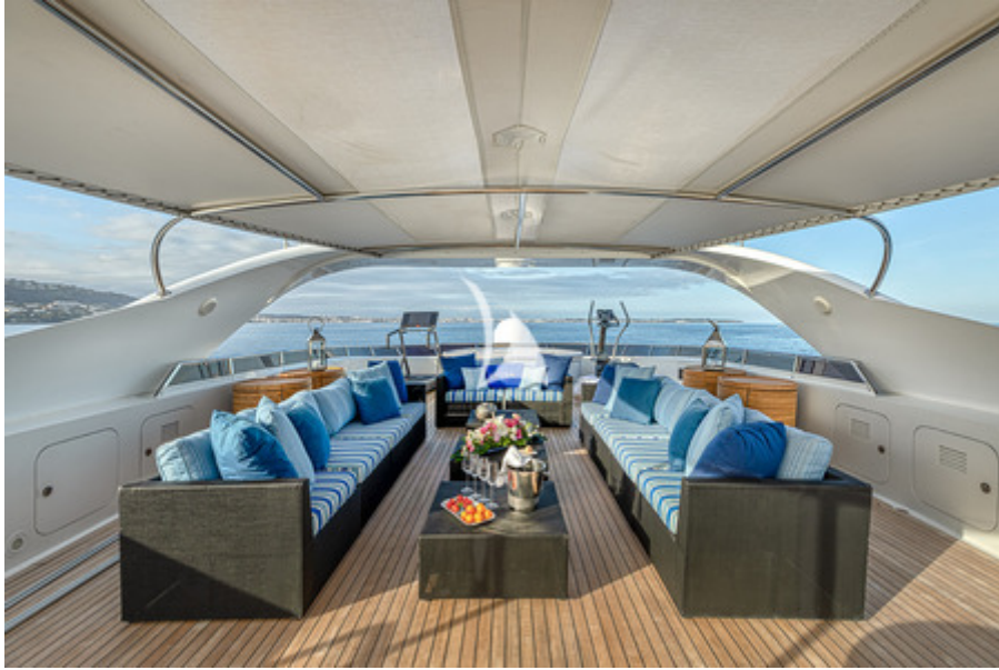
MY LUISA - SUN DECK LOUNGE