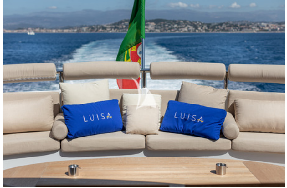
MY LUISA - DETAILS