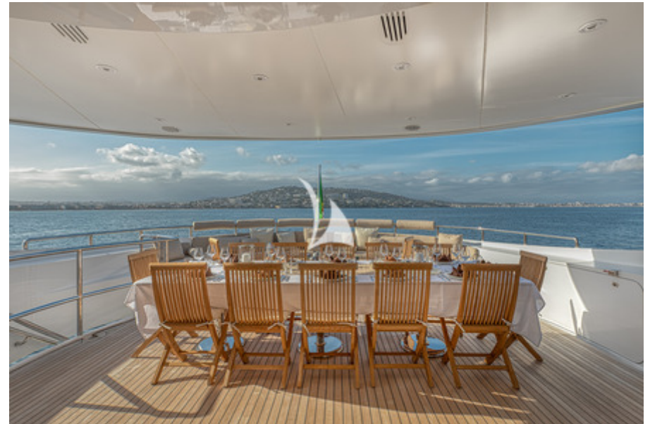
MY LUISA - BRIDGE DECK DINING TABLE