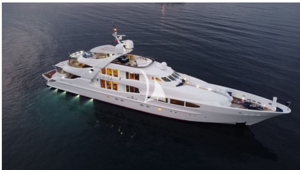
MY LUISA - AT ANCHOR