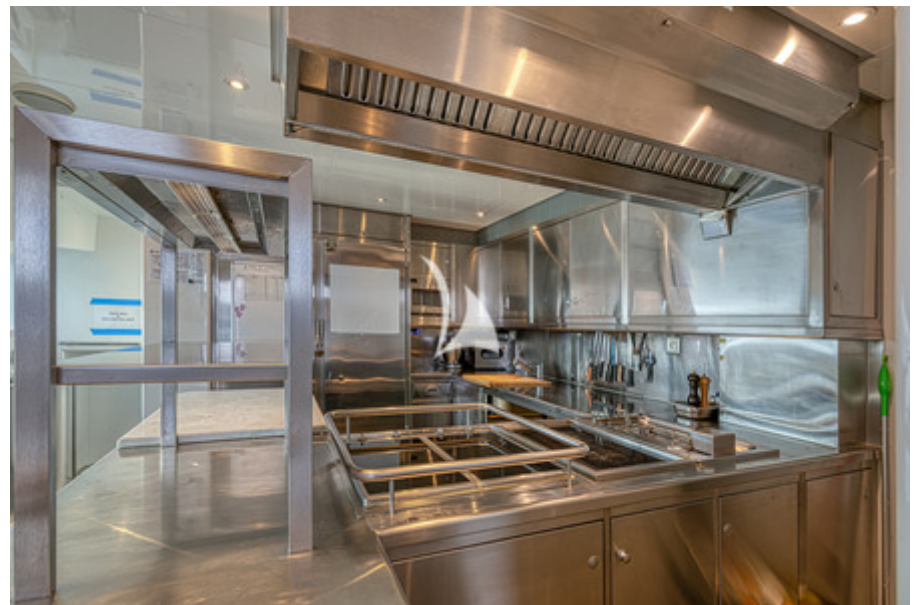
MY LUISA - GALLEY