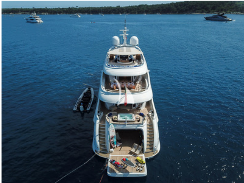
MY LUISA - AT ANCHOR STERN