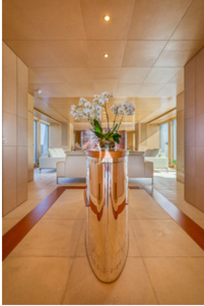
MY LUISA - DETAILS