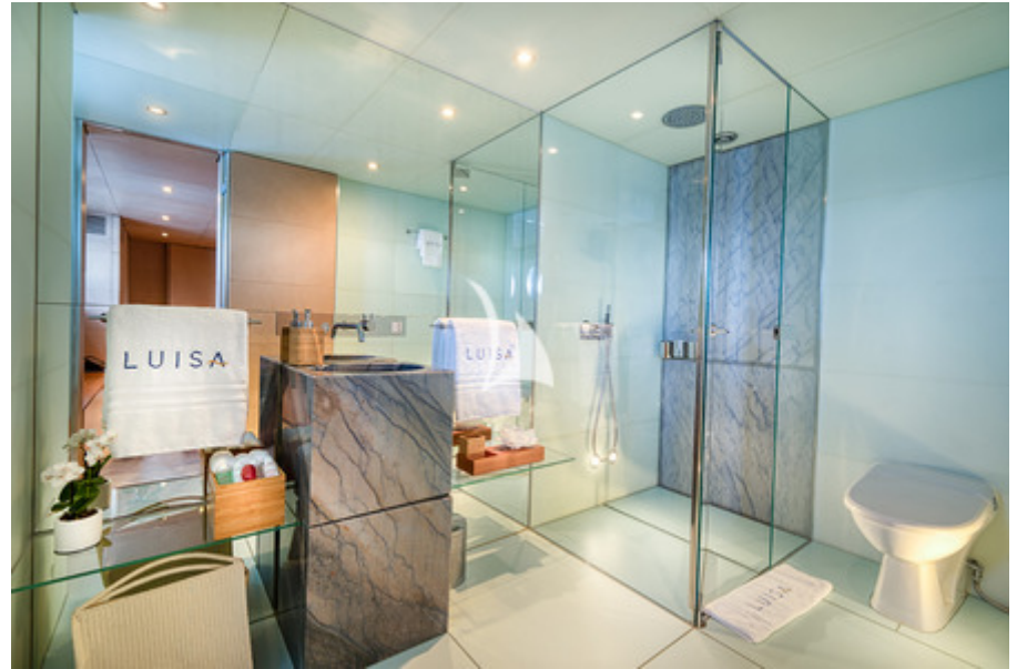
MY LUISA - GUEST BATHROOM