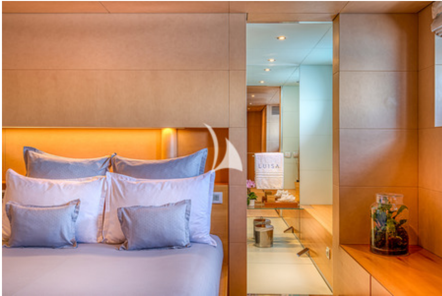
MY LUISA - DETAILS