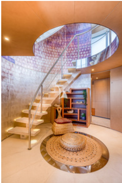
MY LUISA - STAIR CASE