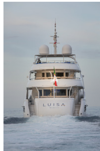
MY LUISA - CRUISING