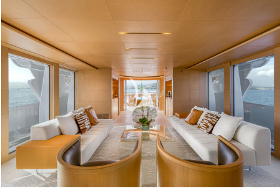
MY LUISA - BRIDGE DECK SALOON