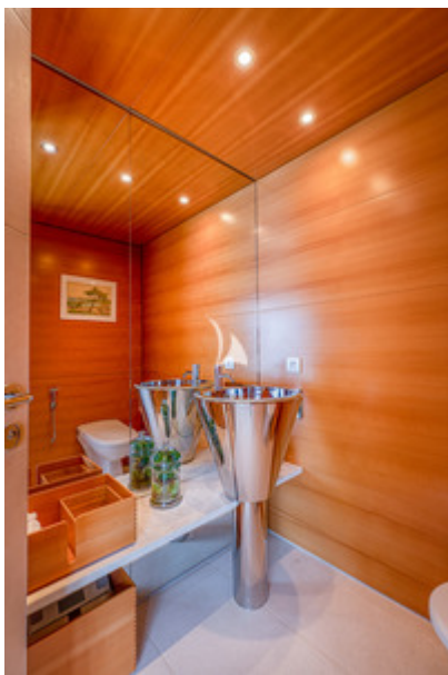
MY LUISA - MAIN DECK DAY HEAD