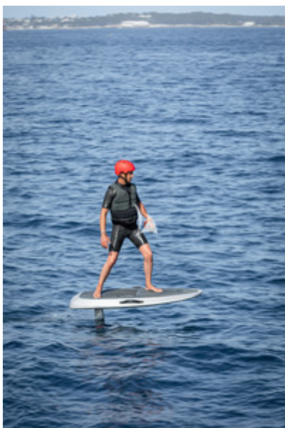
MY LUISA - EFOIL