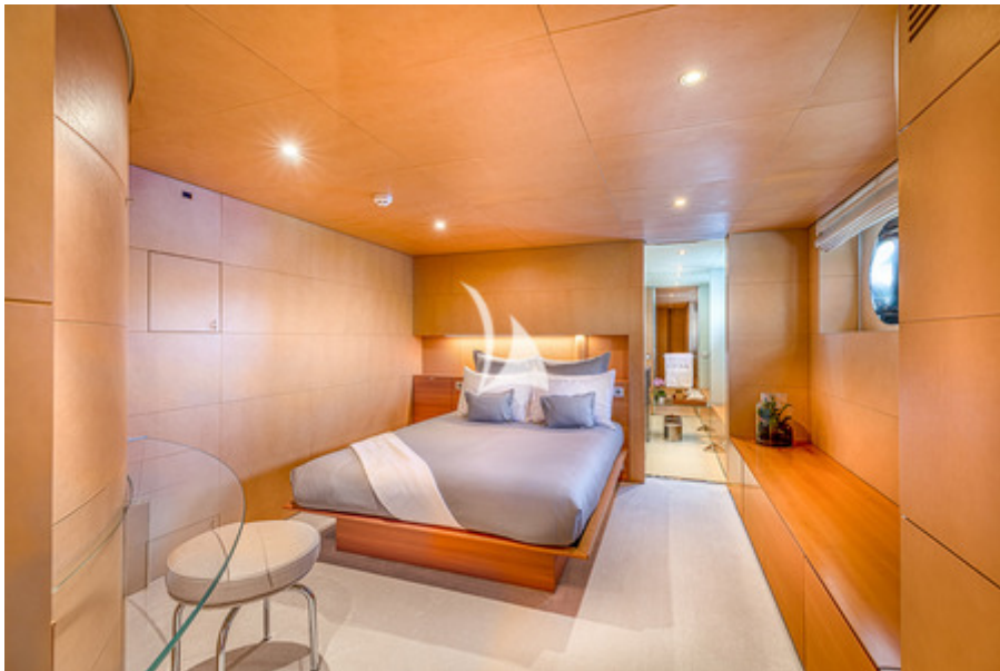
MY LUISA - VIP GUEST CABIN