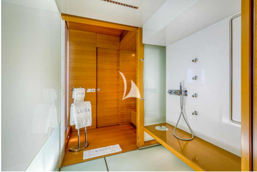
MY LUISA - MASTER BATHROOM