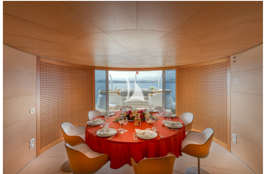
MY LUISA - MAIN DECK DINING AREA