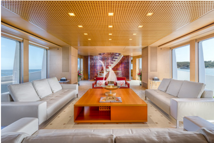
MY LUISA - MAIN DECK SALOON