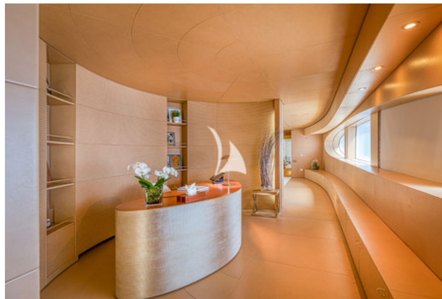
MY LUISA - MASTER CABIN OFFICE