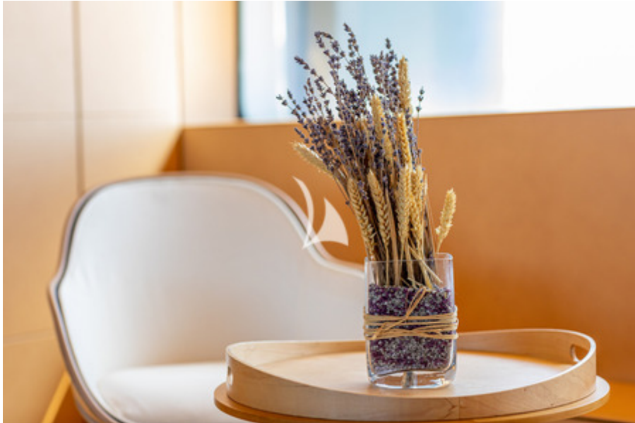
MY LUISA - DETAILS