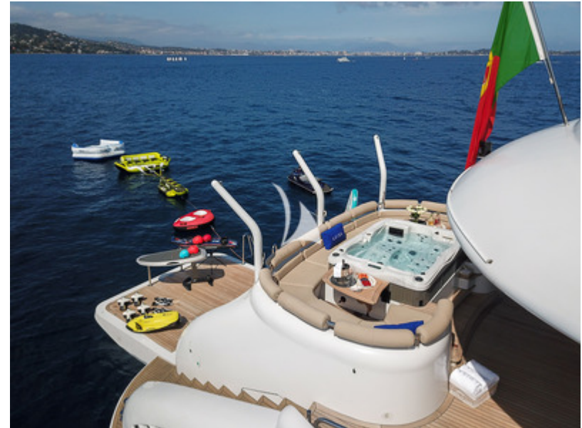
MY LUISA - JACUZZI & TOYS