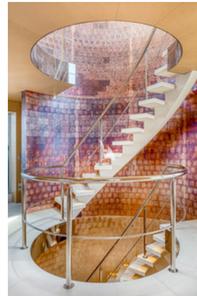
MY LUISA - STAIR CASE