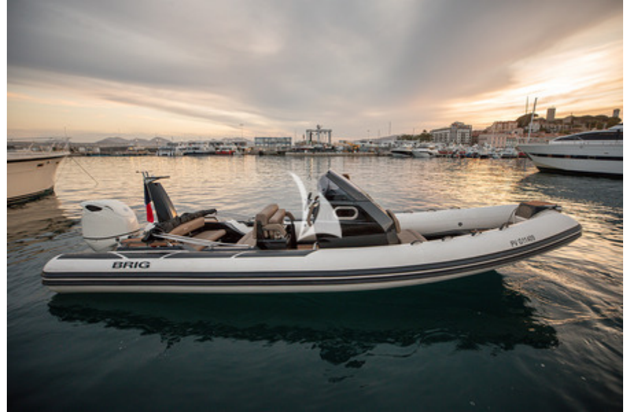
MY LUISA - 8mTENDER