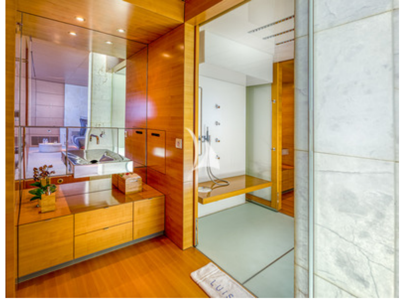
MY LUISA - MASTER BATHROOM