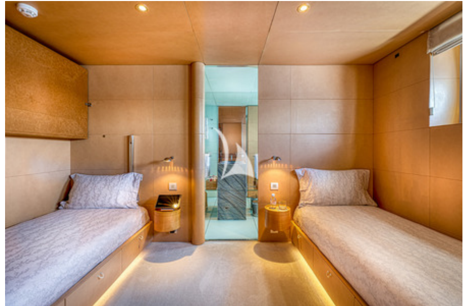
MY LUISA - TWIN CABIN WITH PULLMAN BED