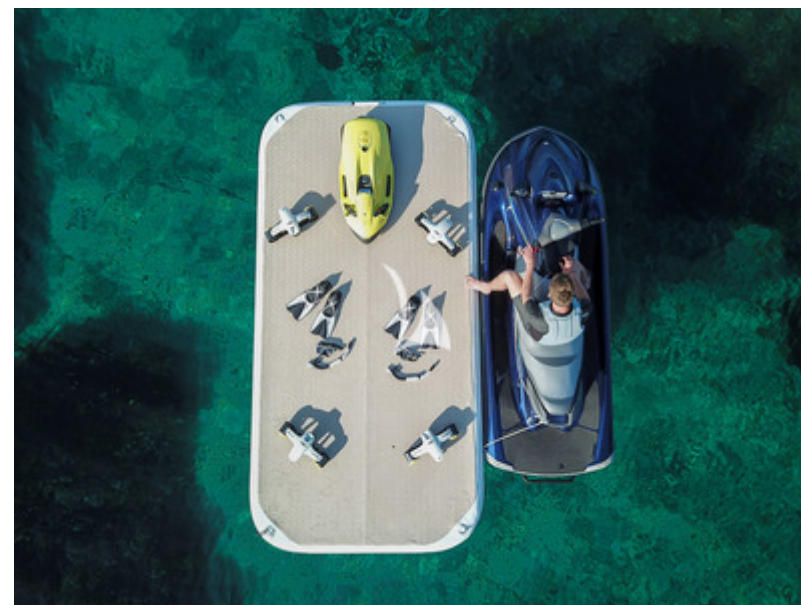
MY LUISA - JET SKI & FLOTTING PLATFORM