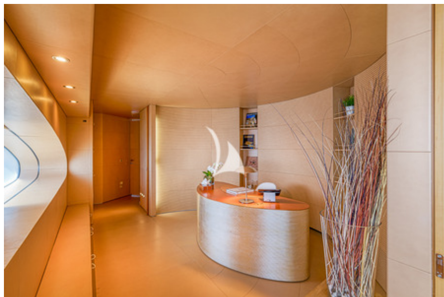
MY LUISA - MASTER CABIN OFFICE