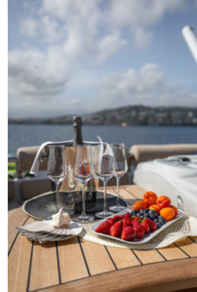
MY LUISA - DETAILS