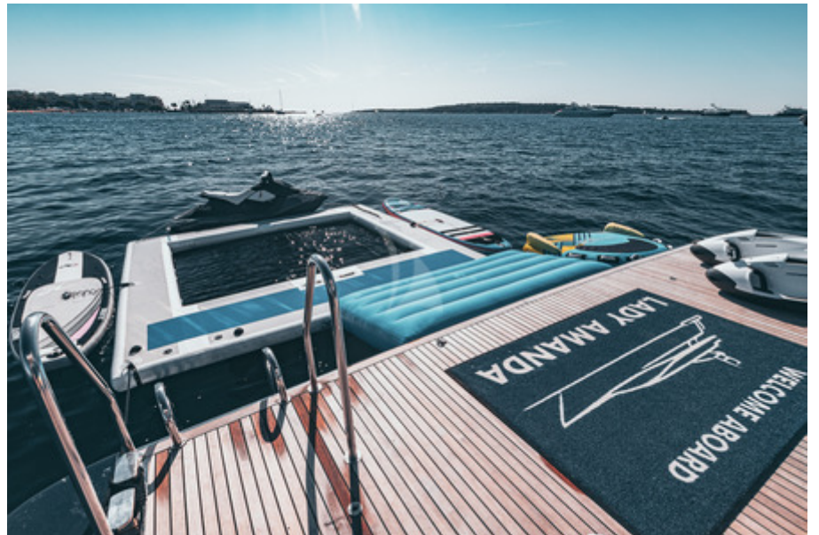
Swimming platform and ocean pool