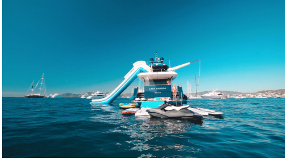
Exterior with toys