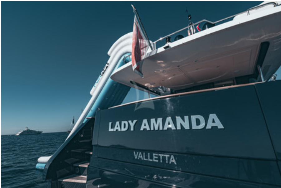
Exterior with slide