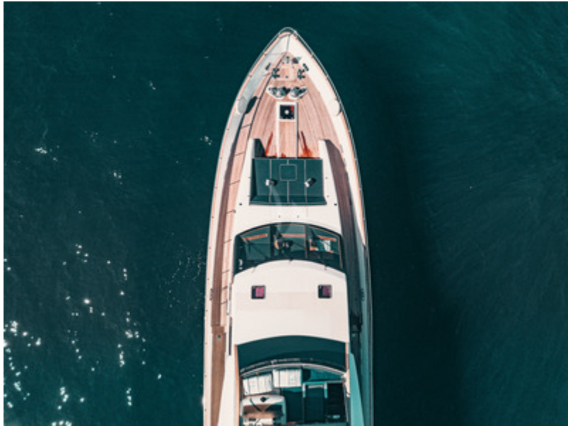
Aerial view of exterior