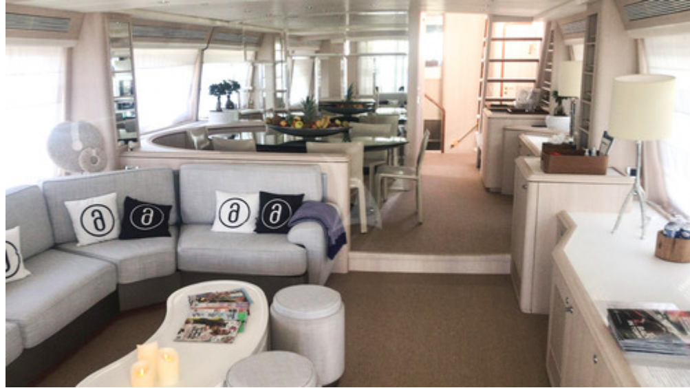
Main saloon & dining area