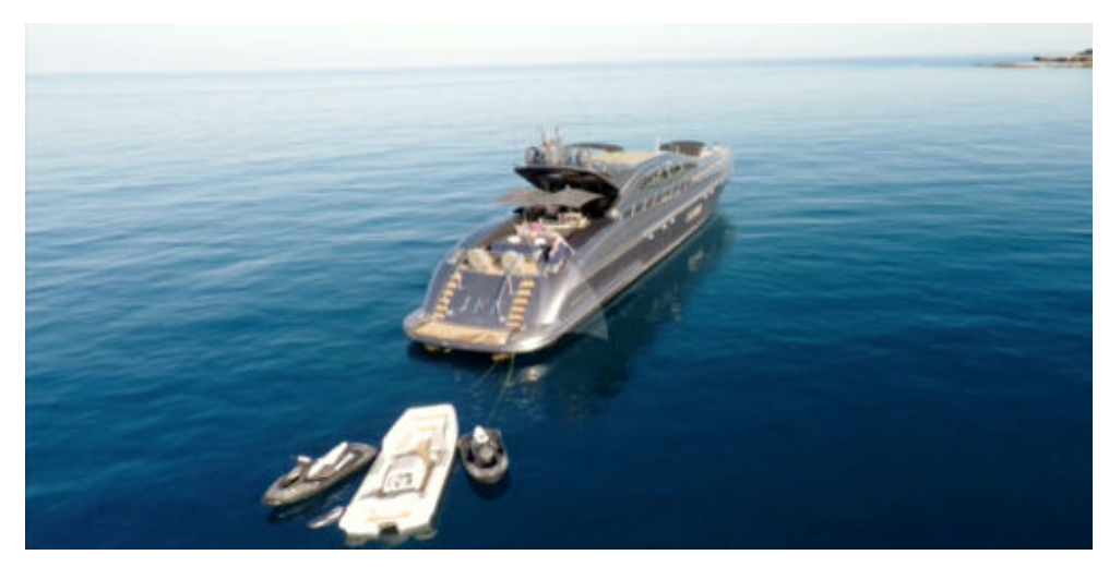
MY JFF VIEW