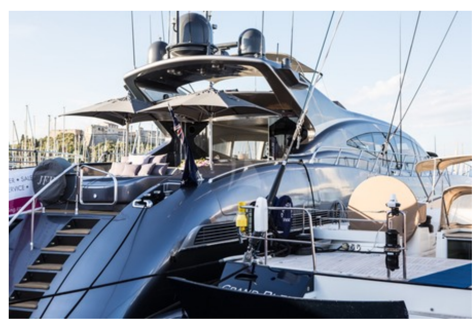
MY JFF AT QUAY