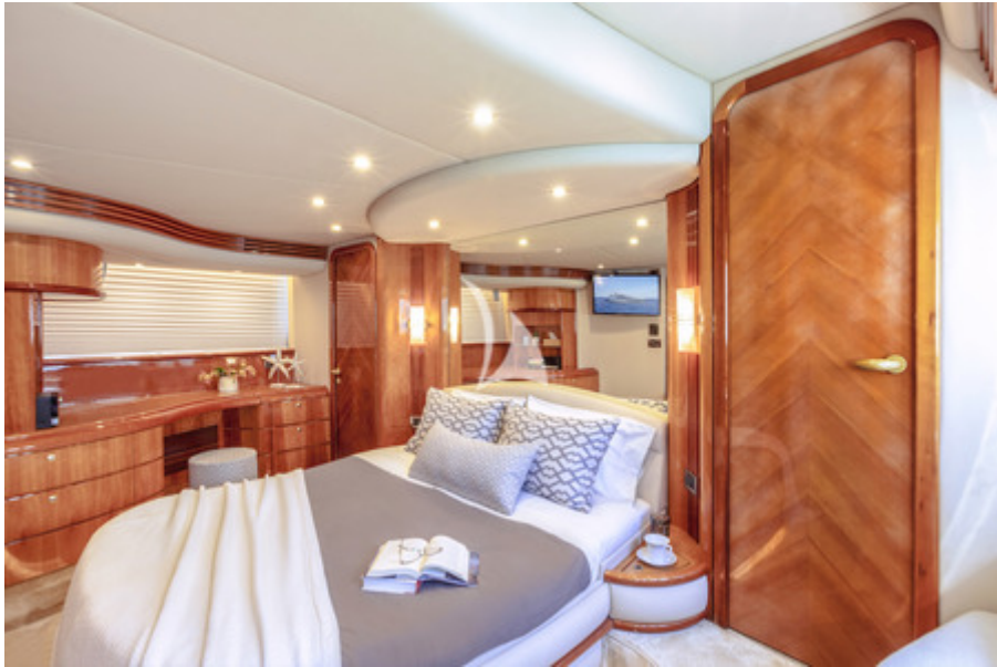
Master cabin other view