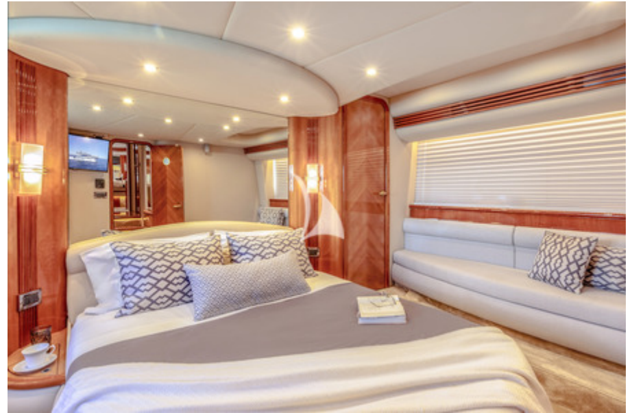
Master cabin other view