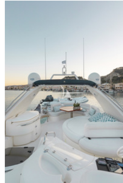
Sundeck other view