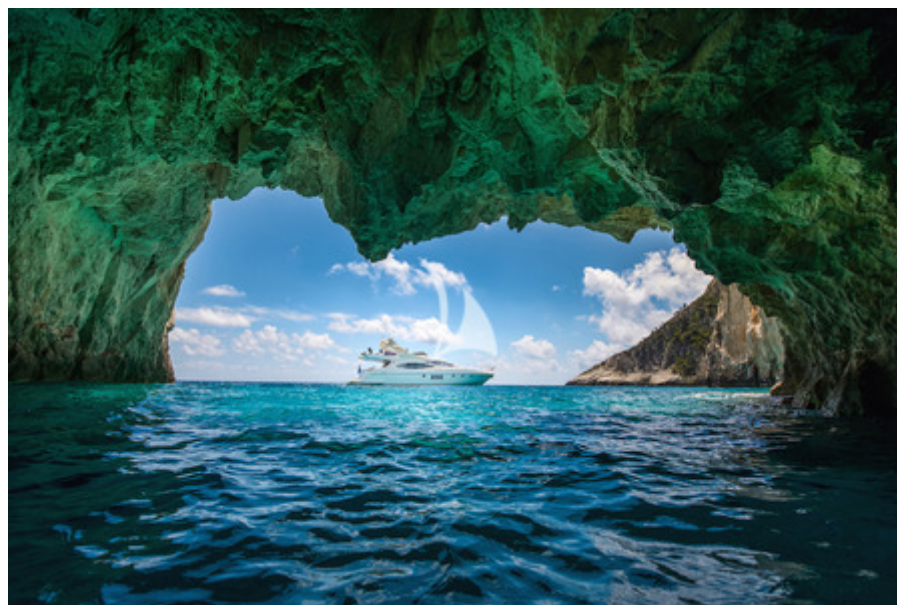
Explore the caves