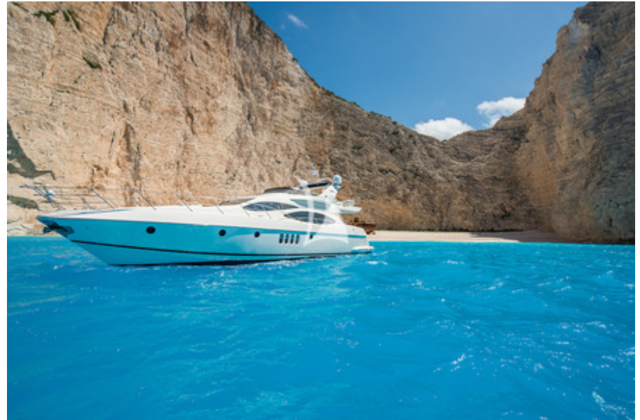
Cruising in Ionian sea