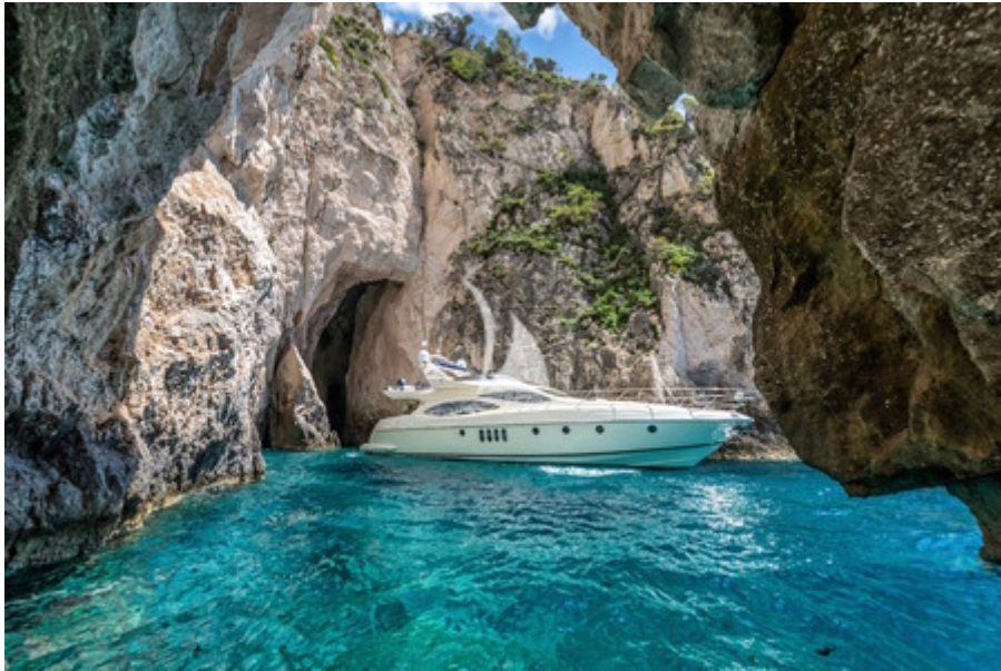
Cruising inside the caves