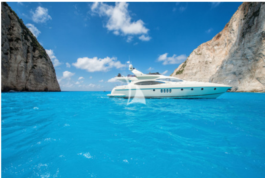
Cruising in Ionian sea