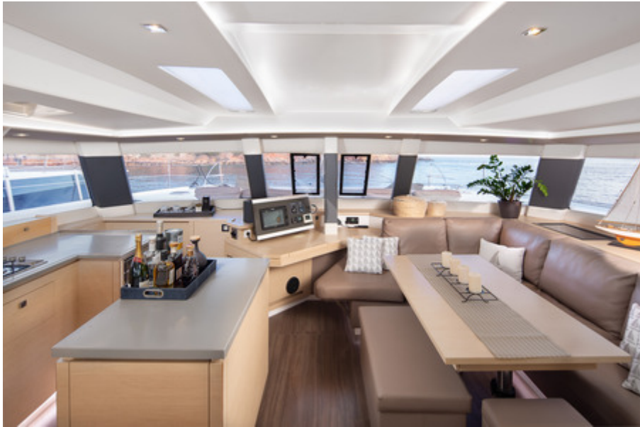
Interior Salon and Dining