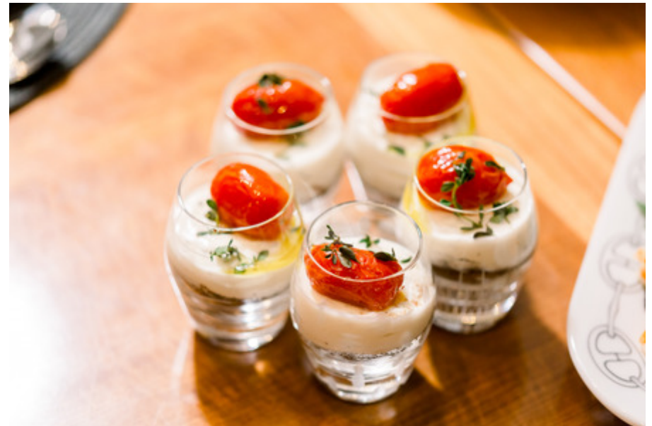
Snacks on Board