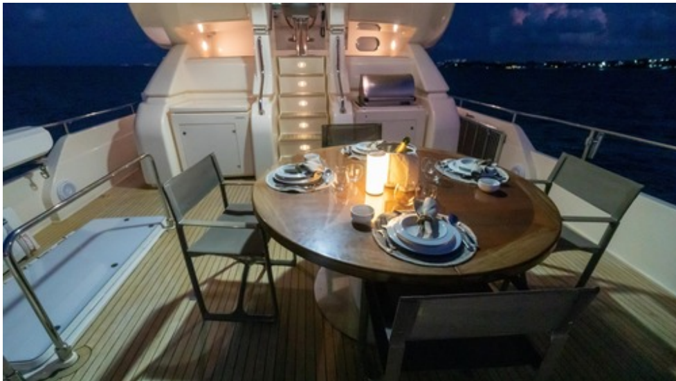
Upper aft deck