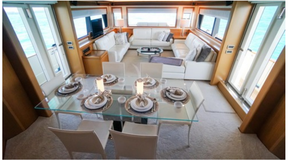
Salon and dining