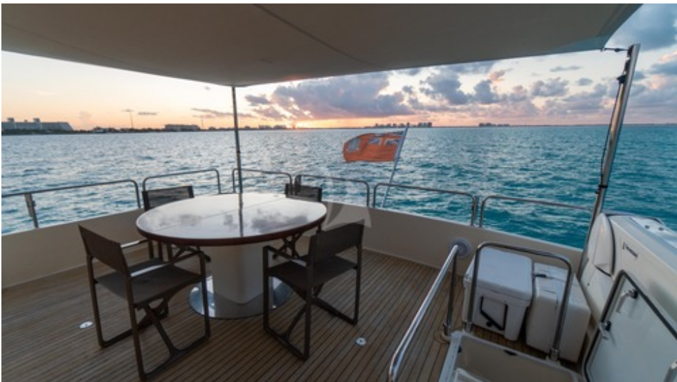
Upper aft deck