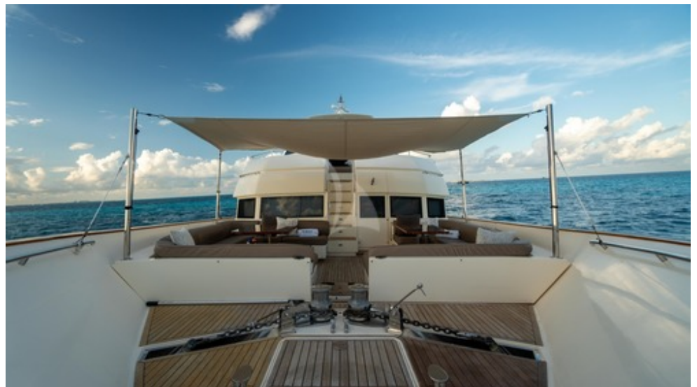
Foredeck with shade