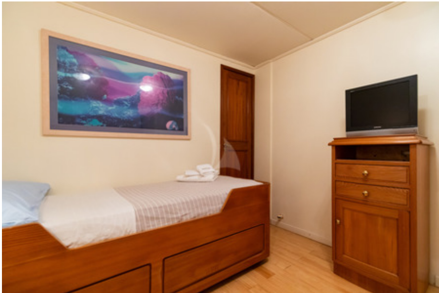
Twin Cabins' bed