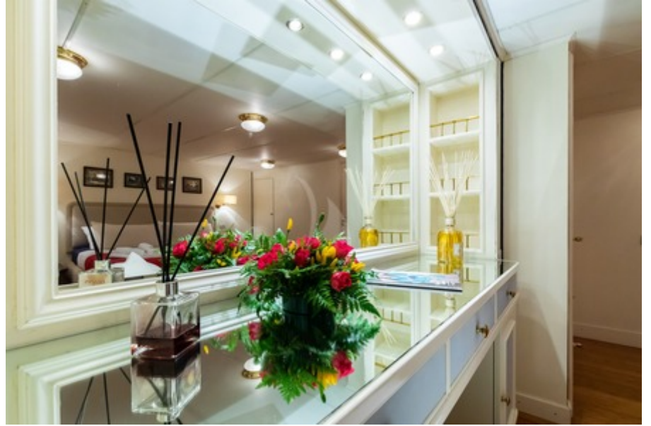
Master Cabin Vanity Table