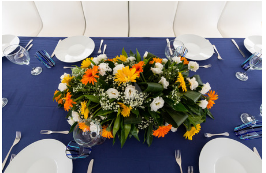
Floreal Table Setting