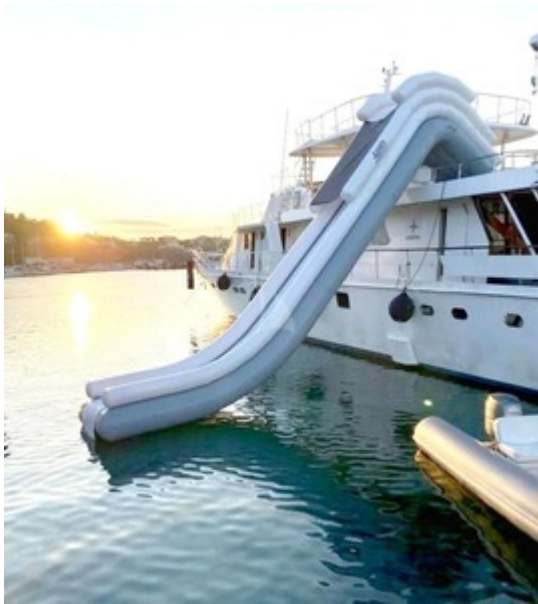
Brand New Water Slide