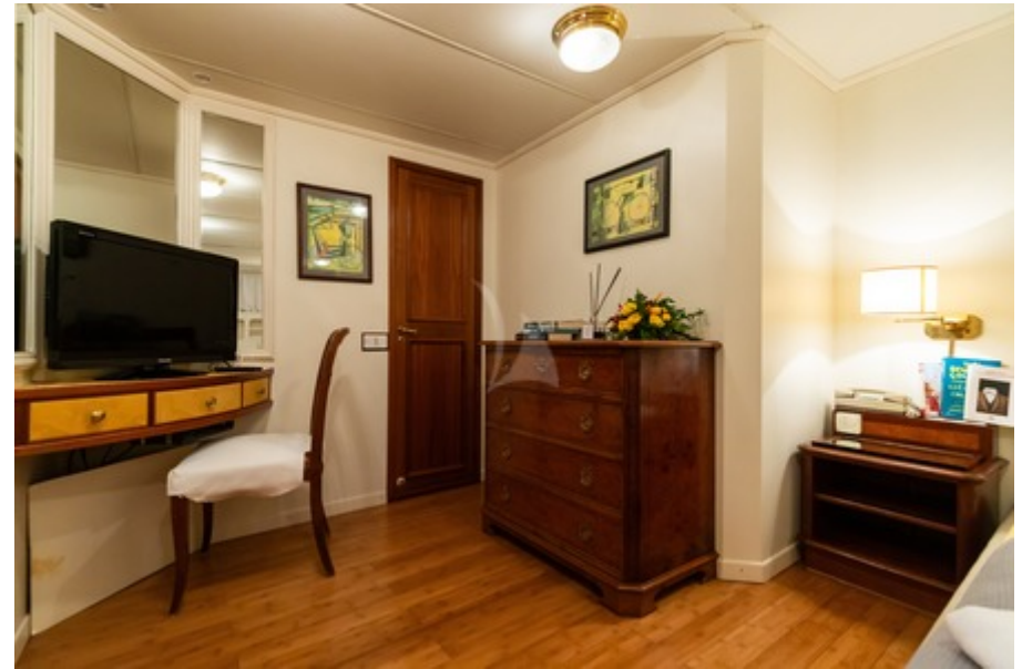
Double Cabin's tv detail