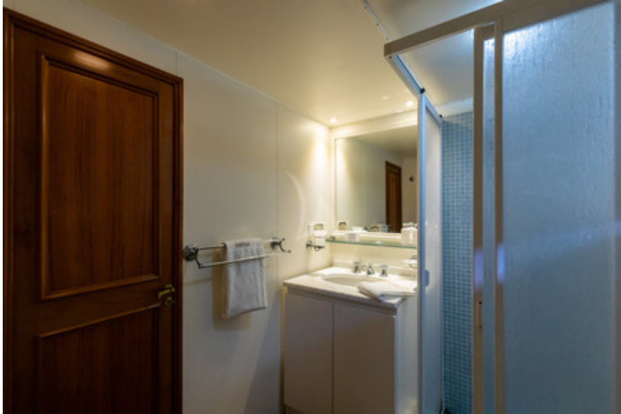
Twin Cabin Bathroom