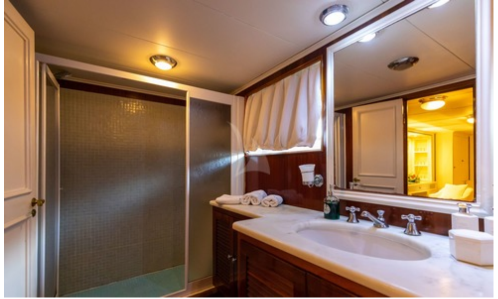
Master Cabin Shower