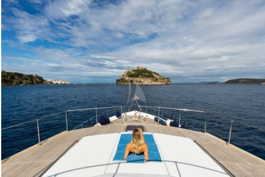
Foredeck Solarium with view