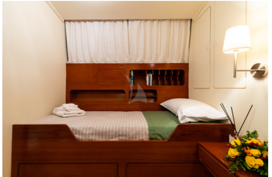
Twin Cabin's bed