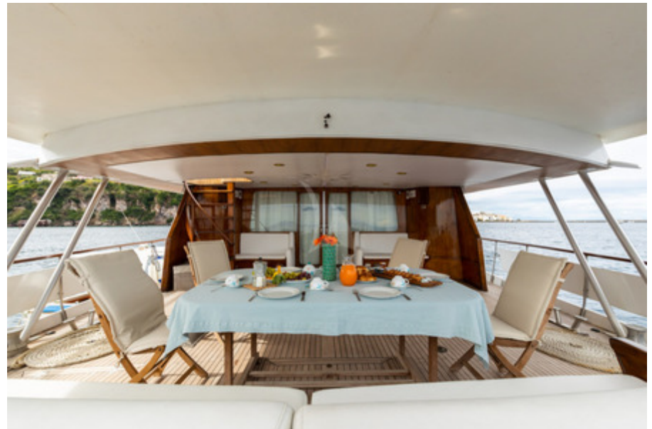
Aft deck al fresco breakfast table