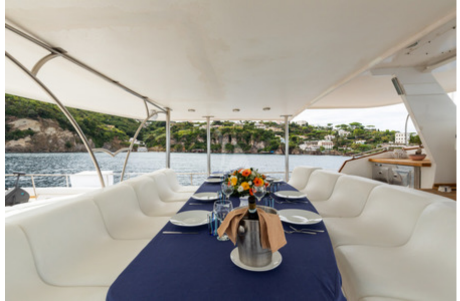
Sundeck al fresco dining area