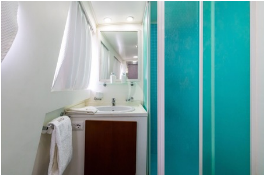
Double Suite Bathroom