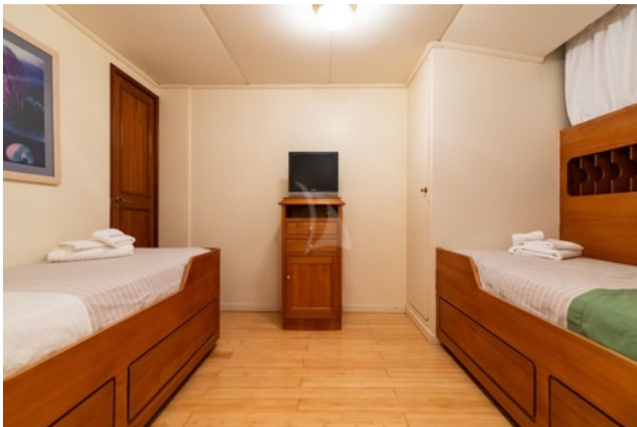
Twin Cabin 2