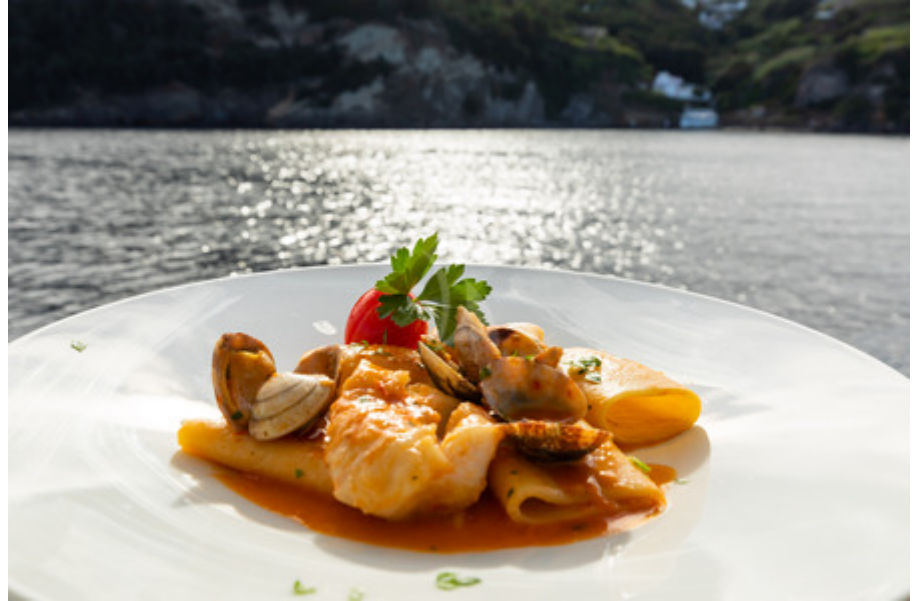
Fish first course