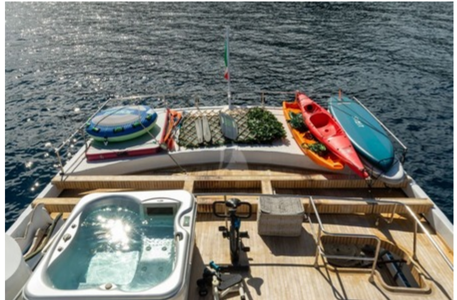
Jacuzzi and Water Toys