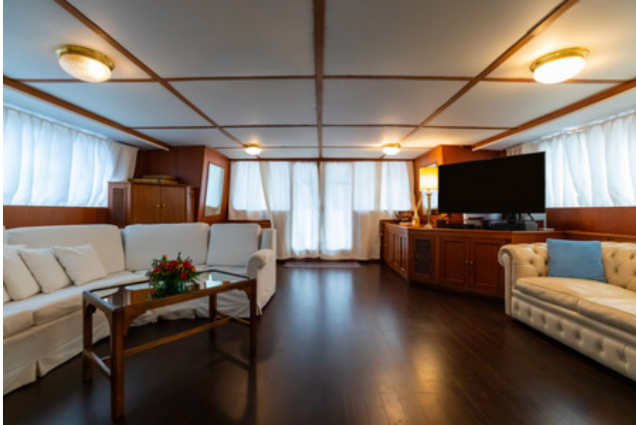
Salon with tv detail and sofas