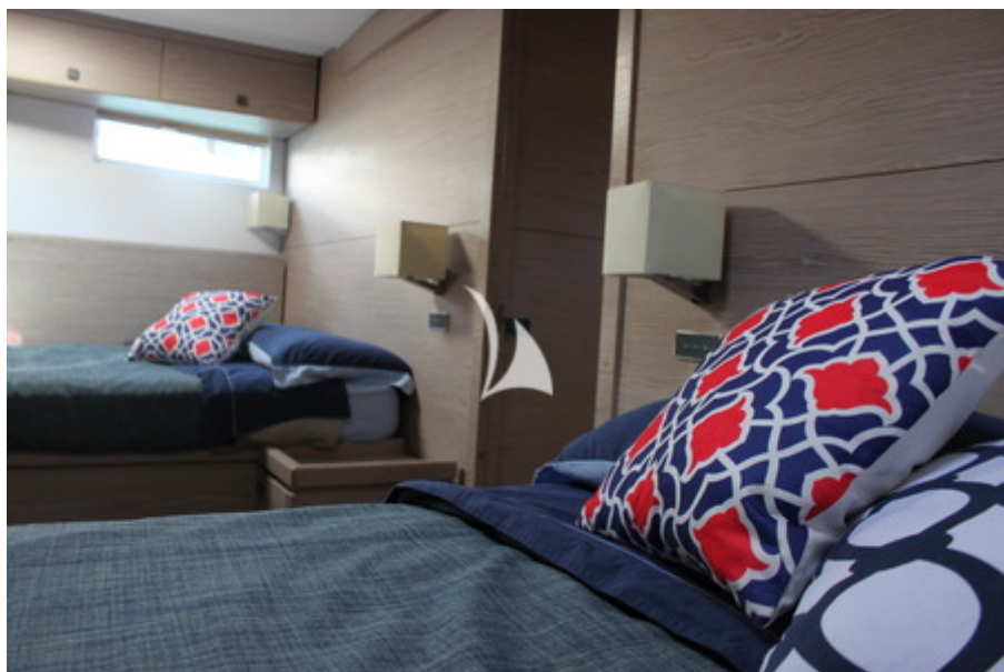
Master's cabin: 2 double beds French size