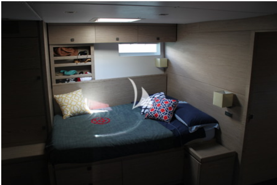
Guest Cabin 2