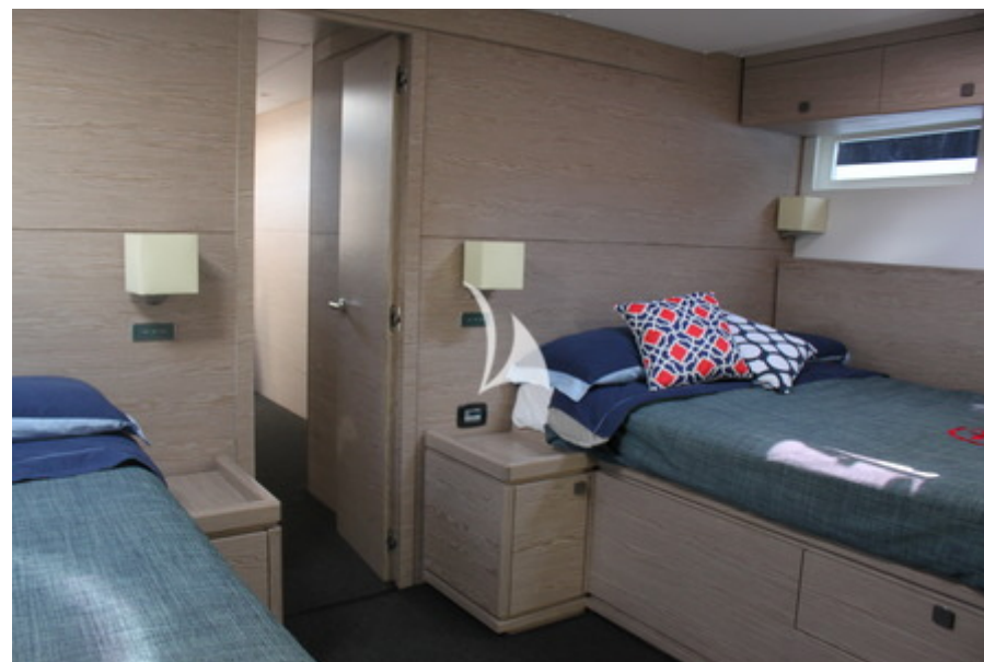
Master's cabin: 2 double beds French size