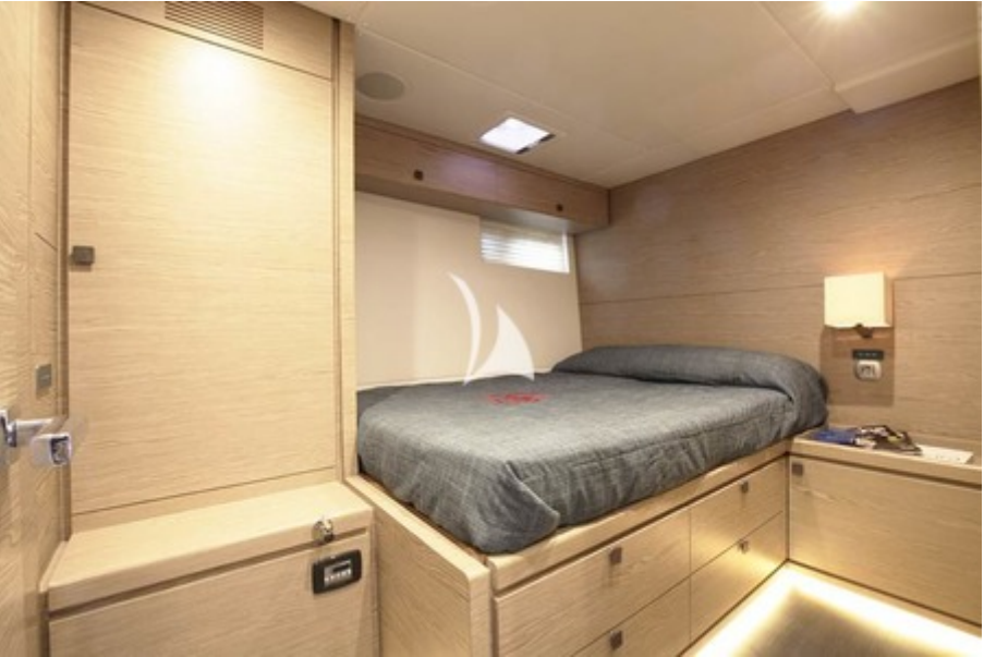
Guest cabin 1 (Guest Cabin 2 is mirror image of this cabin)