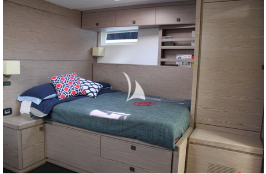
Guest cabin 2