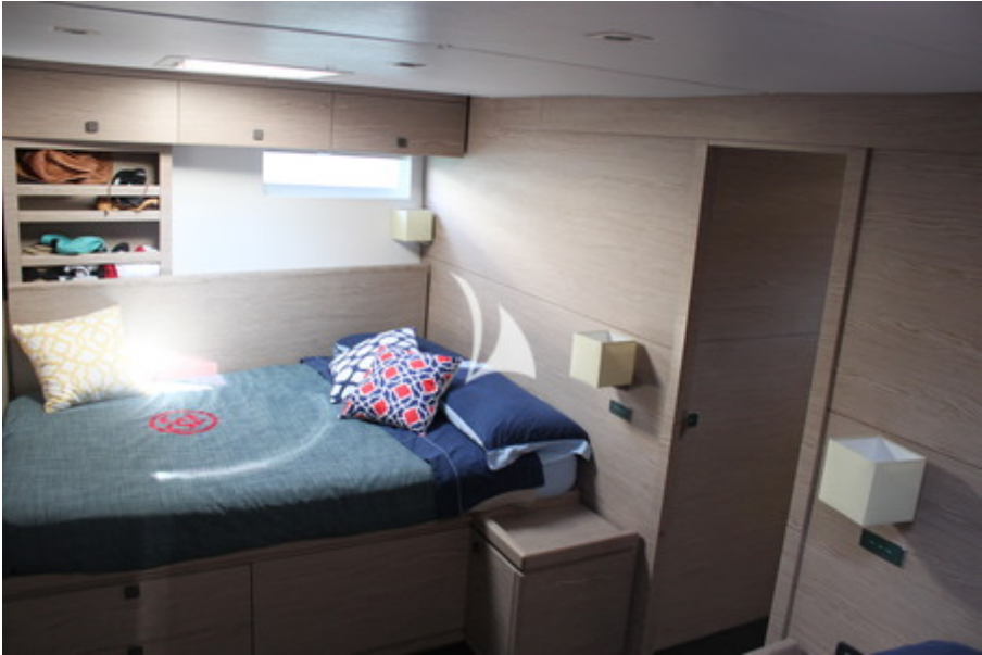
Guest cabin 1