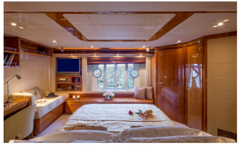
Master cabin other view