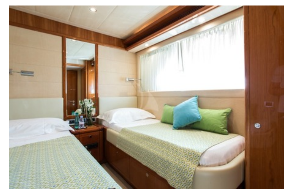
Twin cabin II