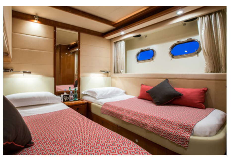
Twin cabin I