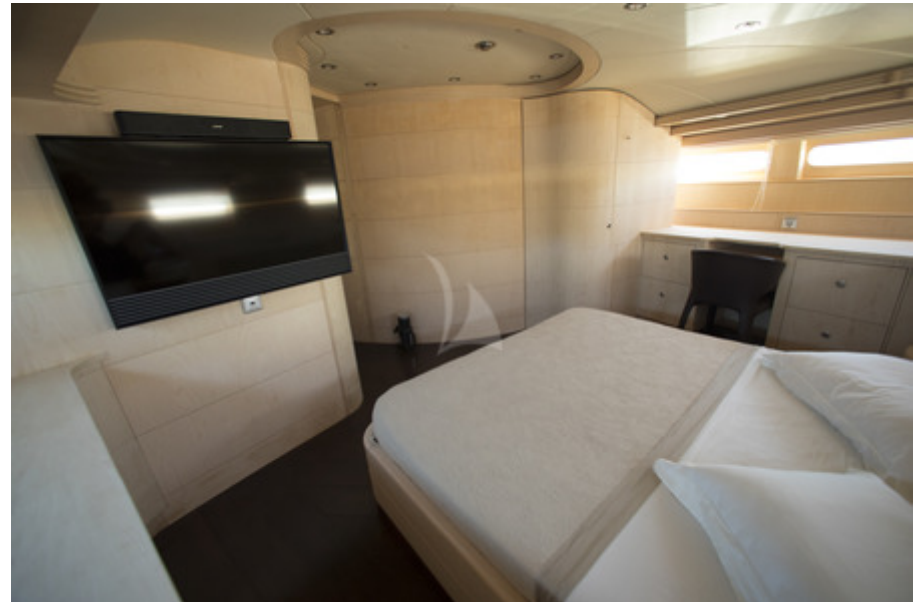
VIP Cabin Main Deck