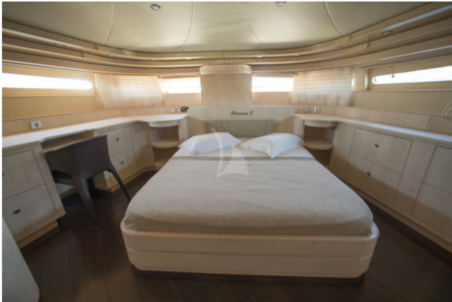
VIP Cabin Main Deck