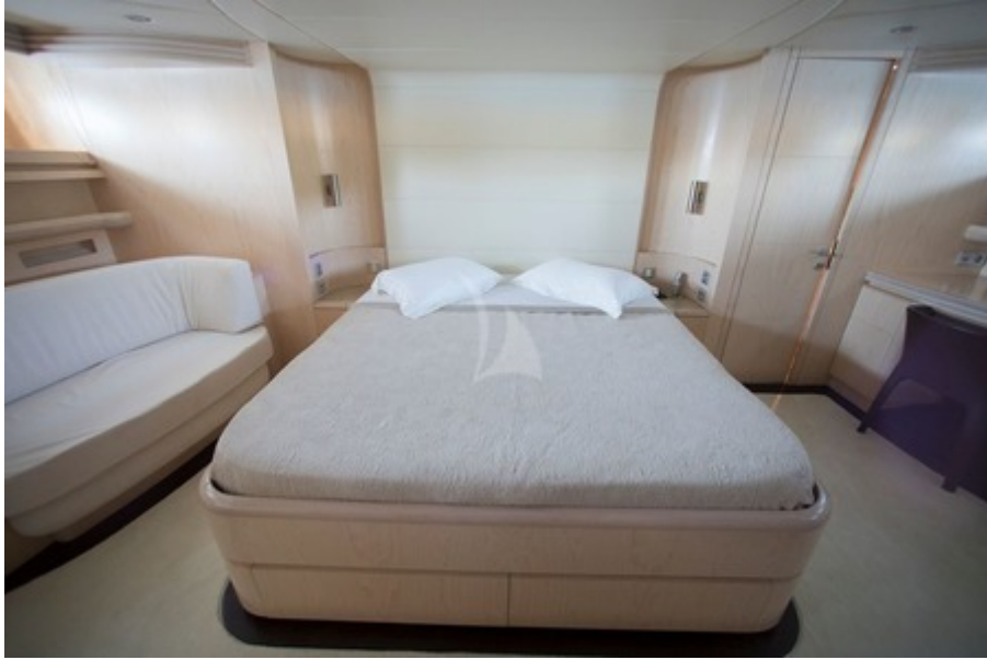
VIP Cabin Lower Deck