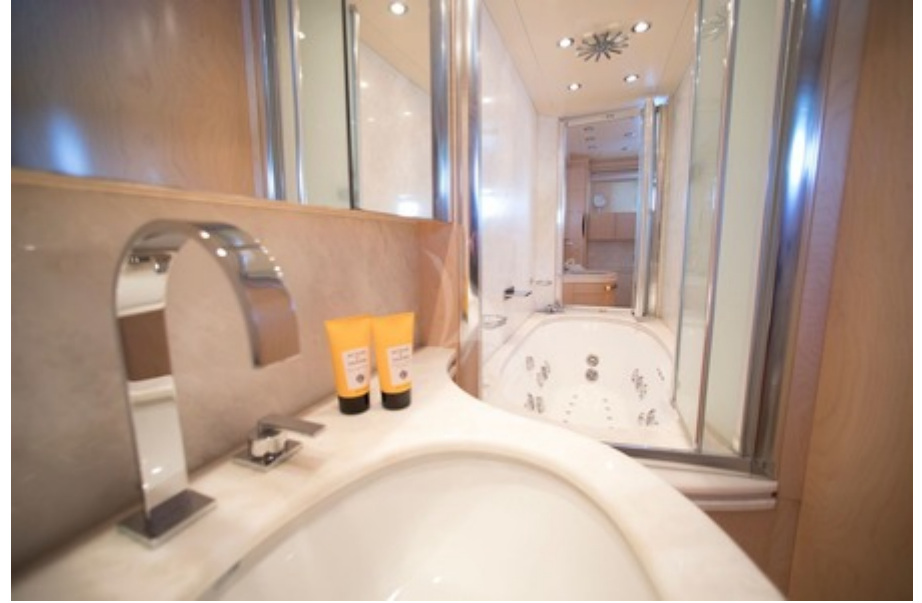
En Suite Facilities (Master Suite)