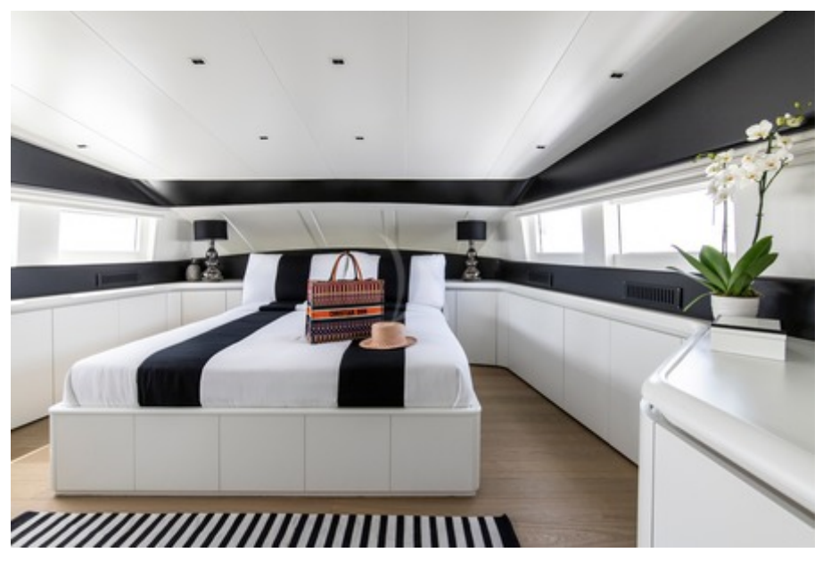
VIP Cabin on Main Deck