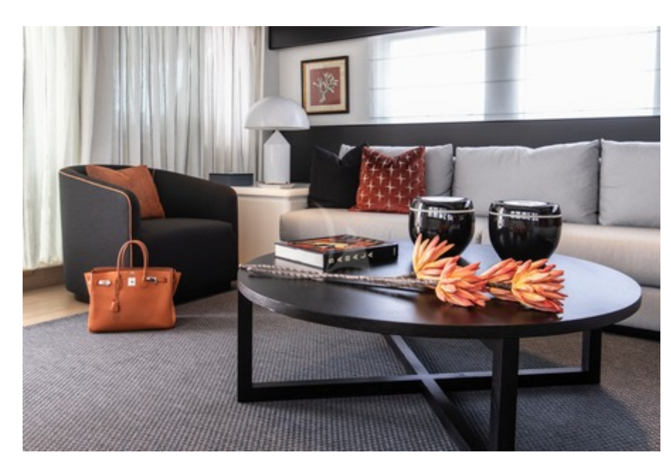
Details of the Saloon