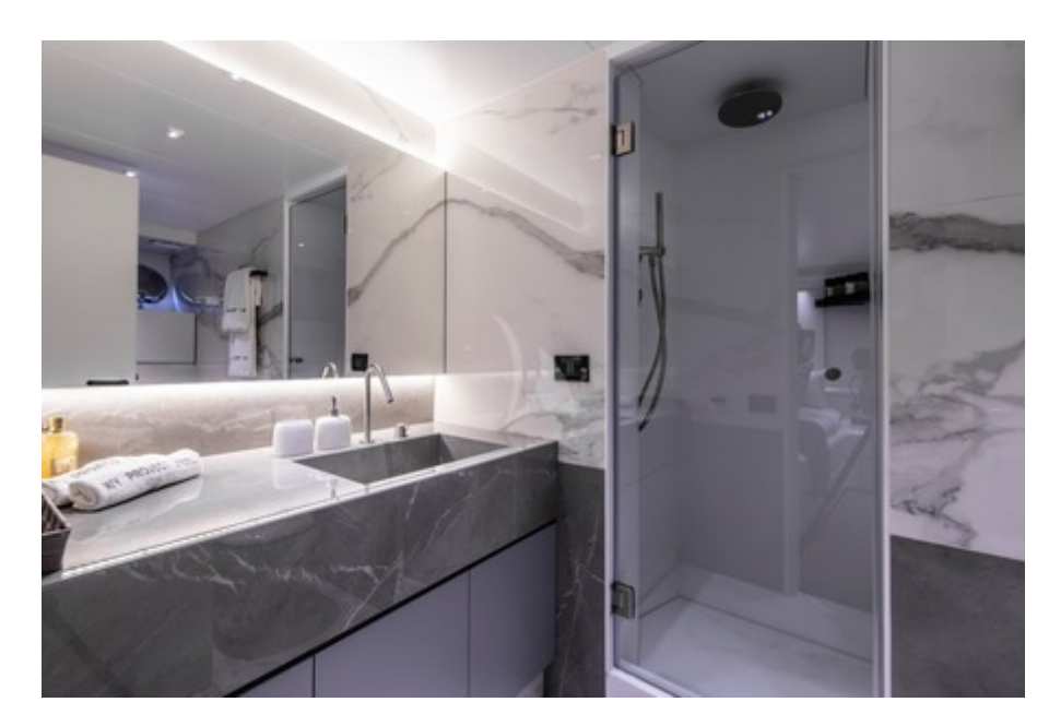
En suite facilities