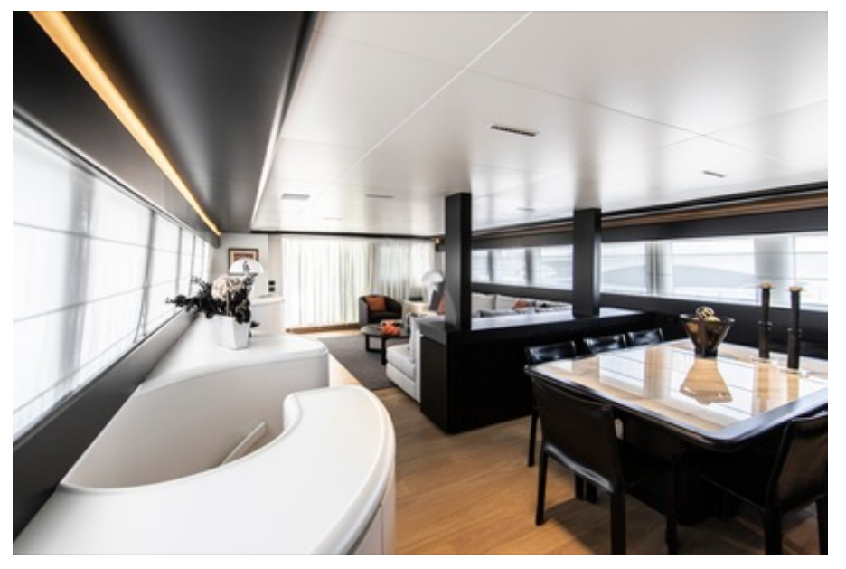
Interior Main Deck