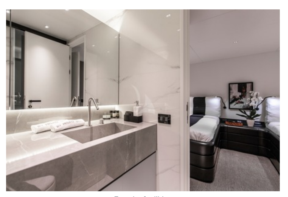
En suite facilities