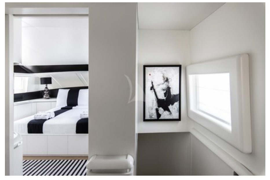
VIP Cabin on Main Deck