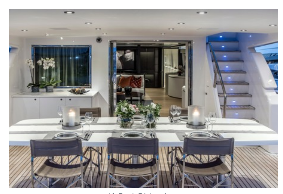
Aft Deck Dining Area