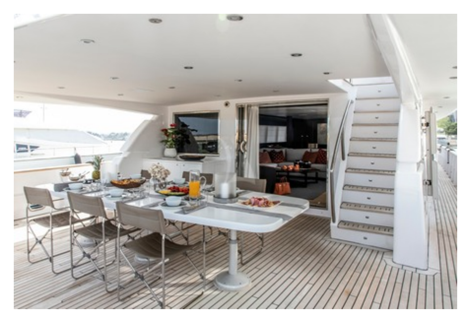
Aft Deck Dining Area