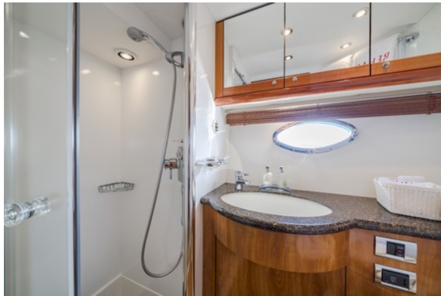
Rehab - Master en suite - 2018