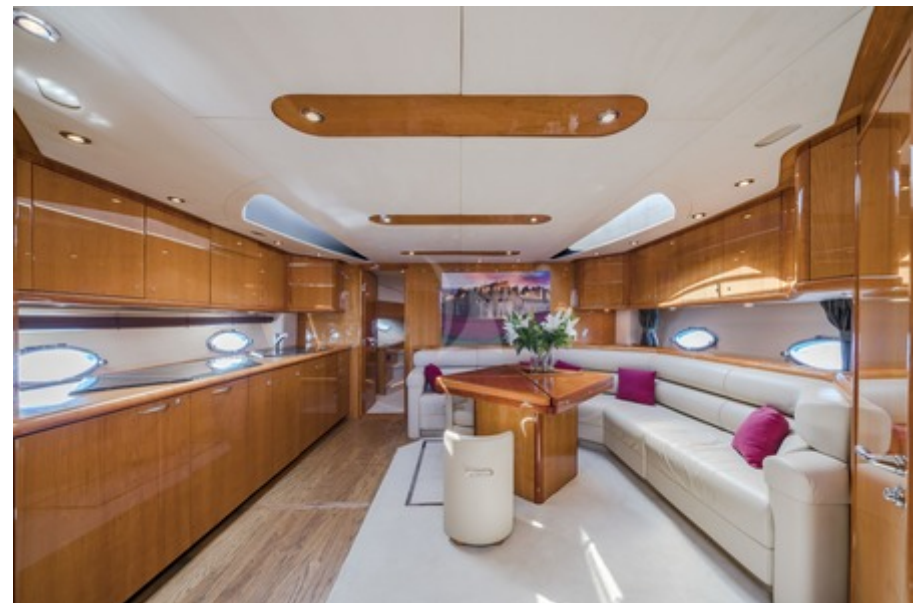
Rehab - Salon - 2018