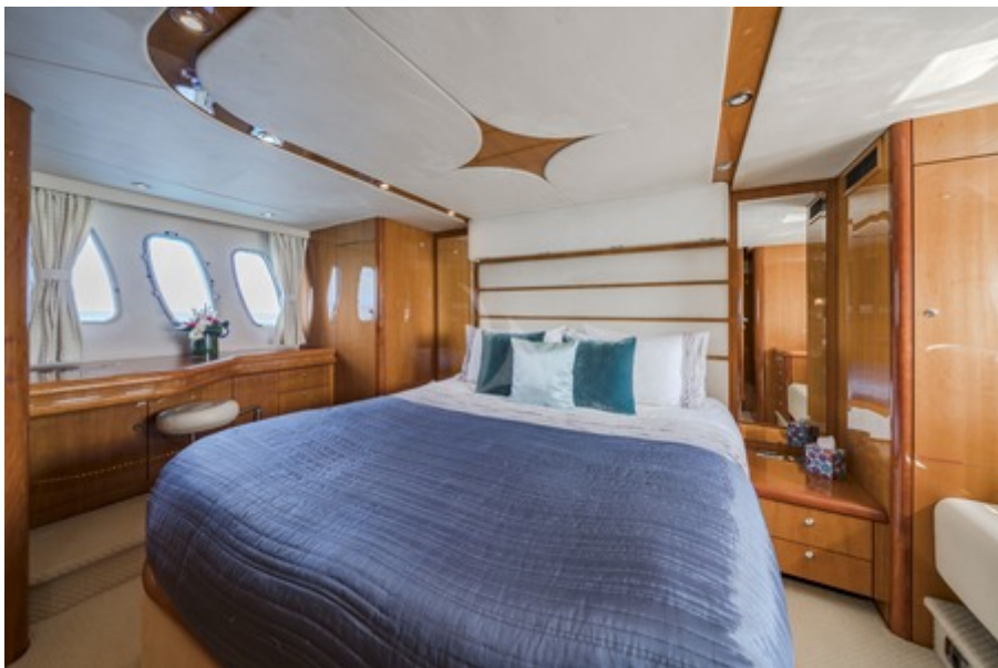
Rehab - Master cabin - 2018