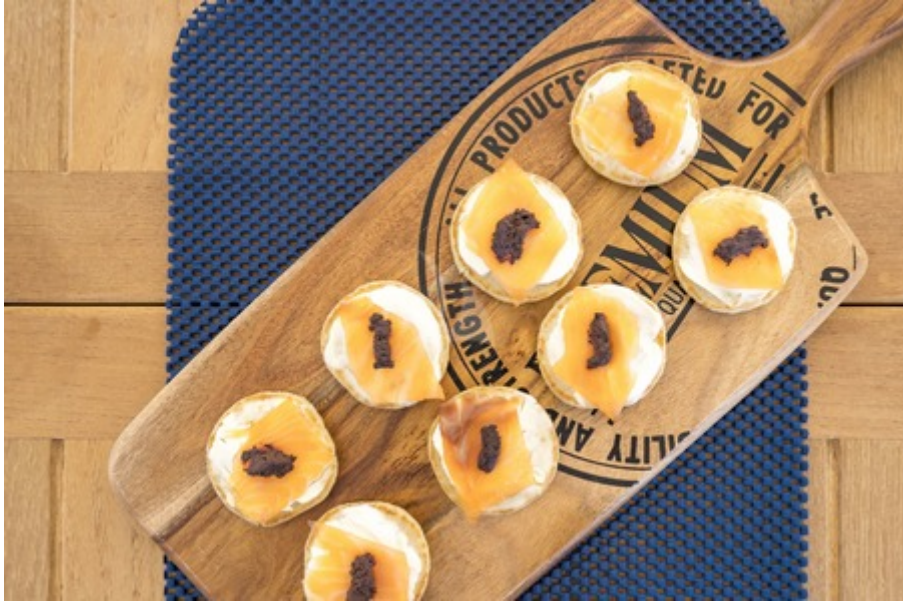
Rehab - Bon apétit! - 2018