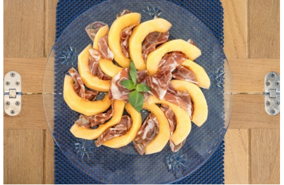
Rehab - Bon apétit! - 2018