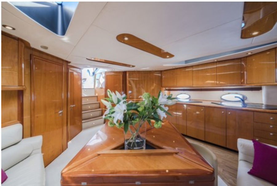
Rehab - Salon - 2018