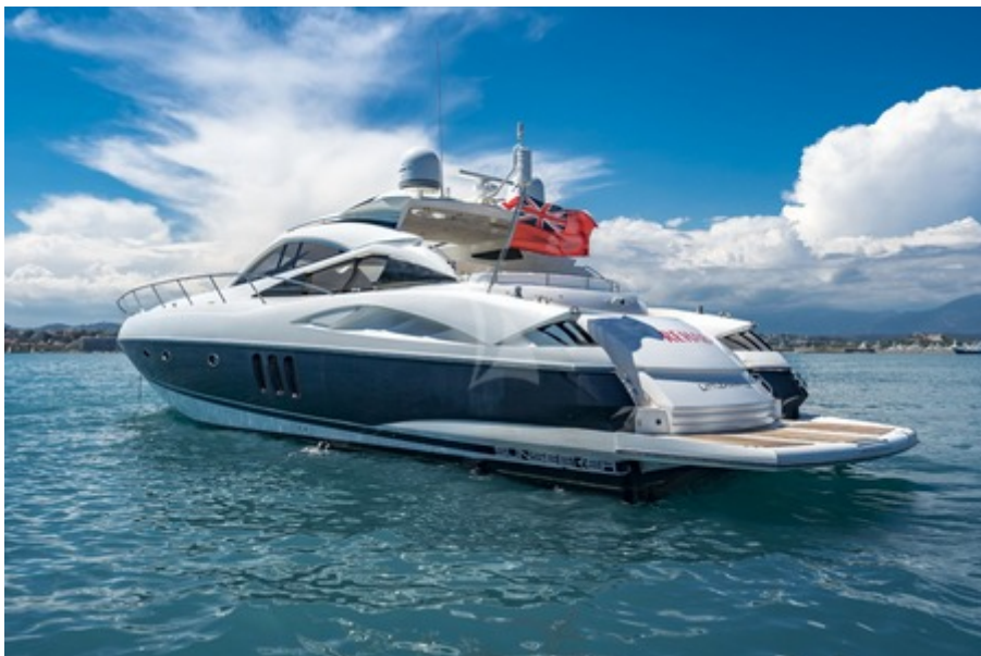
Rehab - At anchor - 2018