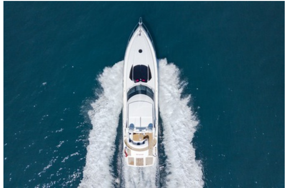
Rehab - Running shot - 2018