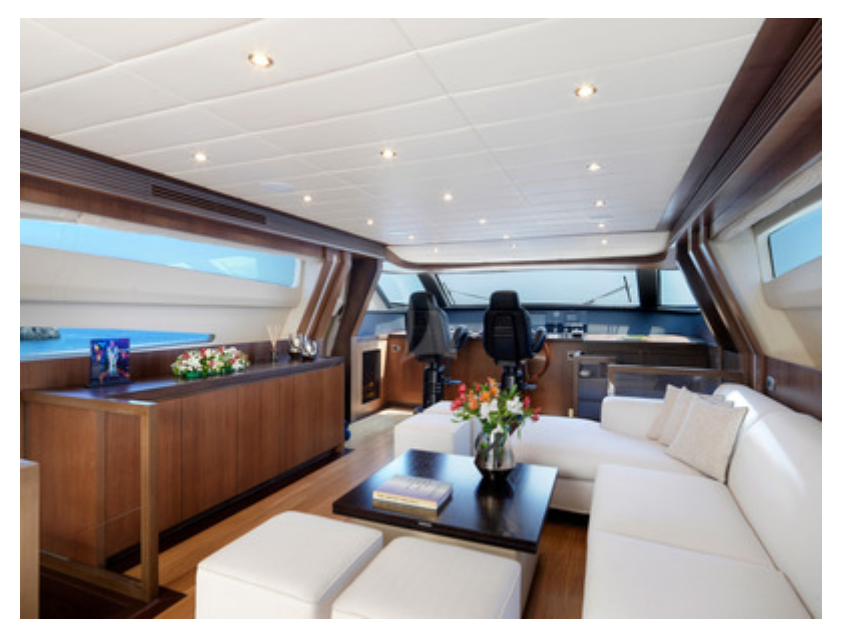
Saloon other view