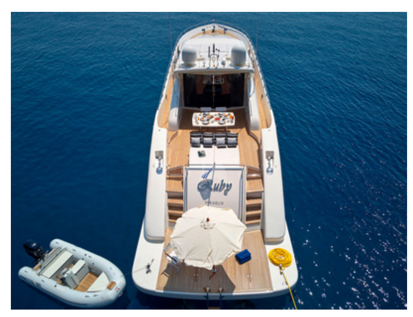
Top view 2