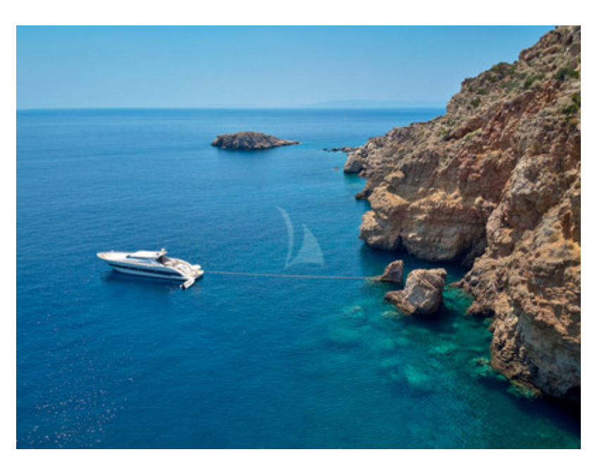
Explore unique destinations