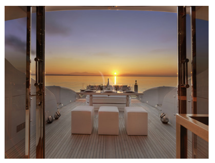
Aftdeck during sunset