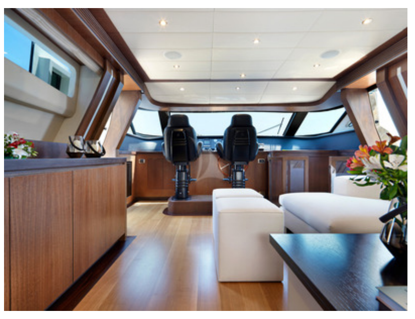
Saloon other view 2