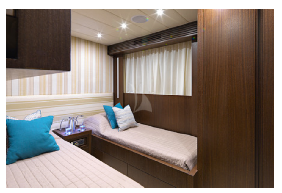
Twin cabin 2