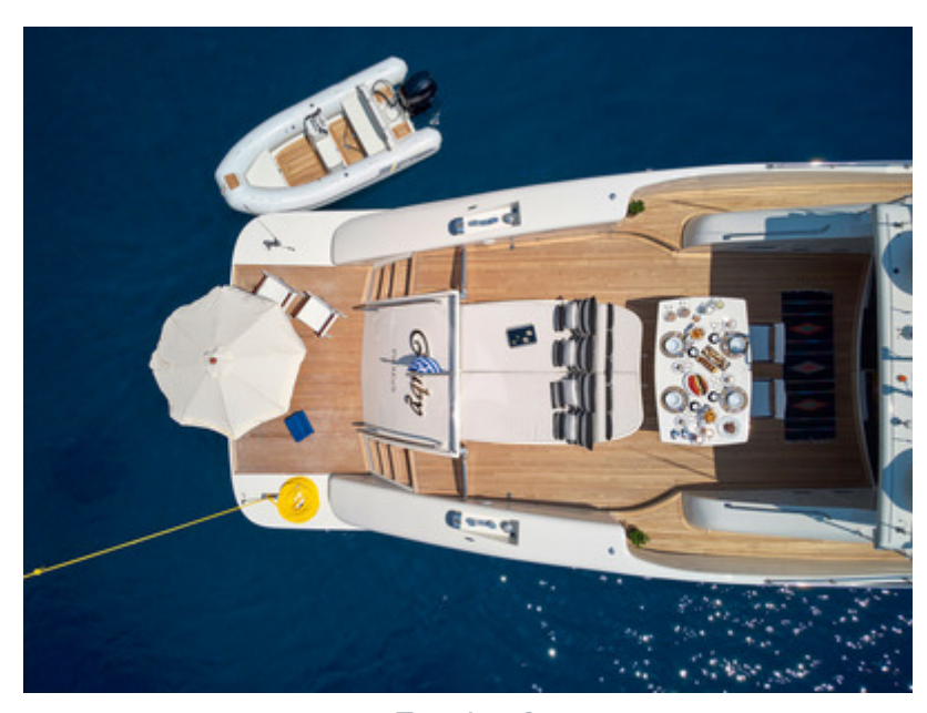
Top view 3