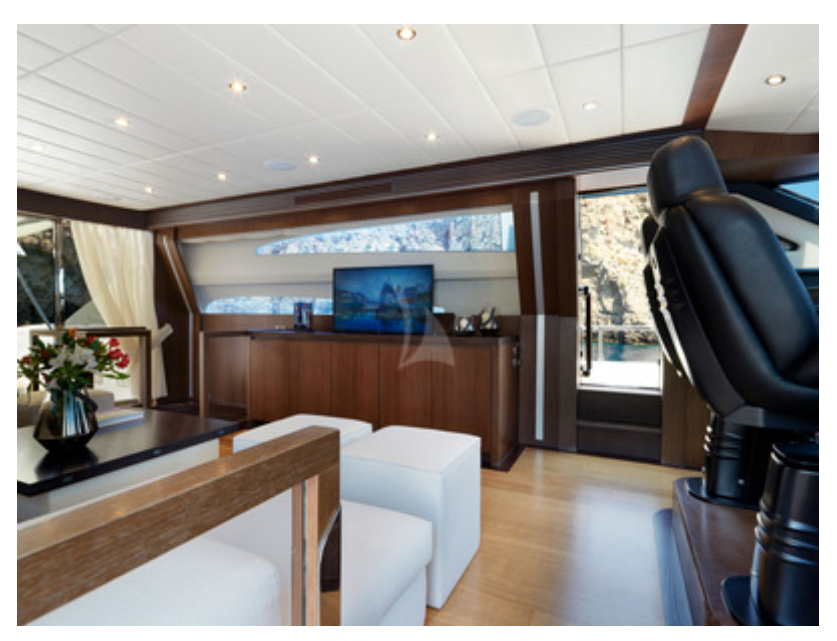
Saloon other view 3