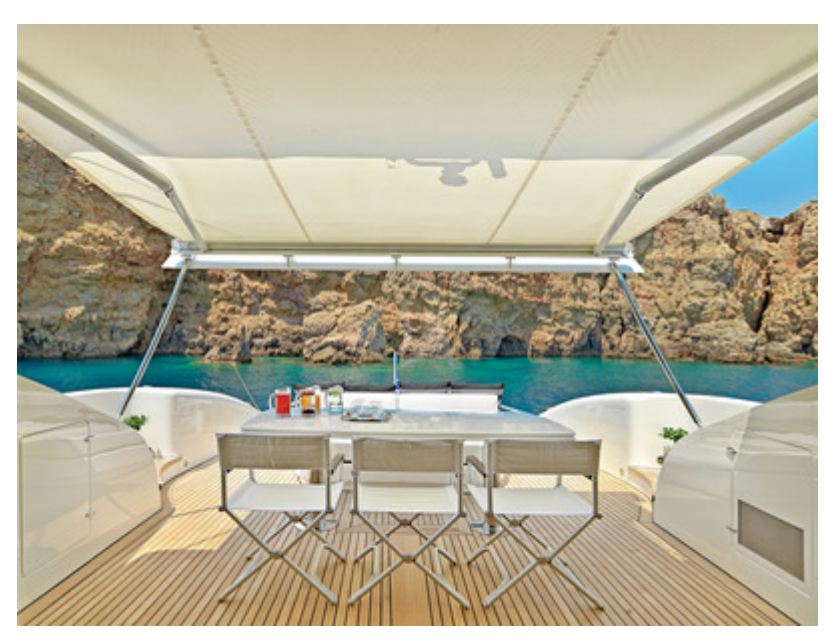
Aftdeck with shade