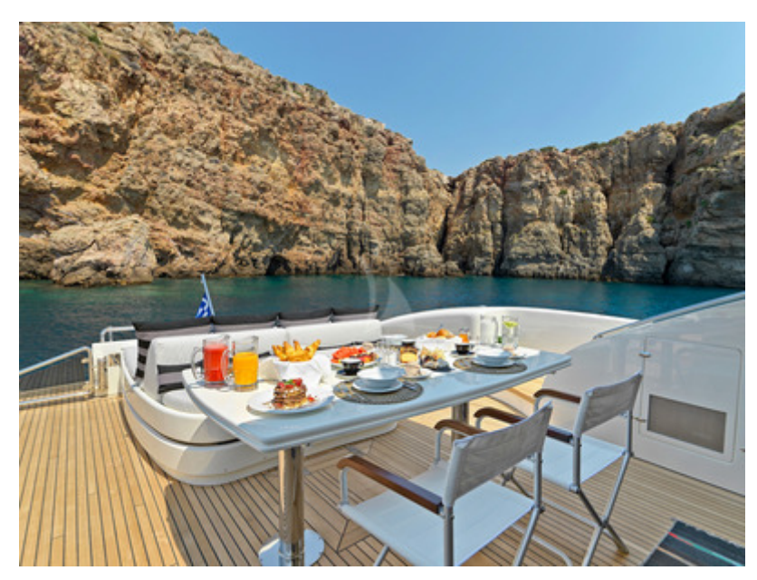
Delicious breakfasts onboard