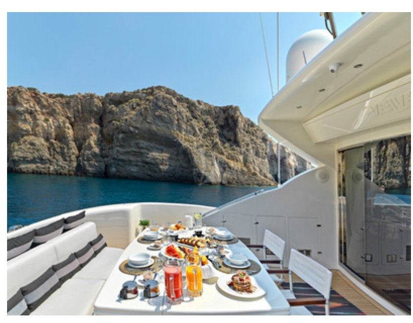
Aftdeck side view