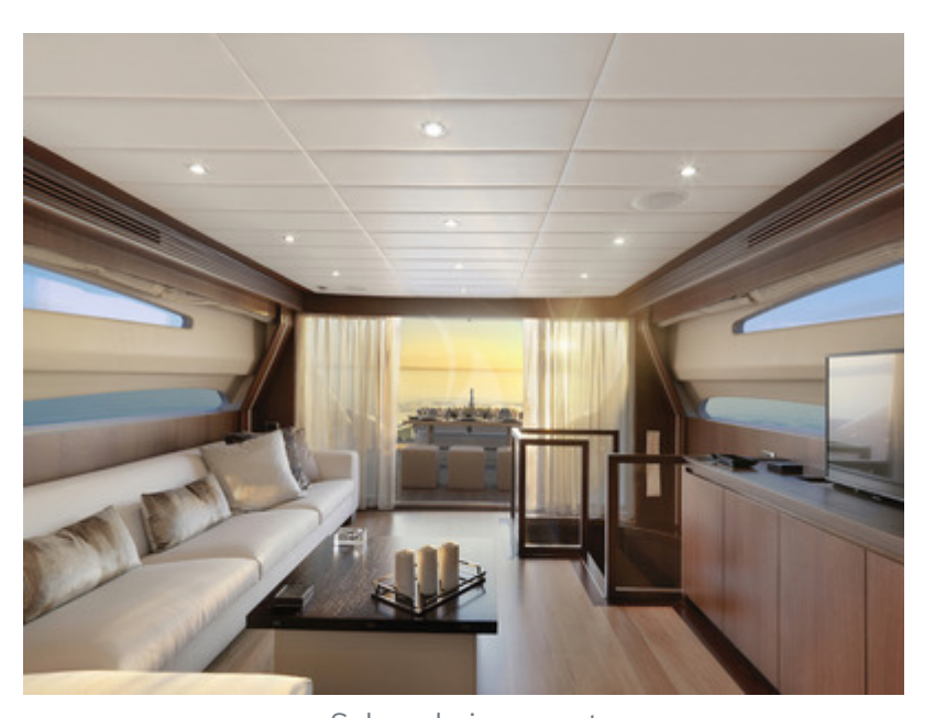
Saloon during sunset