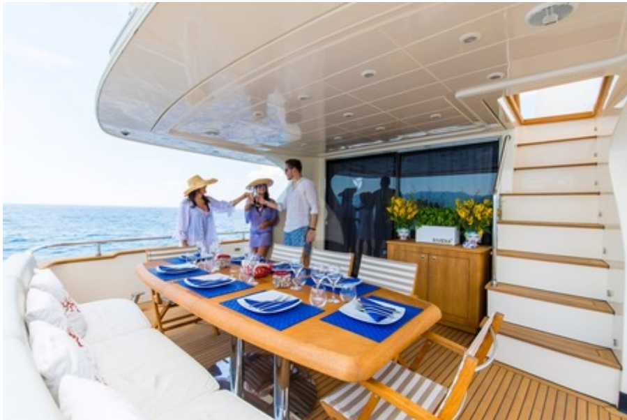
Alfresco happy hour