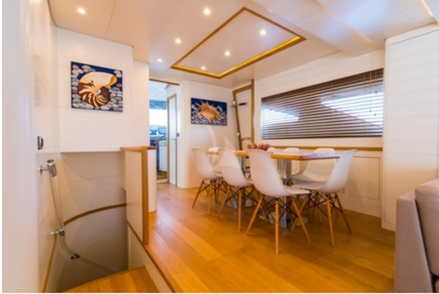
Formal dining area