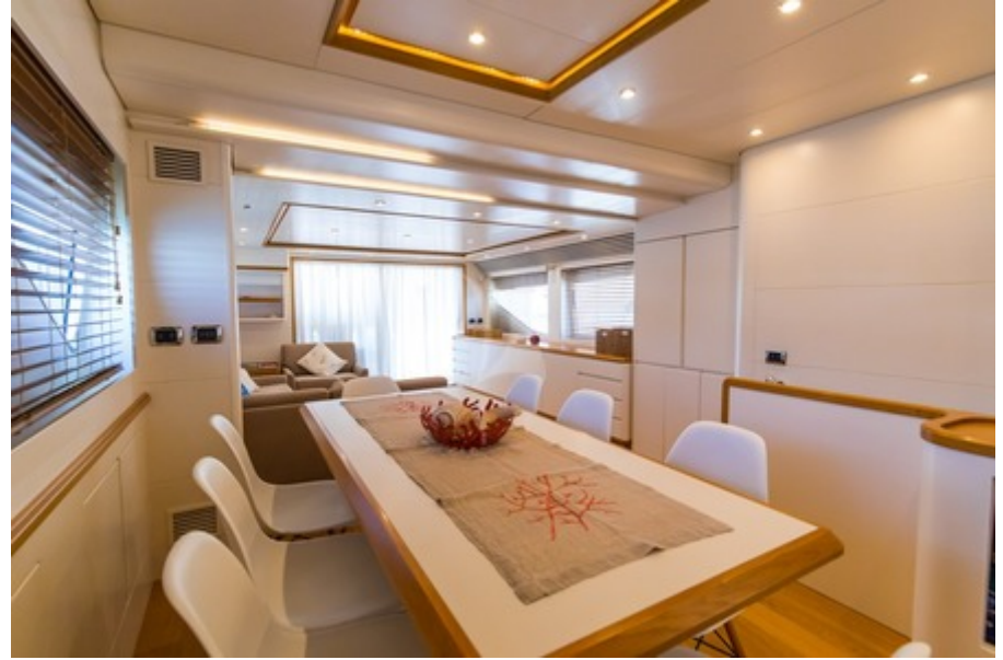
Formal dining detail