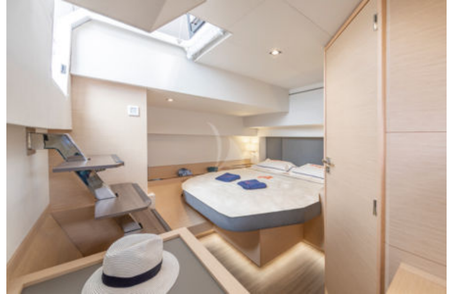
Sistership - Double cabins