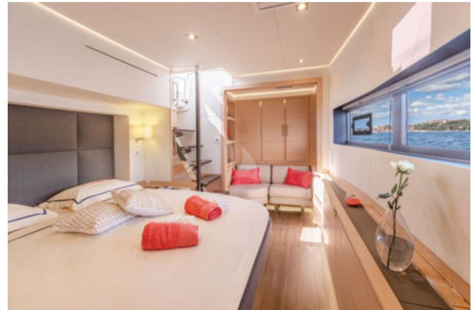
Sistership - Master cabin