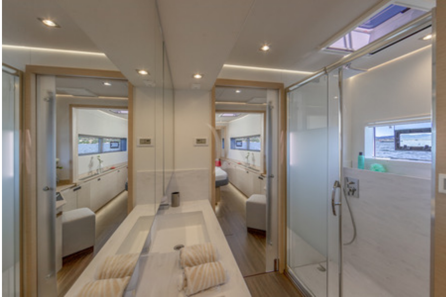
Sistership - Master bathroom