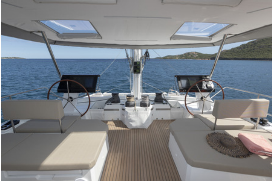
Sistership - Fly Bridge