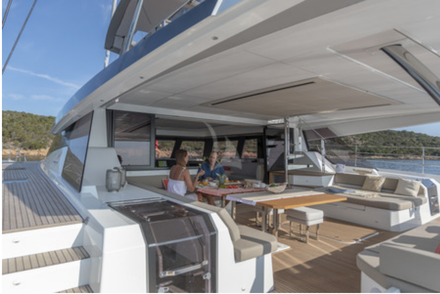
Sistership - Aft dining area