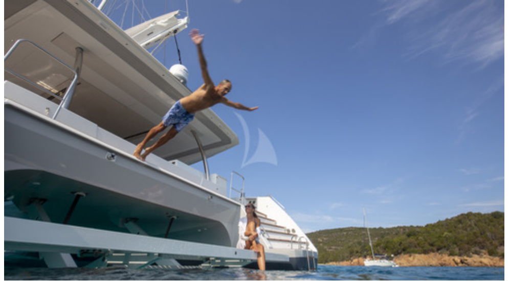
Sistership - Hydraulic Bathing platform