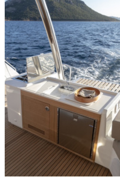
Sistership - Wet bar/Barbeque