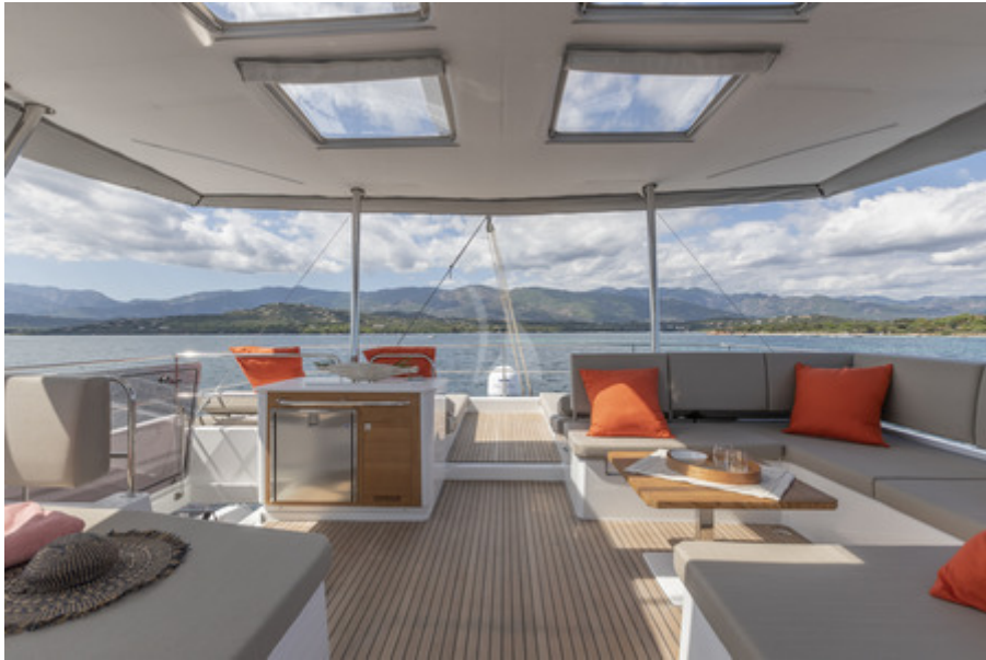
Sistership - Flybride