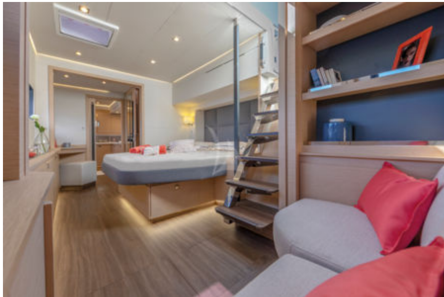
Sistership - Master cabin