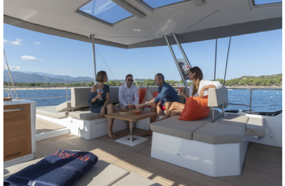
Sistership - Fly bridge