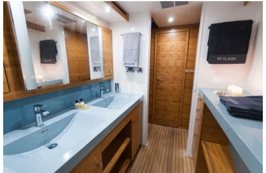
Owner's En Suite