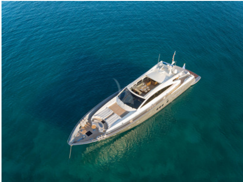
Sun Anemos - Aerial