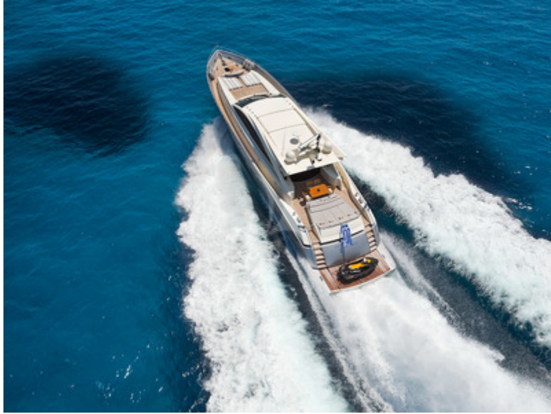
Sun Anemos - Cruising