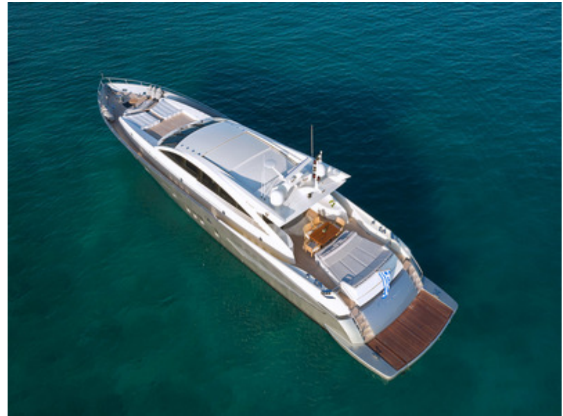
Sun Anemos - Aerial