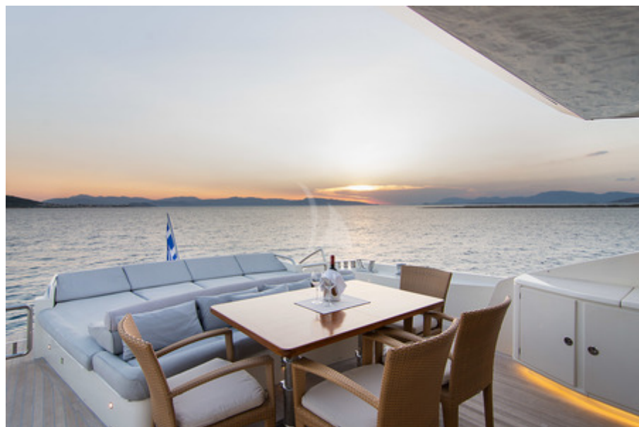
Aft deck with alfresco dining and Sunpad