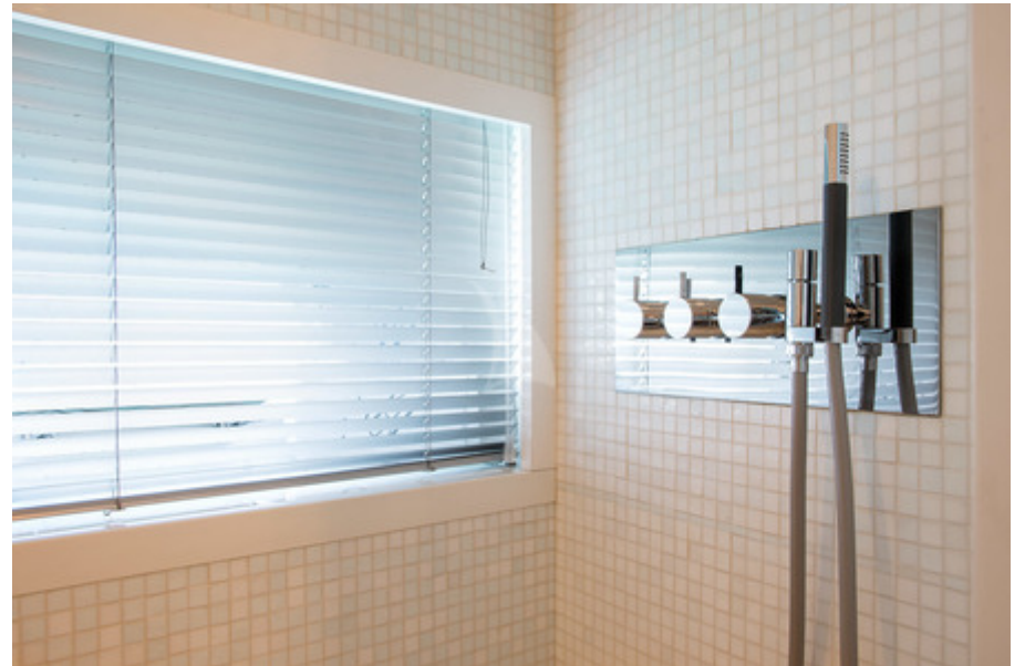
VIP Bathroom - Details