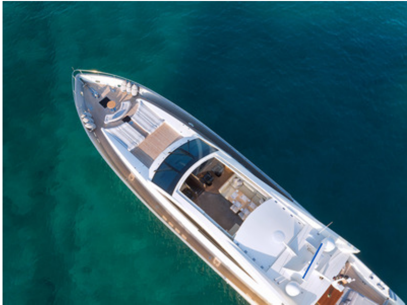
Open Hard Top