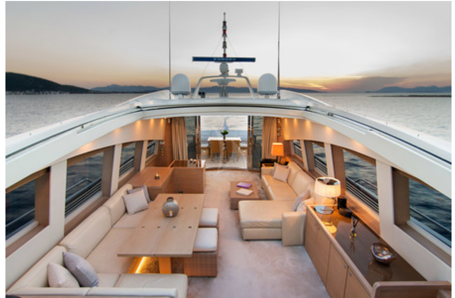
Open Hard Top