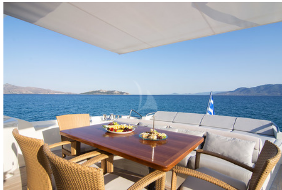
Aft deck with alfresco dining and Sunpad