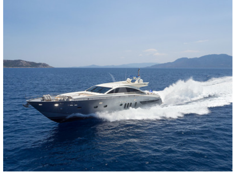
Sun Anemos - Cruising