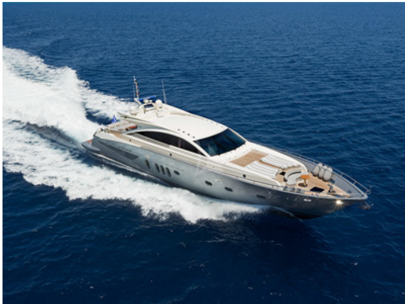
Sun Anemos - Cruising