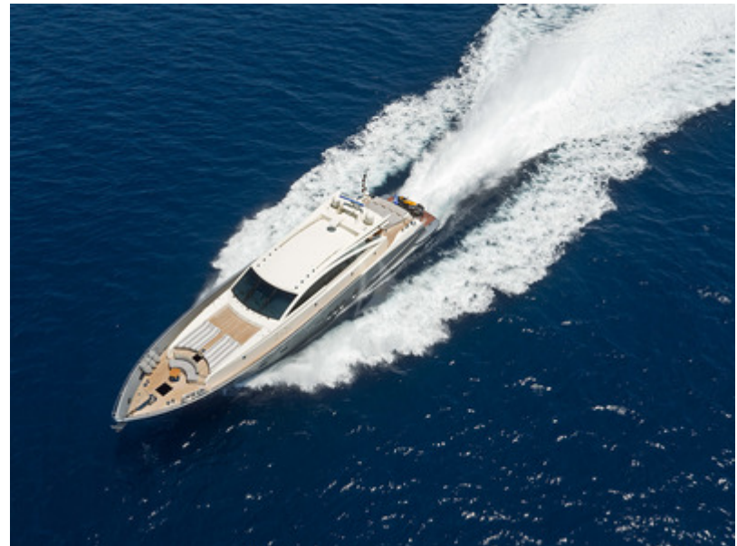
Sun Anemos - Cruising