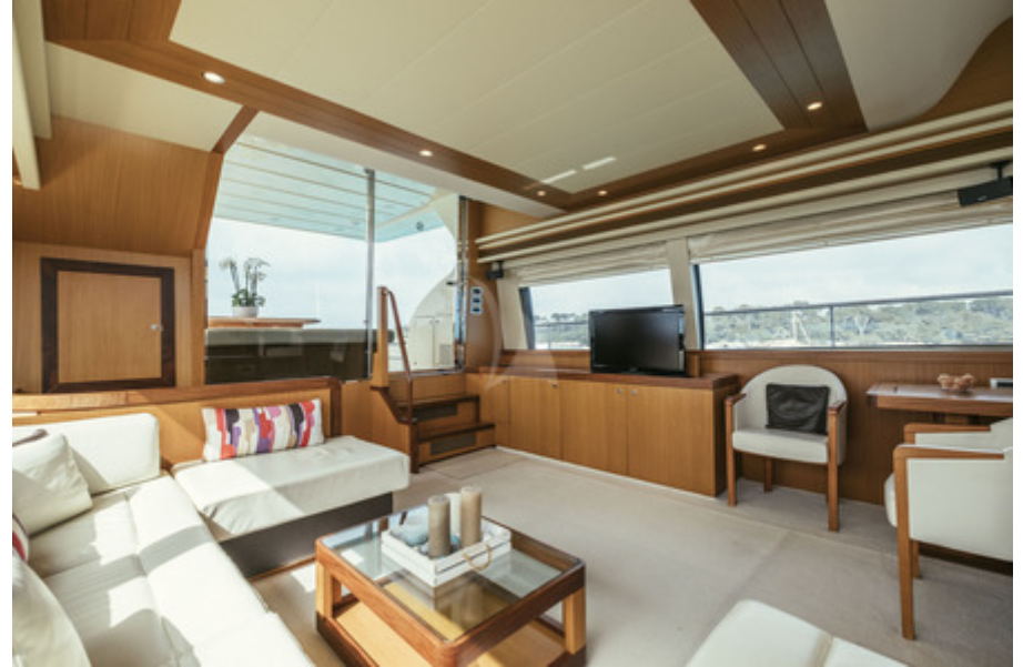
TO ESCAPE - Salon - 2017