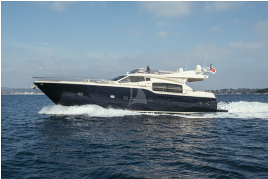
TO ESCAPE - Running shot - 2017