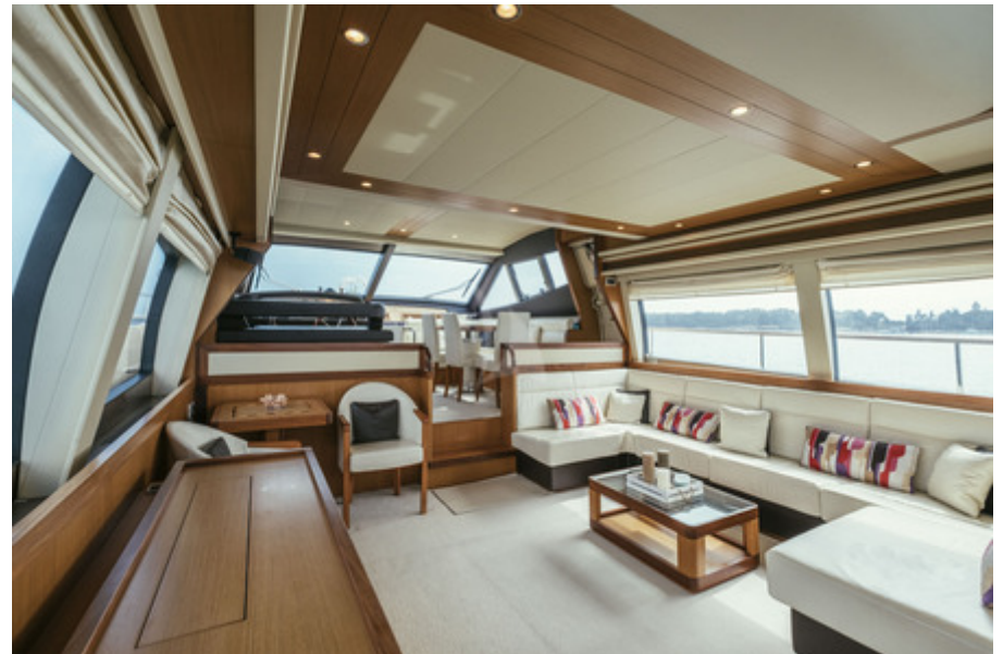
TO ESCAPE - Salon - 2017