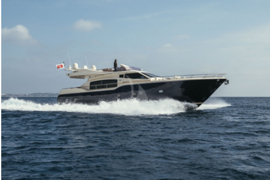
TO ESCAPE - Running shot - 2017