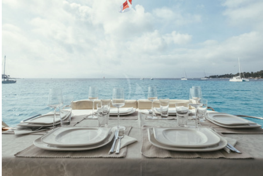
TO ESCAPE - Lunch with a view - 2017