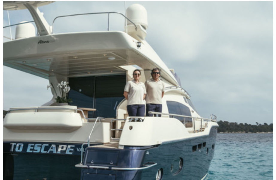
TO ESCAPE - Crew - 2017