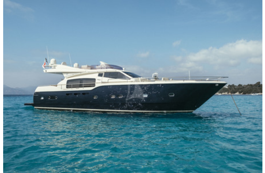
TO ESCAPE - At anchor - 2017