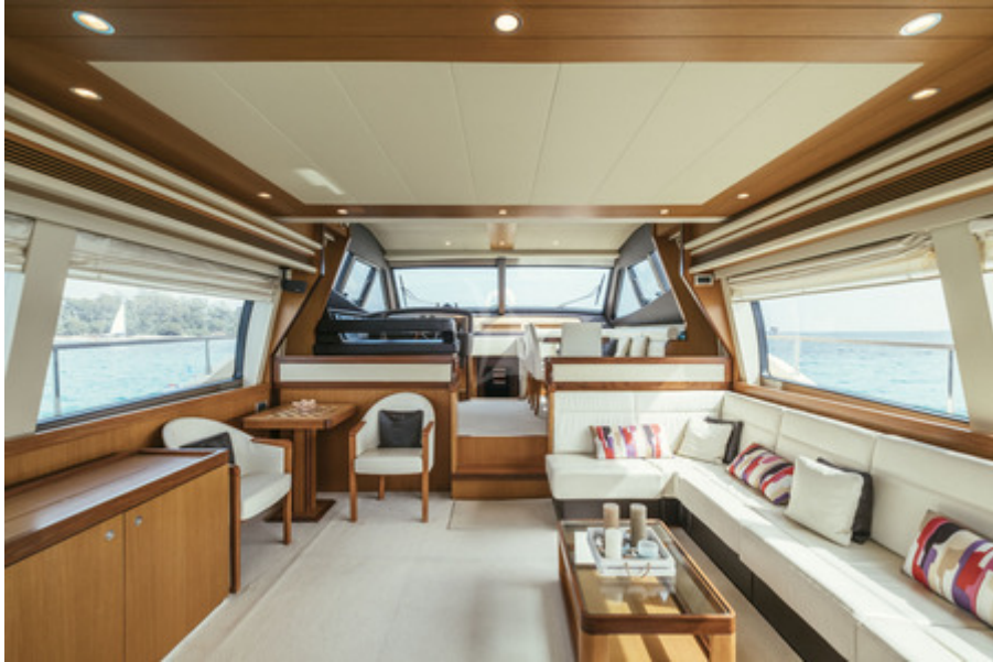
TO ESCAPE - Salon - 2017