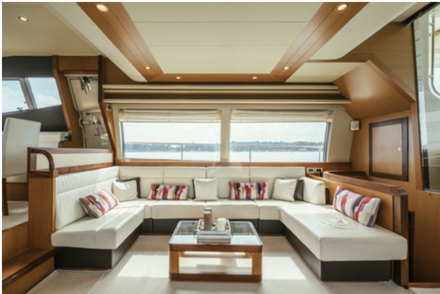
TO ESCAPE - Salon - 2017