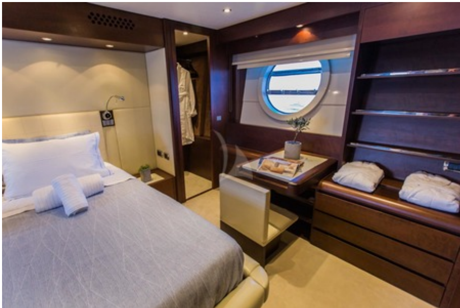
Master Dressing room