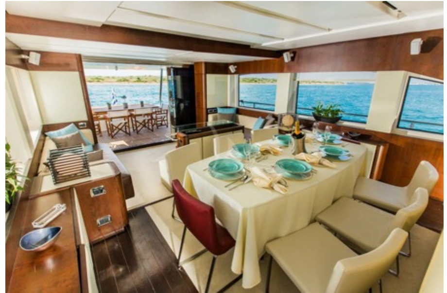
Salon and Dining Area