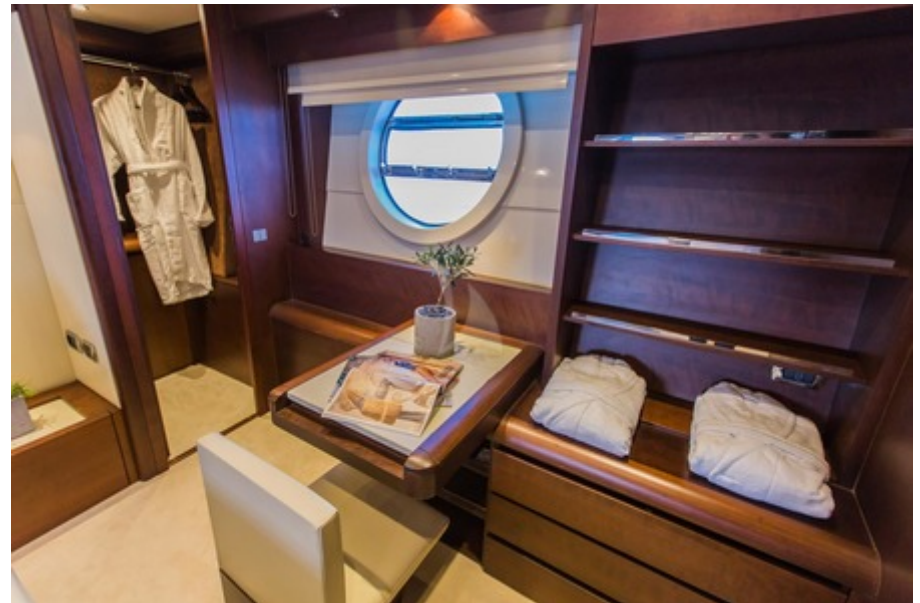
Master Dressing room