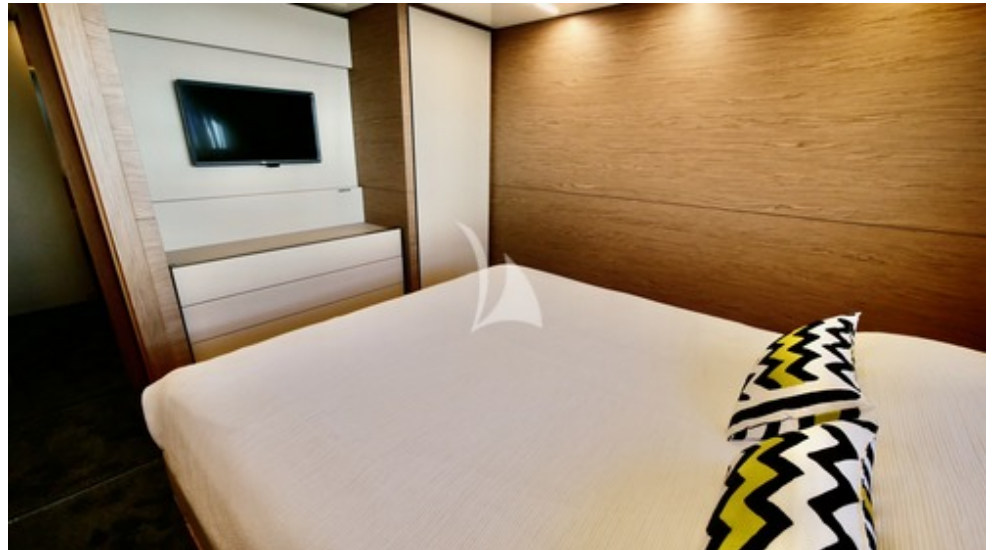
VIP ensuite 2