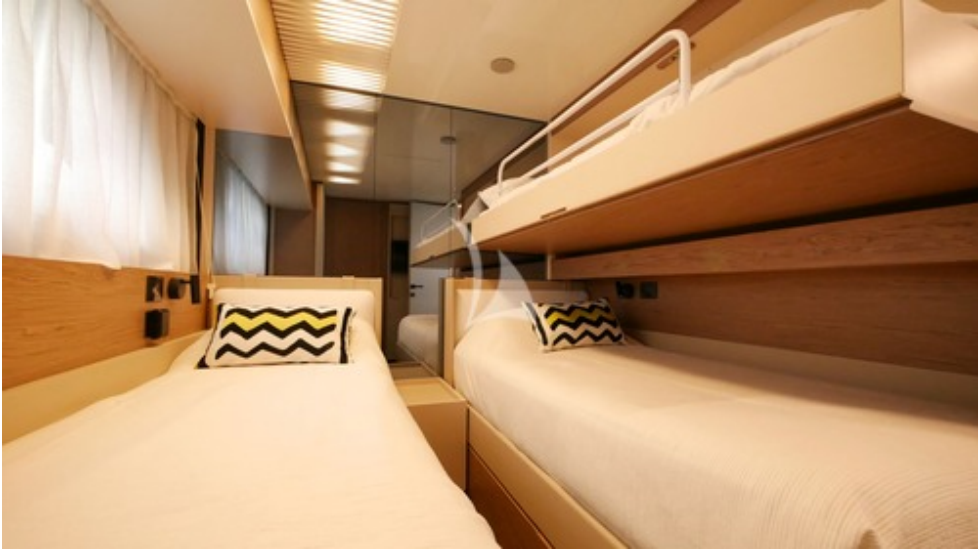
Twin cabin 2