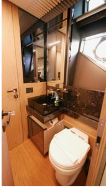
Twin cabin bathroom