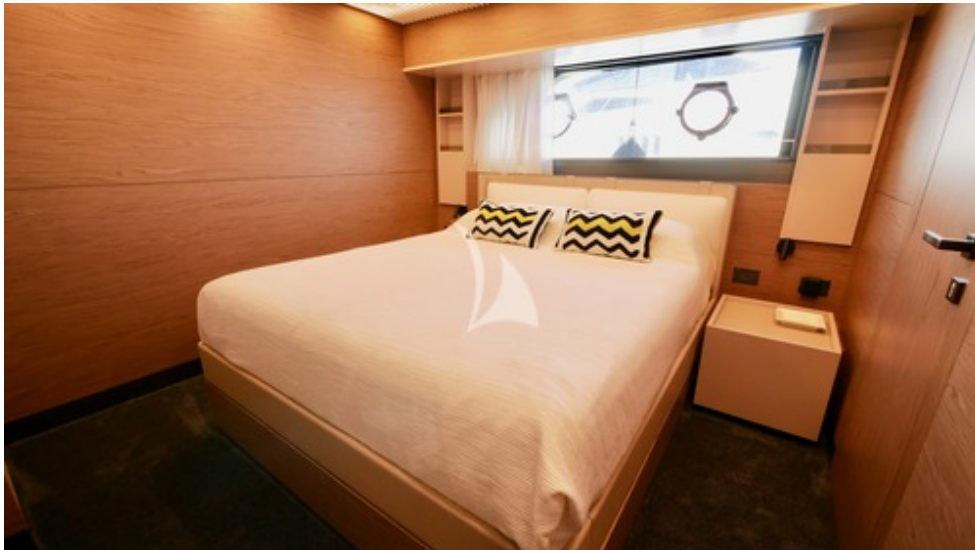
VIP ensuite 1