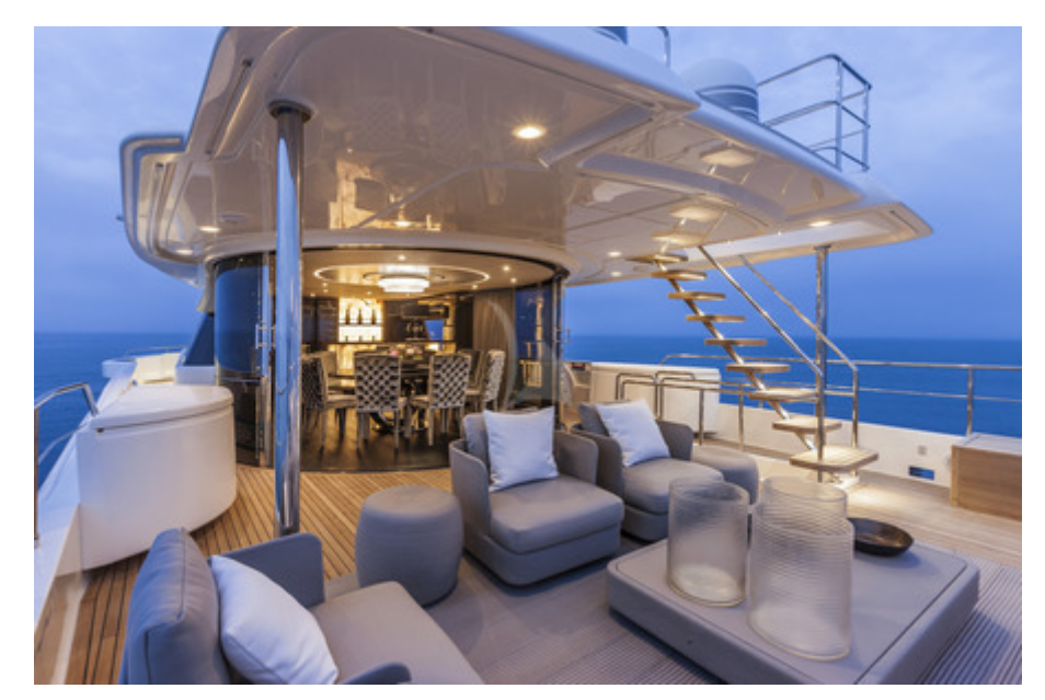
Fly bridge Dining Area