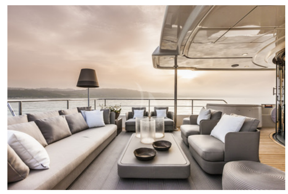
Saloon fly bridge