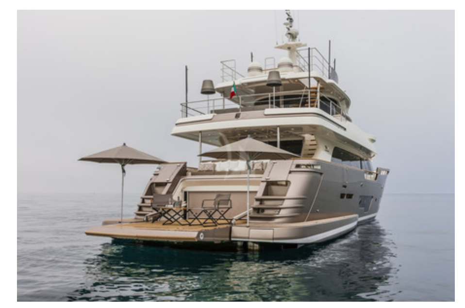
MY YVONNE VIEW