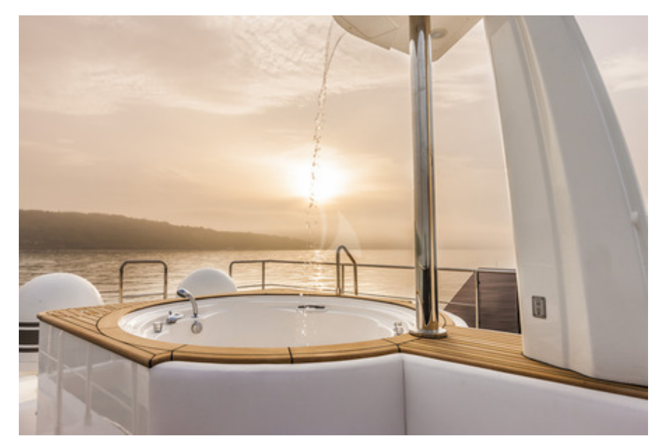
Jacuzzi on the second fly bridge