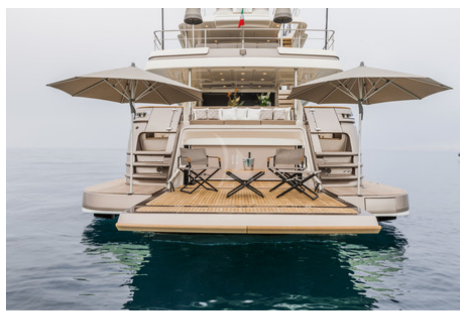
MY YVONNE VIEW